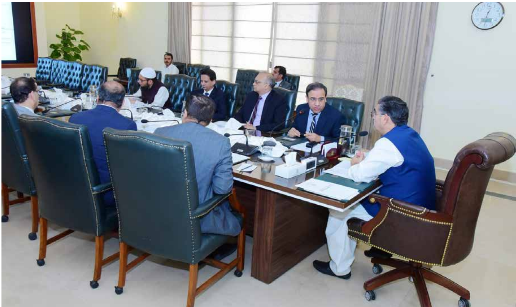
ISLAMABAD: Caretaker Prime Minister Anwaar-ul-Haq Kakar chairs a briefing on Information Technology and Telecom Sector.