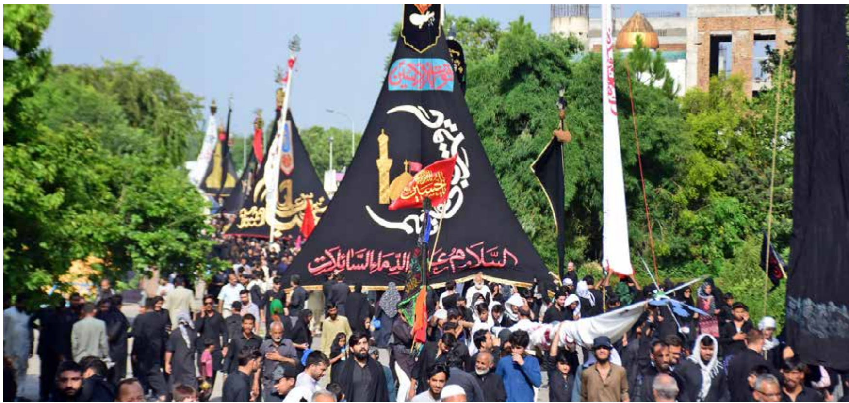
ISLAMABAD: A large number of the Shiite Muslims are participating in the procession of Chehlum of Hazrat Imame-Hussain (RA) in Federal Capital.