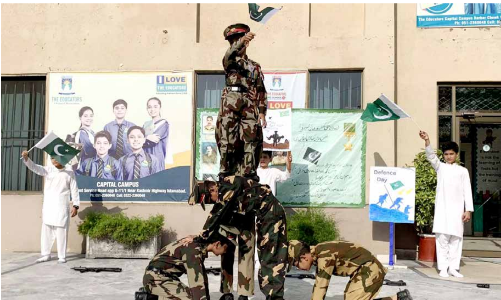
ISLAMABAD: Students of The Educators, Capital Campus, taking part in a tableo to express solidarity with the armed forces of Pakistan during the defence day celebrations.