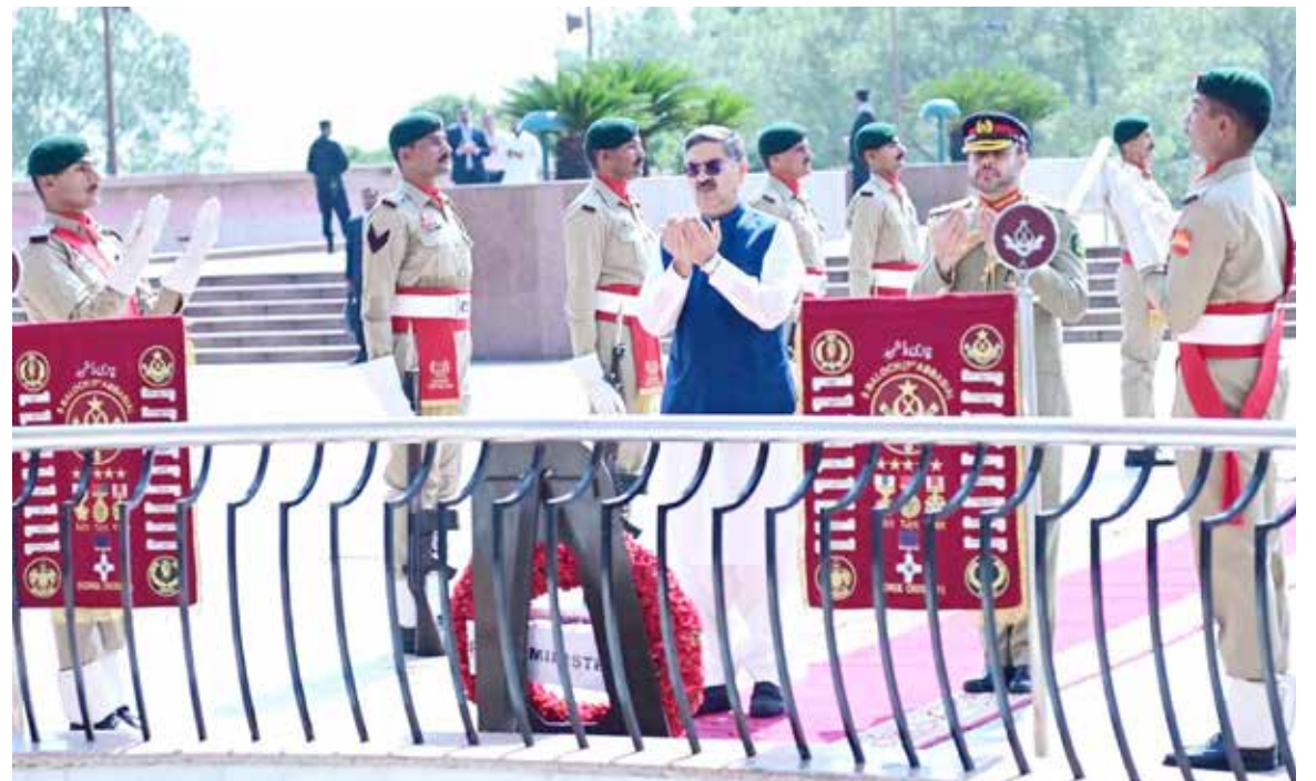
ISLAMABAD: To pay homage and tribute to the martyrs and ghazis of the 1965 war, Caretaker PM Anwarul-Haq Kakar laying floral wreath and offering dua at Pakistan Monument.