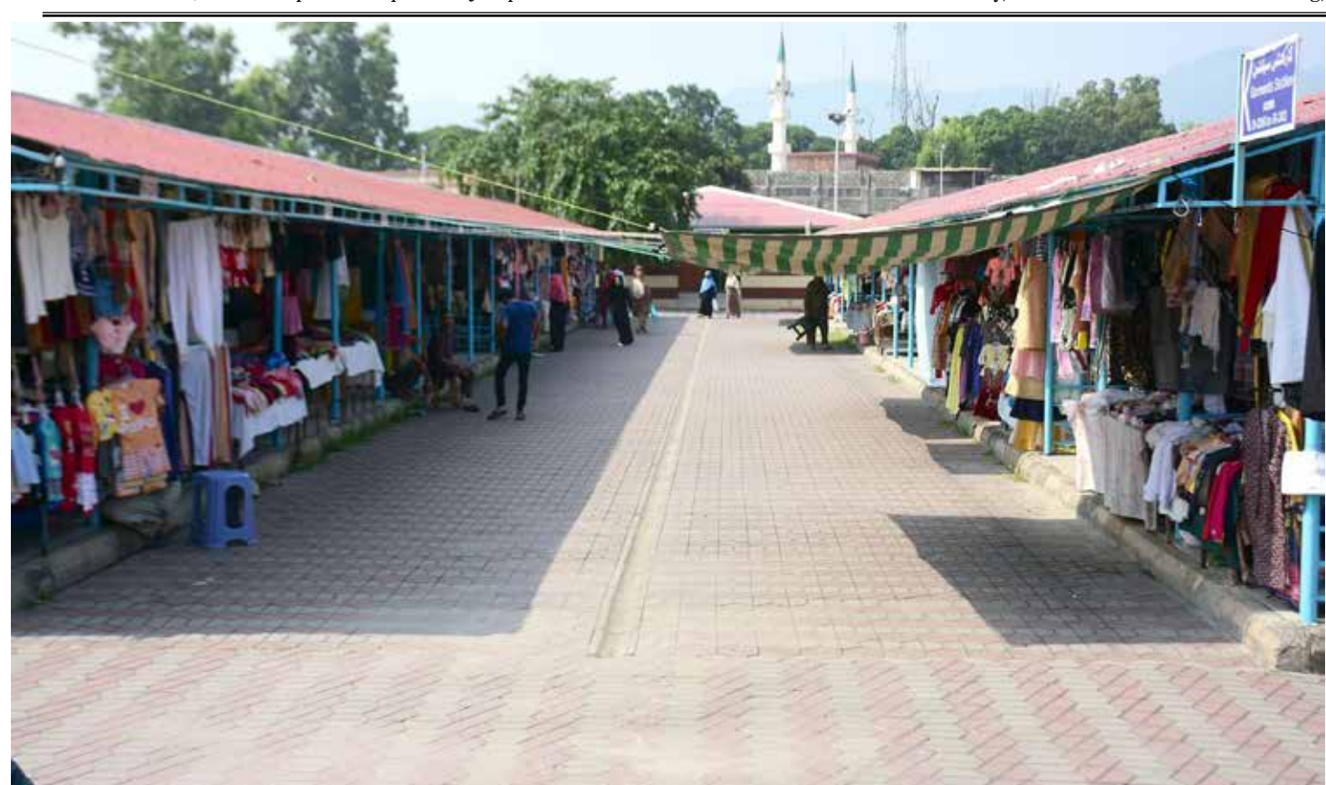
ISLAMABAD: A view of deserted Aabpara Sunday weekly bazaar in Federal Capital, due to Asia Cup 2023 super four one-day international (ODI) cricket match between India and Pakistan.