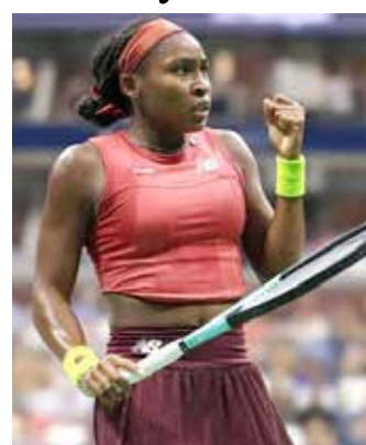
her Gauff was in trouble in the opening game, Sabalenka breaking her straight away with a rasping backhand that drew a roar of "Come On!" from the Belarusian. She held easily to take a 2-0 lead but Gauff then took advantage of a shaky service game from Sabalenka to break at 2.2 in the fourth. The Belarusian double-faulted twice to allow Gauff to get back

for the 19-year-old, who was left distraught after a first-round exit at Wimbledon in July. However, she bounced back to win titles in Washington and Cincinnati and has now landed the biggest win of her career, after a shattering loss at the French Open last year. "It means so much to me," an elated Gauff said afterwards. "I feel like I'm a little bit in shock in this moment. That French Open loss [last year] was a heartbreak for me. That makes this moment even sweeter than I could imagine." Gauff, the third American teenager to win the US Open after Tracy Austin and Serena Williams, also used her victory speech to thank those who doubted her talent. "Honestly thank you to the people who didn't believe in me," she joked. "To those who thought they were putting water on my fire, they were putting gas on my fire and I'm burning so bright right now." Aryna Sabalenka breaking