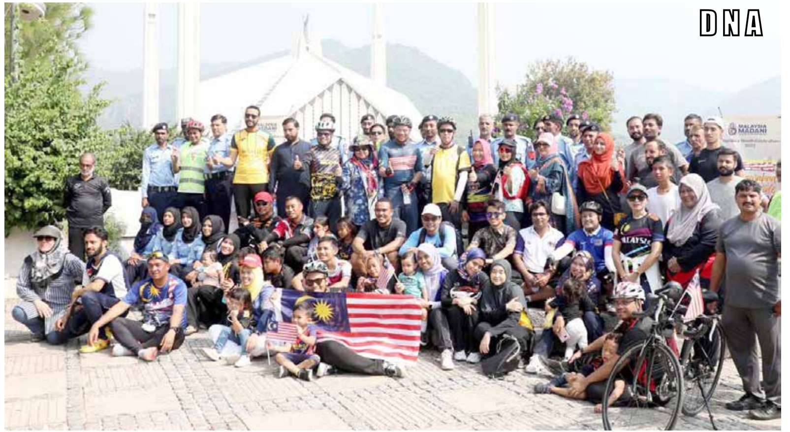
Apart from nurturing the spirit of patriotism among Malaysians in Pakistan, particularly to the younger generations, the event also strengthened further the bond and unity among Malaysian and Pakistani staff members of the High Commission.