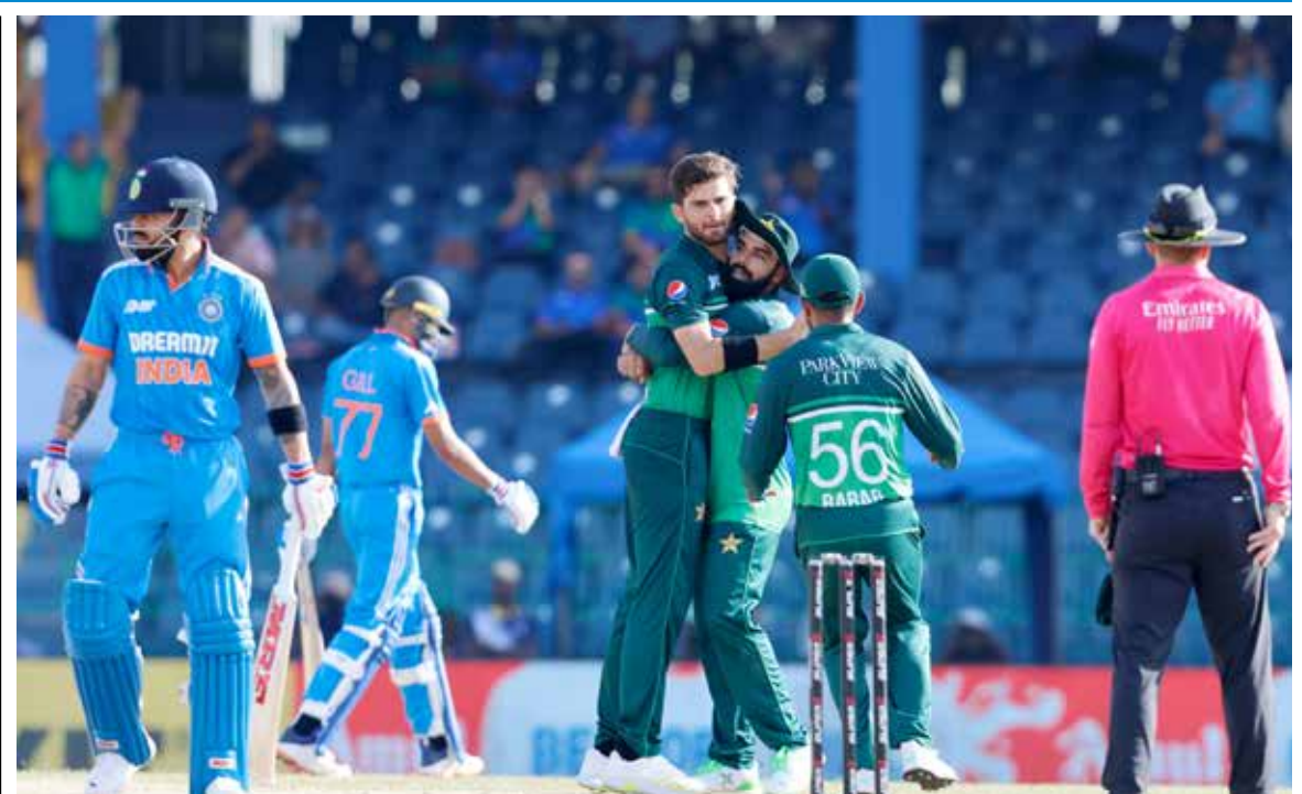
COLOMBO: Shaheen Shah Afridi along with Shadab and Babar Azam celebrating wicket against India during Asia Cup match.