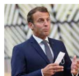
leaders' summit as a guest country at the invitation of

DHAKA : French President Emmanuel Macron will visit Bangladesh on Sunday. It will be the first visit from a French president to the South Asian nation in 33 years. Previously, former French President Mitterrand visited Bangladesh in 1990. Bangladesh's Prime Minister Sheikh Hasina, who left New Delhi for Dhaka after attending the G-20