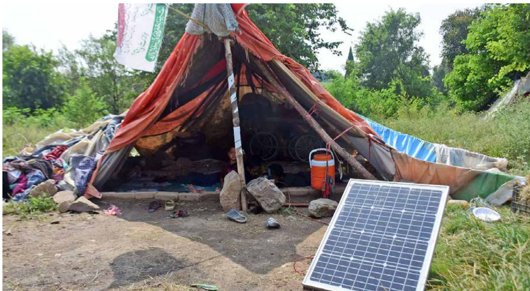
ISLAMABAD:A view of Afghan refugees installed solar panel system outside their tent house on a green belt outside Press Club in Federal Capital.