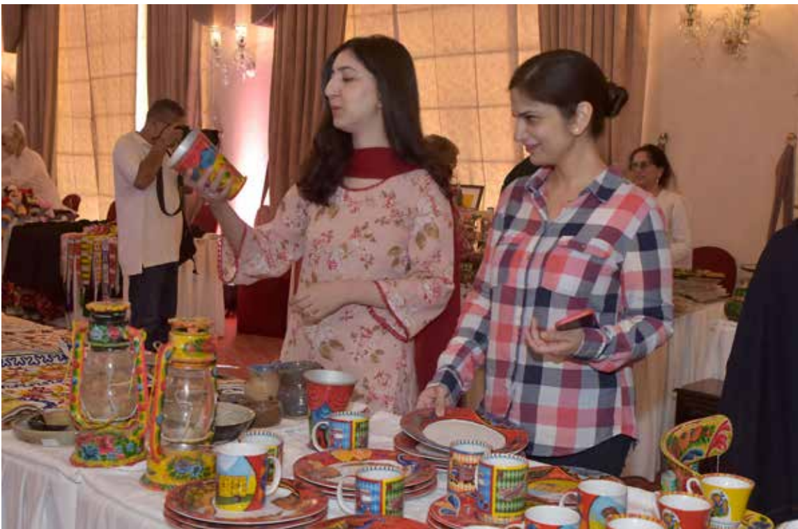
ISLAMABAD: Women taking interest in handicrafts during Arts and Crafts Bazaar held at Islamabad Serena Hotel. The Bazaar was jointly organized by Nomad and ISH.

the speedy recovery of the injured. As per reports the death toll from a strong earthquake that struck Morocco has risen to 632, said the country's Interior Ministry on Saturday. The earthquake has so far injured 329 others, including 51 in critical condition, according to the latest update of the ministry. A 6.8-magnitude earthquake hit Morocco Friday at 11:11 p.m. local time (2211 GMT) at a depth of 18.5 km some 70 km southwest of Marrakesh, said the U.S. Geological Survey. US Geological Survey (USGS) said that "the population in this region lives in structures that are highly vulnerable to earthquake shaking." USGS said: "The epicenter of the earthquake was at a relatively shallow depth of 18.5 km (11.5 miles) and occurred about 72 km (44 miles) southwest of Marrakesh and 56 km west of the Atlas Mountain town of Oukaimeden at just after 11pm local time (2200 GMT)."