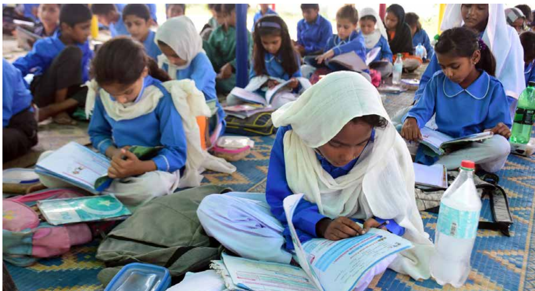
ISLAMABAD: Students are taking lessons at open sir "Pehli Kiran School" at Golra area, which is back by NGO, to fulfill the Needs of Underprivileged Children in Pakistan For A Promising Future.