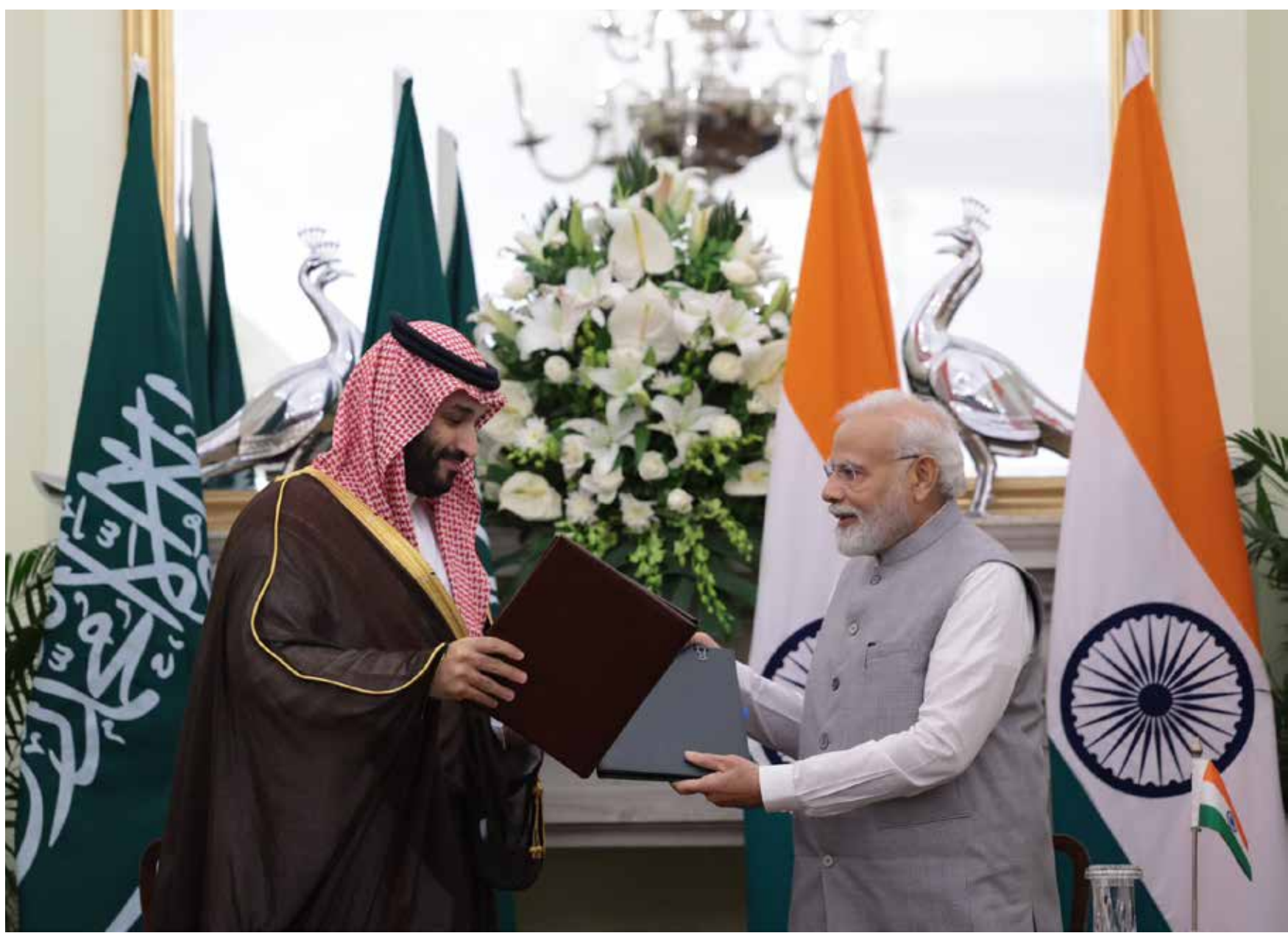
NEW DELHI: Prince Mohammed bin Salman bin Abdulaziz Al Saud and the Indian Prime Minister Narendra Modi exchange documents during MBS visit to India. The scope for cooperation in grid connectivity, renewable energy, food security, semiconductors and supply chains is immense was discussed during the meeting. —DNA

TRIPOLI : The head of Libya's Tripoli-based unity government, Abdul Hamid Dbeibeh, on Monday declared areas exposed to floods as "disaster zones". In a statement, Dbeibeh ordered local authorities "to take urgent and exceptional measures to confront the repercussions of the floods." "We have given clear instructions to all ministries, agencies, rescue teams, and hospitals to carefully follow up on the situation in the eastern region," he added. Meanwhile, Osama Hamad, head of the East Libya-based government, declared the city of Derna a "disaster zone" following floods caused by Mediterranean Storm Daniel. The United Nations Mission in Libya (UNSMIL) said it is "closely following the emergency caused by severe weather conditions in the eastern region of the country." "We express our heartfelt condolences to the families of those who have lost their lives and our thoughts for all people affected," UNSMIL said. Storm Daniel swept several areas in eastern Libya on Sunday.—Agencies