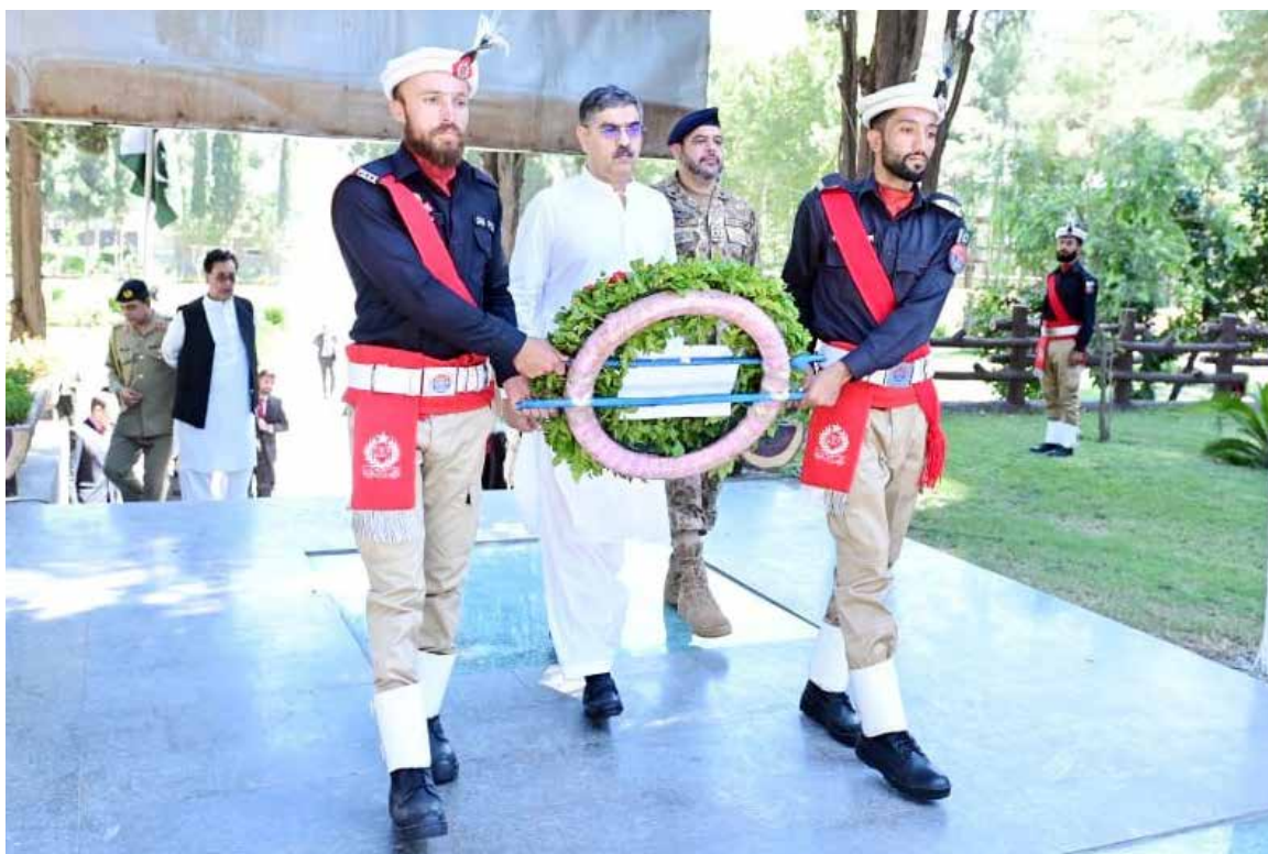
GILGIT: Caretaker PM Anwaar-ul-Haq Kakar laid floral wreath at the martyrs' monument at the Chief Minister Secretariat in Gilgit and offered fateha.

2022. The government of Azerbaijan facilitates Pakistani tourists through an online visa which takes three hours. The Planning Minister appreciated this gesture and expressed his eagerness to explore opportunities for collaboration in the field of tourism.