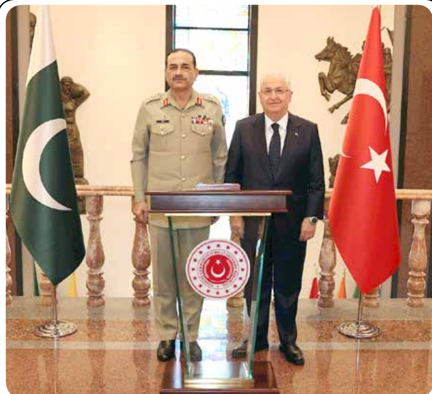
ANKARA: Chief of Army Staff, General Asim Munir meets Turkish Minister of National Defense Yasar Guler.

LOWER DIR: The Jamaat-e-Islami (JI) has announced protest and sit-in against high inflation and high electricity bills. Emir Ji Sirajul Haq said in a press conference in Tamergharh that on September 18, they will hold a protest sit-in in front of the Peshawar Governor House against the heavy electricity bills and inflation which will continue until unidentified time. Sirajul Haq said if the IPPs contracts were not revised and inflation was not controlled, they would soon announce the further action plan. The next step would be in the form of wheel jam strike, he warned.