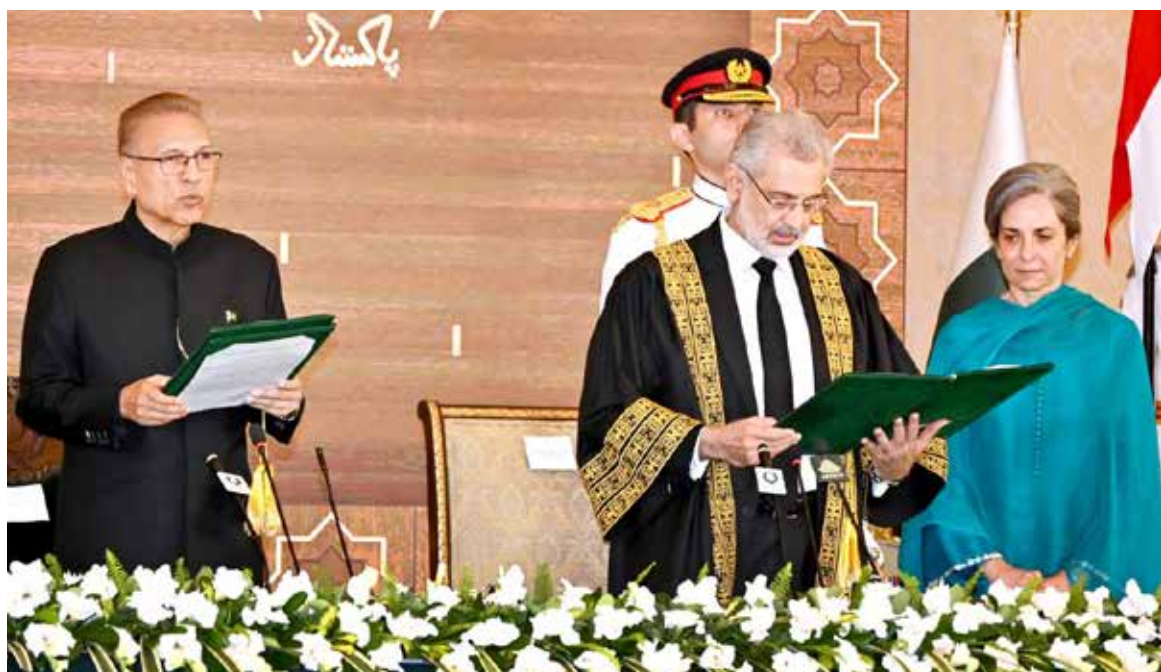
ISLAMABAD: President Dr. Arif Alvi administering the oath of office to Justice Qazi Faez Isa as Chief Justice of Pakistan, at Aiwan-e-Sadr.