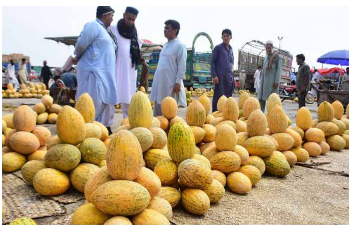
ISLAMABAD: Whole sale traders are busy in arrangements of bidding of sweet melons at Fruit and Vegetables Market at Sector II-11 in Federal Capital.—ONLINE