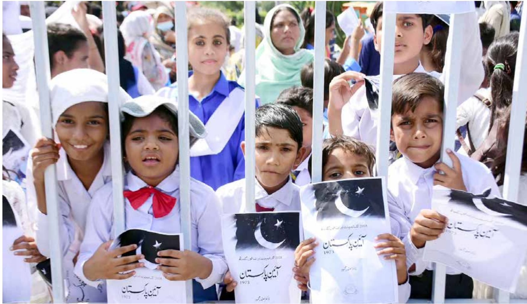
ISLAMABAD: Students of Christen Community hold national flags in their hands during a rally stands in front of closed gate at Agha Khan road, for attending in oath taking ceremony of new chief justice of Pakistan (CJP), in Federal Capital.