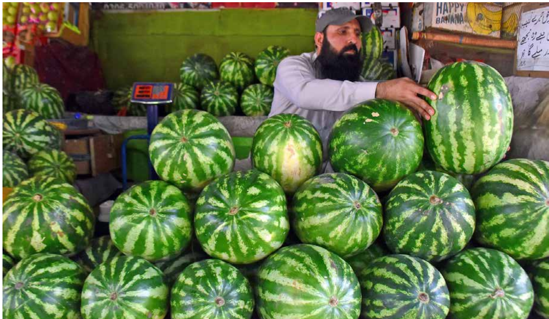
ISLAMABAD: A vendor is arranging water melons import Afghanistan at his pavilion to attract at Weekly Margala Bazaar, as the due to the off season of that fruit, people are surprise watching water melons, in Federal Capital.