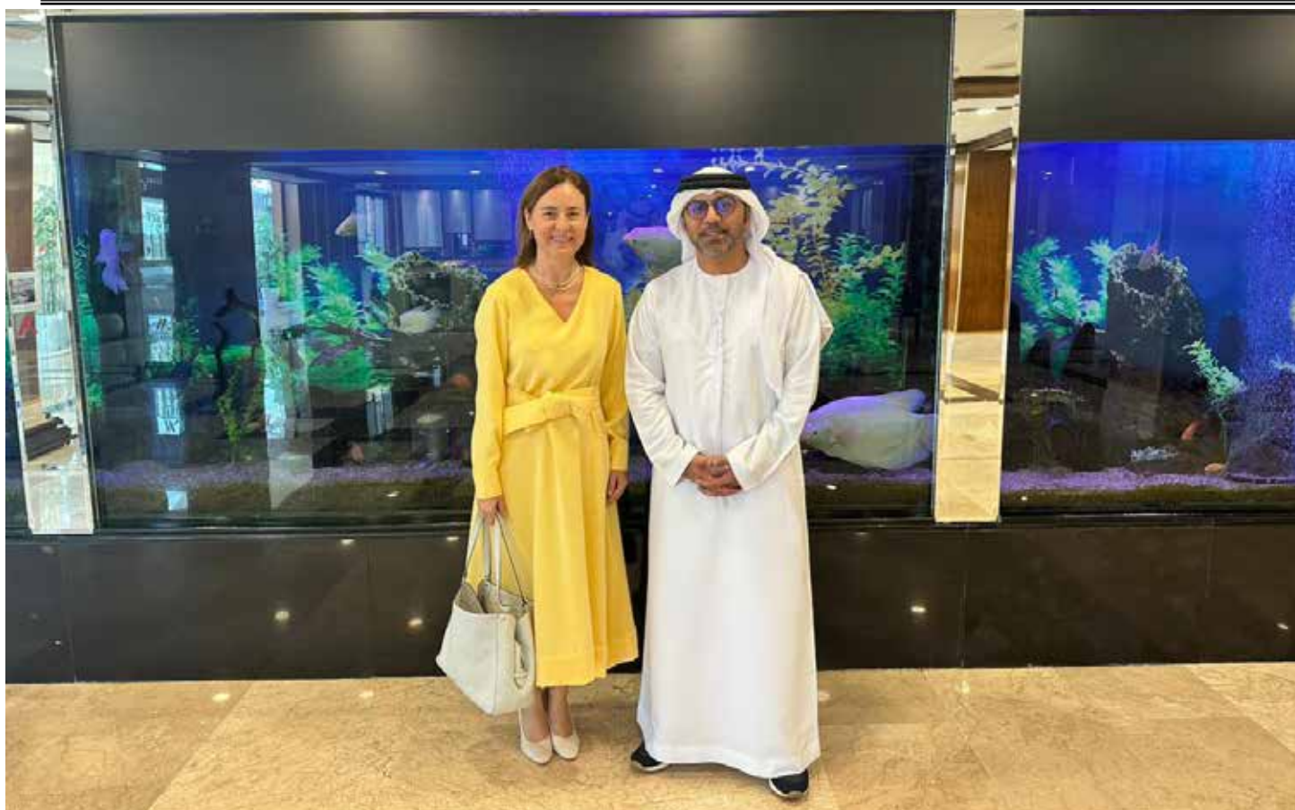
ISLAMABAD: H.E Hamad Obaid Alzaabi the Ambassador of UAE in Islamabad, meets Esther Pérez Ruiz, IMF Resident Representative in Pakistan, as joint work and bilateral cooperation and matters of mutual interest were discussed.—DNA

051 8770065 / 66 / 67 | 0300 8881811 / 0300 5221018 / 0345 5555335 UAN: 051 111 777 778 | @dinovalleypk | dinovalleypk