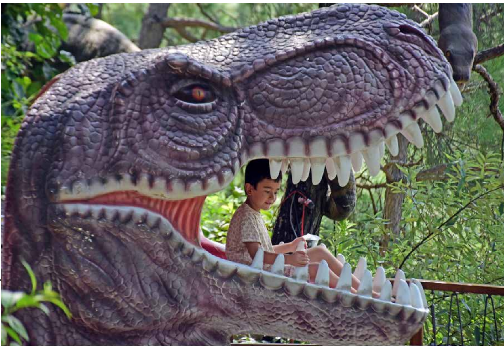
ISLAMABAD: families are enjoying at Dino Valley park as the citizen of twin cities and native area, usually visits Margalla and such tourists places, on weekend in Federal Capital.