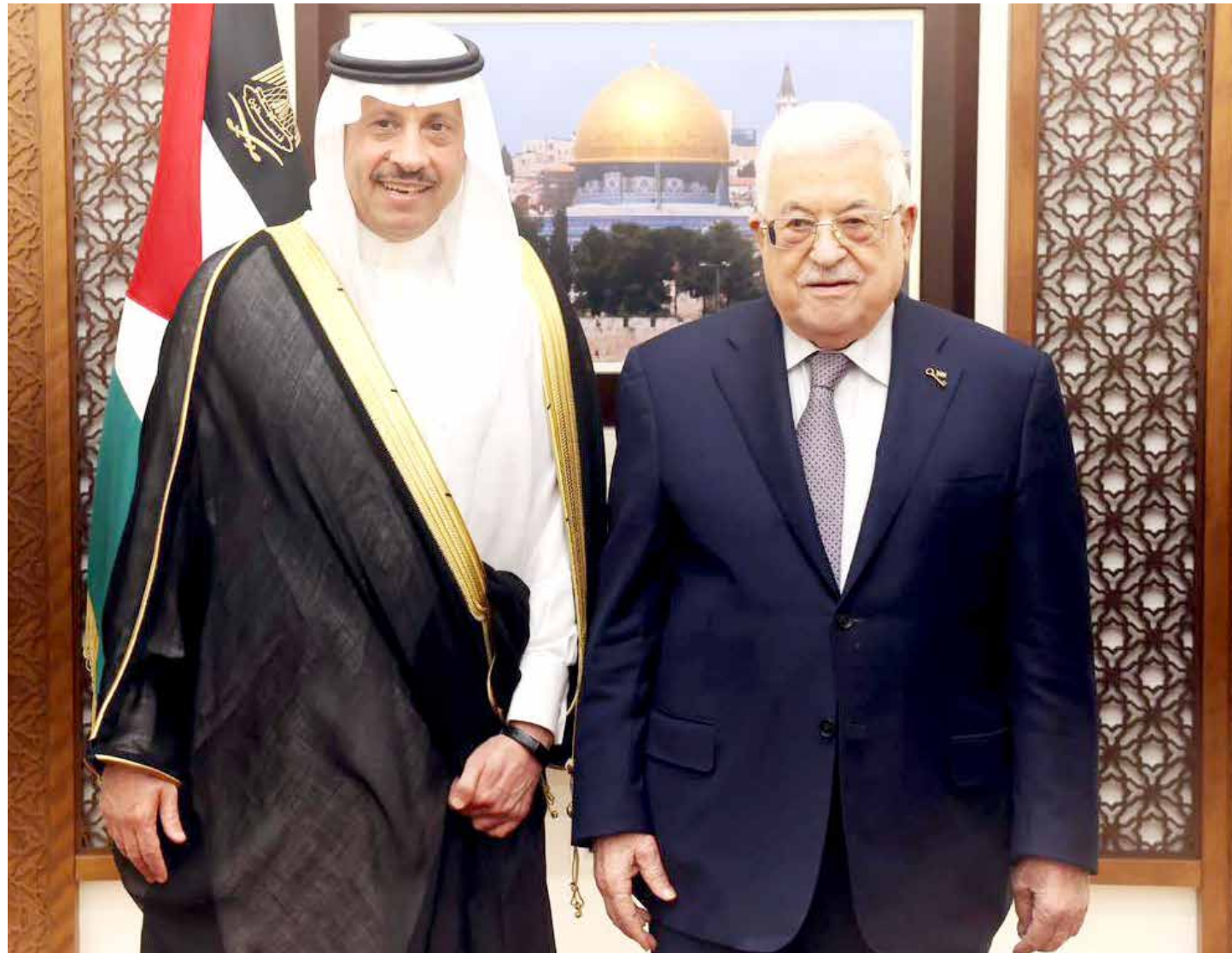
RAMALLAH: Foreign Minister Malki receives a copy of the credentials of the nonresident Ambassador of Saudi Arabia and the Consul General in Jerusalem, to the State of Palestine

On Aug. 13, the official Saudi Press Agency reported that al-Sudairi, who is also Saudi ambassador to Jordan, "formally presented a copy of his credentials as Ambassador Extraordinary and Plenipotentiary, Non-Resident Ambassador to the State of Palestine and Consul General in Jerusalem." Al-Sudairi is the first Saudi ambassador to Palestine. The Kingdom had a Consulate General in Jerusalem, but it was closed with Israel's occupation of the city in 1967, when the West Bank, including East Jerusalem, was under Jordanian administration at the time.