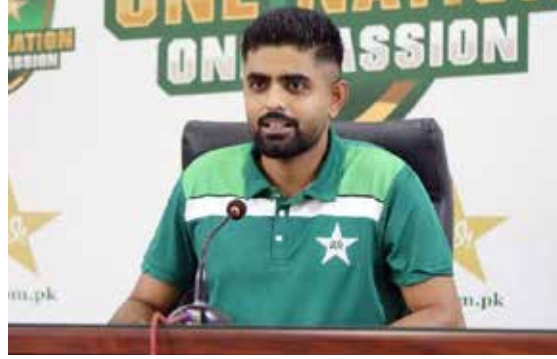
Pakistan's warm-up matches schedule: September 29 – vs New Zealand in Hyderabad October 3 – vs Australia in Hyderabad

ferent conditions, so we will plan accordingly and give our best to win the World Cup," he further added. The 28-year-old batter also backed Pakistan's squad for ICC World Cup 2023 amid criticism over the form of some players. "I believe in my team more than myself. I know my players, they are capable of winning matches singlehandedly," said Babar Azam. "These are the same players who helped Pakistan become the number-one team. I know they will give their best in the World Cup." He also showed confidence in vice-captain Shadab Khan and allrounder Mohammad Nawaz, who failed to live up to the mark in the Asia Cup. "Our spinners have had a few bad days but they are not ordinary players. They have reached here on the