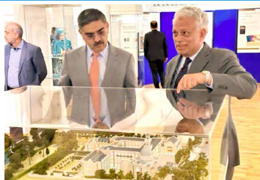
LONDON: Caretaker Prime Minister Anwaar-ul-Haq Kakar visited the Oxford Centre for Islamic Studies in London.