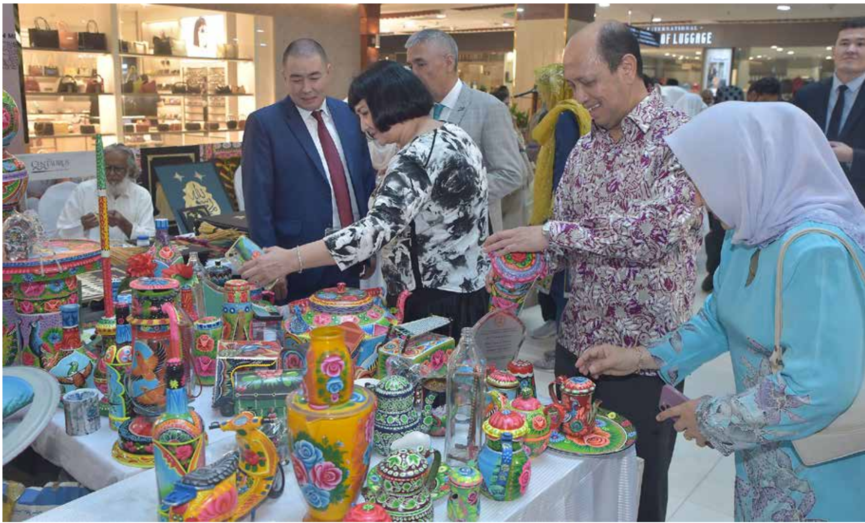
ISLAMABAD: Visitors taking interest various handicrafts during an exhibition at a local shopping mall.