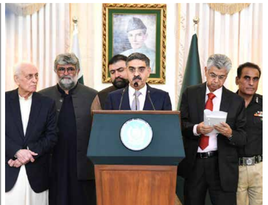
ISLAMABAD: Caretaker Prime Minister Anwaar-ul-Haq kakar addressing a press conference in Islamabad.