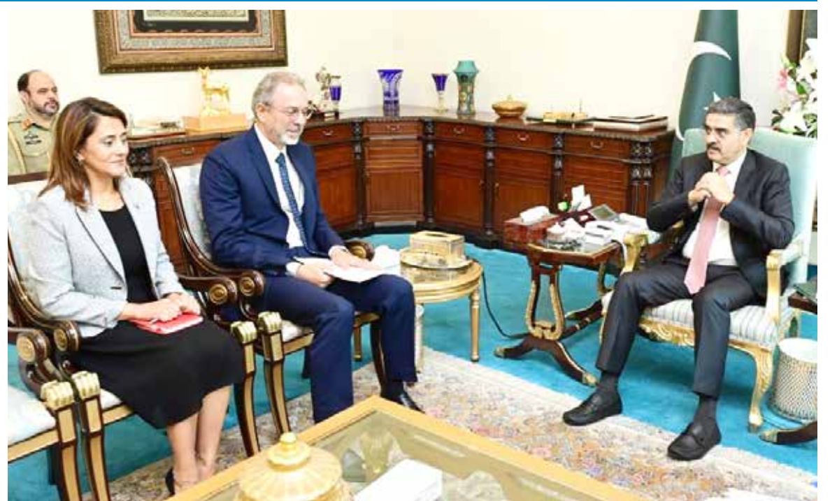
ISLAMABAD: Ambassador of Turkiye Mehmet Pacaci calls on Caretaker Prime Minister Anwaar ul Haq Kakar at PM Office.