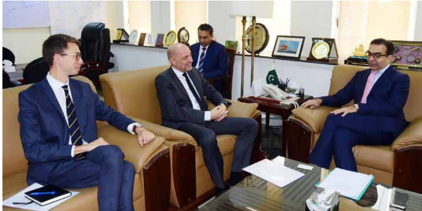
conservation measures in Pakistan as well" the ambassador said. A cross-functional team of the power sector for the future discussion and joint workshop at the Conference of Parties (COP) was proposed. Denmark has been smooth in its transition to sustainable energy. Denmark's goal has been to go green and reduce the dependence on fossil fuels and it has led smooth transition in 34.

ISLAMABAD: Caretaker Federal Minister of Energy Muhammad Ali and Ambassador of Denmark to Pakistan Jakob Linulf Thursday discussed opportunities for Green energy initiatives and energy conservation in Pakistan. During a meeting, the minister and the ambassador also discussed projects and initiatives being carried out under the Danish Energy Transition Initiative (DETI) and Investment Fund (IFU), a fund for Developing countries in Denmark, were discussed in the meeting. During the interaction, the opportunities and mechanisms for wind energy in Pakistan were also discussed in detail. The Envoy said that there has been an increase in the bilateral trade between Pakistan and Denmark particularly in the textile sector. "The next focus will be on strengthening the bilateral relations in the green and sustainable energy sector. This will extend to the energy