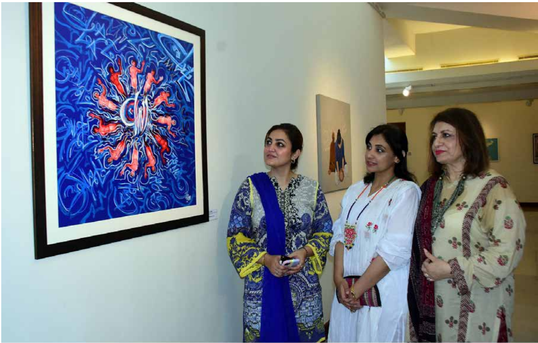
ISLAMABAD: Women are taking interest in painting during exhibition entitled "Seeking the Truth" as Organized by Nomad Gallery at Pakistan National Council of Arts in Federal Capital.