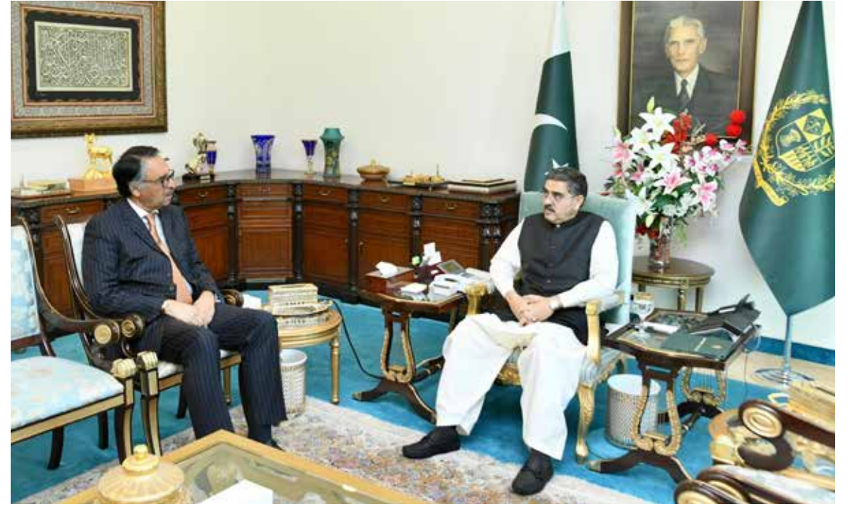
ISLAMABAD: Caretaker Foreign Minister, Jalil Abbas Jilani calls on Caretaker Prime Minister, Anwaar-ul-Haq Kakar.