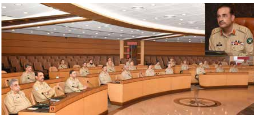
RAWALPINDI: Chief of the Army Staff General Asim Munir addressing the Corps Commanders conference, on Thursday.

Forum resolved that all terrorists will be dealt with full might of the state