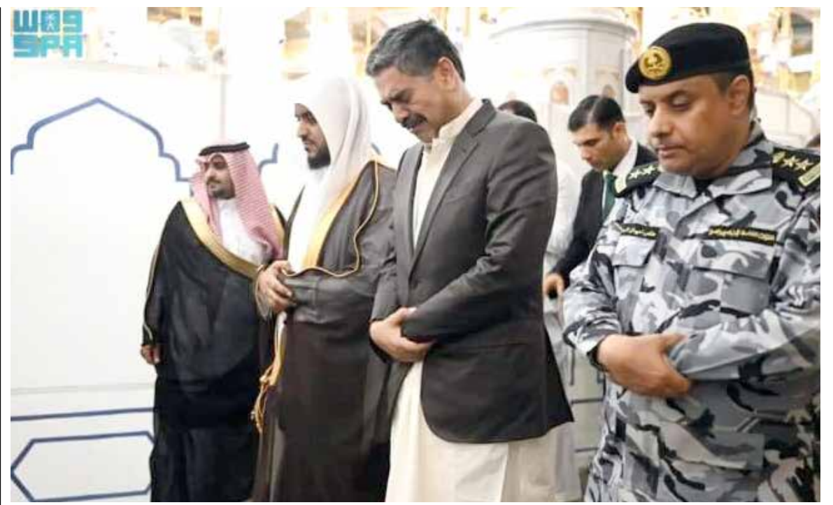
MADINAH: Interim Prime Minister Anwaar-ul-Haq Kakar paid his respects and offered Nawafil at the Roza-e-Rasool (Peace be Upon Him) in Madinah.