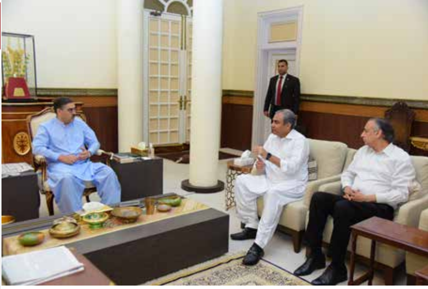
ISLAMABAD: The Caretaker Chief Minister of the Punjab Mohsin Naqvi calls on the Caretaker Prime Minister Anwaar-ul-Haq Kakar.

LAHORE: Muslim League-Nawaz (PML-N) Punjab President and former interior minister Rana Sanaullah on Sunday boasted that on October 21 history would be created at Minare-e-Pakistan under the leadership of Nawaz Sharif. In a statement, he said norms and trends in Pakistan would change on October 21. The day would mark a new beginning with hope and trust and end an era of pessimism, he added. Sanaullah said the days of prosperity seen in 2018 "are bound to return. Masses and party workers enthusiasm is rising. Nawaz Sharif is returning to Pakistan to infuse hope."