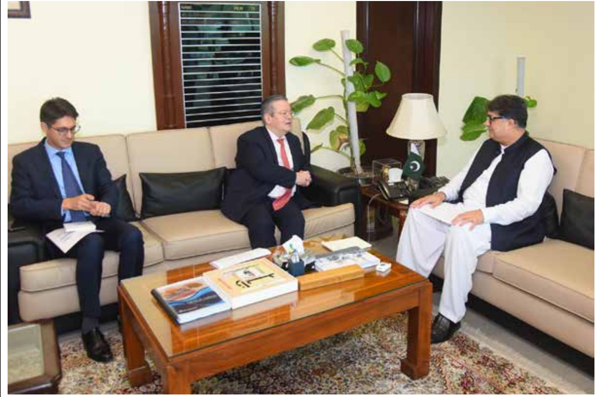
ISLAMABAD: Ambassador of France Nicolas Galey meeting with Federal Minister for Privatization Fawad Hassan Fawad.

lack of transparency, and inadequate infrastructure. He called on the government to take urgent steps to remove these obstacles and make it easier for businesses to export to the EU.