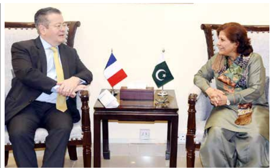
ISLAMABAD: Ambassador of France, Nicolas Galey, called on the Caretaker Federal Minister for Finance, Revenue, & Economic Affairs Dr. Shamsah Akhtar. The meeting provided an opportunity to discuss economic relations between Pakistan and France and collaborative efforts in various sectors.