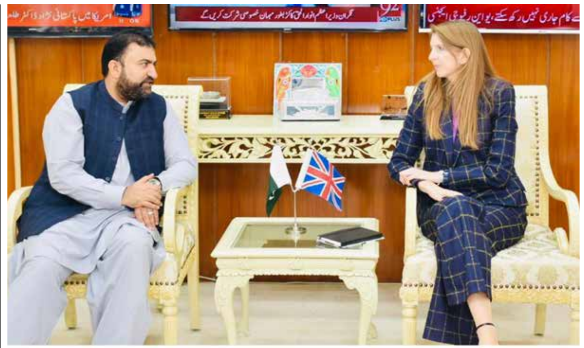
ISLAMABAD : British High Commissioner Jane Marriott meeting with Caretaker Federal Minister for Interior Sarfraz Bugti.

Interim Minister for Human Rights Khalil George said the ministry was raising awareness about physically challenged persons through various activities and advocacy programmes. He said the special needs school under the ministry was providing education through Braille and other modern assistive gadgets. The visually impaired children presented a tableau on the national song 'Dil Dil Pakistan'. The president distributed white canes among the visually impaired children and later al