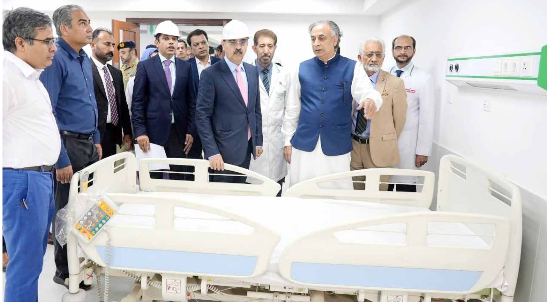
LAHORE: Caretaker PM Anwaar-ul-Haq Kakar visits the newly constructed Emergency Ward during his visit to Mayo Hospital, in Lahore.