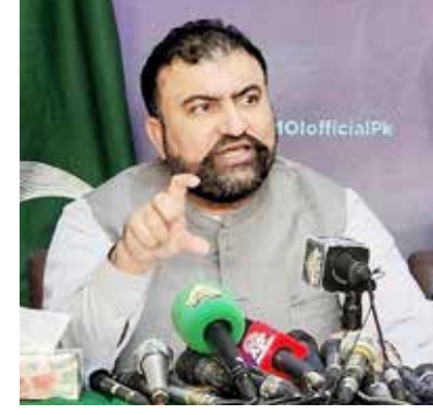
ISLAMABAD: Federal Interior Minister Sarfraz Bugti addressing a press conference.

24 attacks conducted in Pakistan out of which 14 were carried out by Afghan people: interior minister