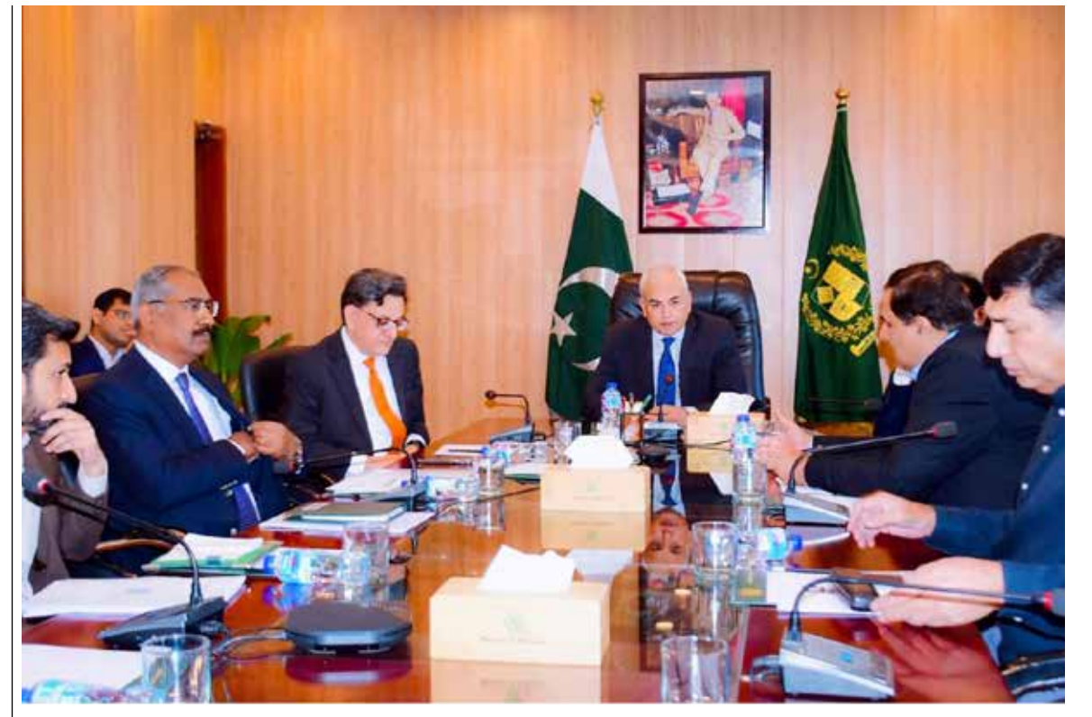
ISLAMABAD: Caretaker Federal Minister for Railways, Shahid Ashraf Tarar chairing a meeting at Ministry of Railways in Islamabad.