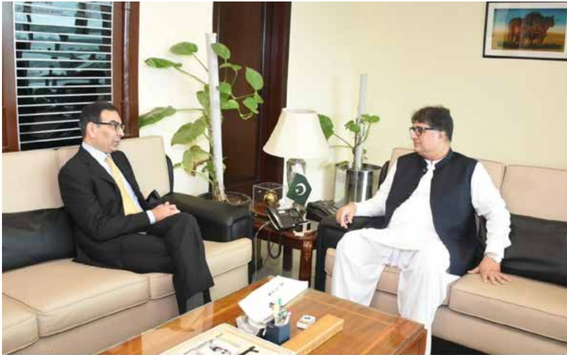
ISLAMABAD: Federal Minister for Power Muhammad Ali called on Federal Minister for Privatization Fawad Hasan Fawad.

sector departments, farmers, and allied enterprises. The session aimed to foster market linkages, networking, and partnerships between farmers and allied MSMEs with the national level private sector companies to support boosting local economies and empowering MSMEs in Khyber Pakhtunkhwa and NMDs. Through these efforts, USAID-ERDA is committed to driving economic growth, fostering partnerships, and unlocking the immense potential that exists within Khyber Pakhtunkhwa and NMD