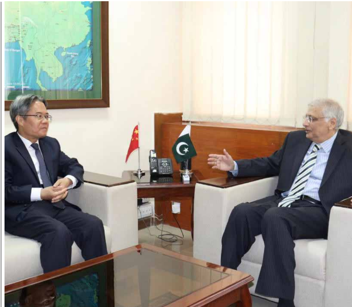
ISLAMABAD : Chinese Ambassador to Pakistan Jiang Zaidong meets with Caretaker Planning Minister for Development and Special Initiatives, Muhammad Sami Saeed.