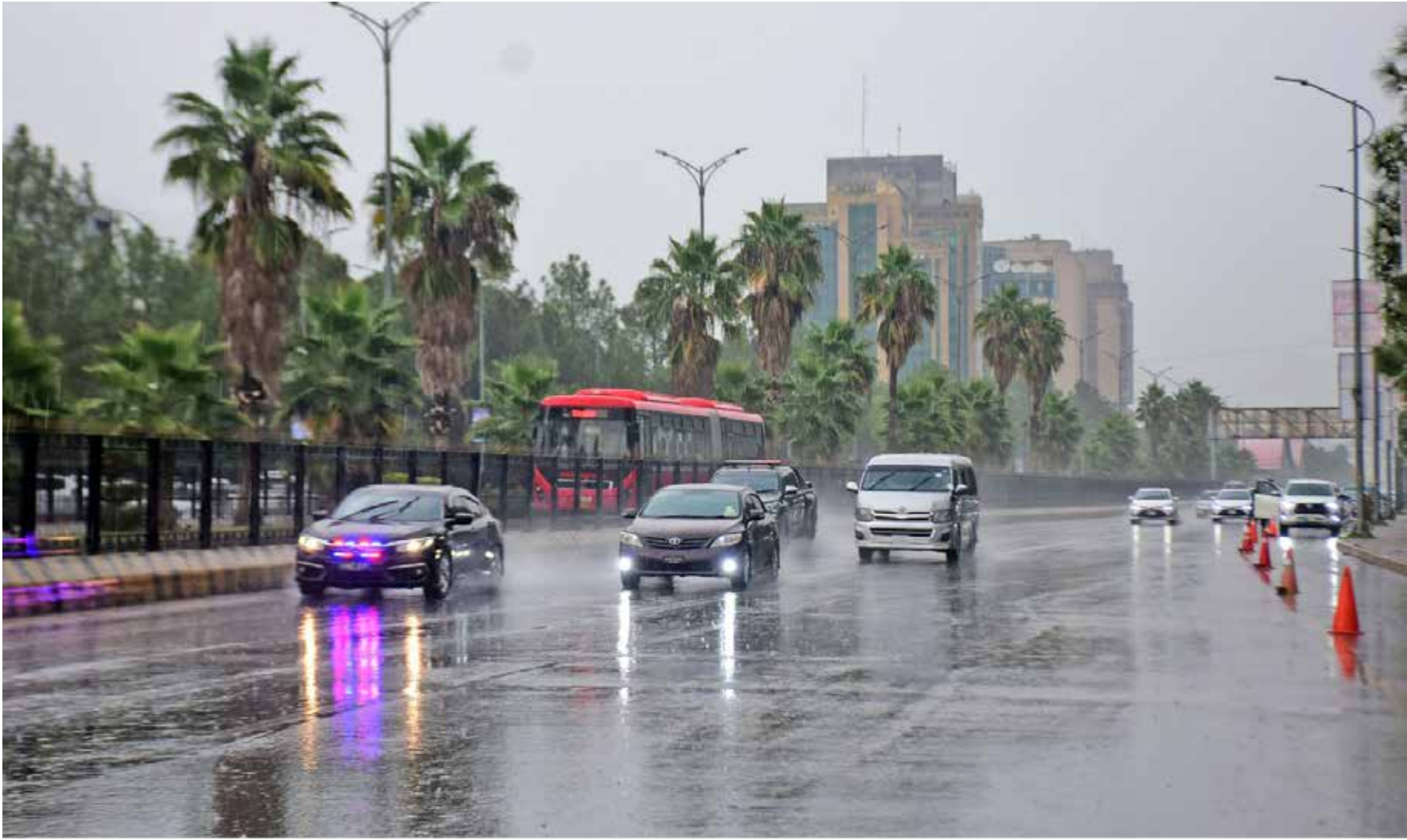
ISLAMABAD: Motorists are on their way at Jinnah Avenue during sudden heavy rain fall in Federal Capital.