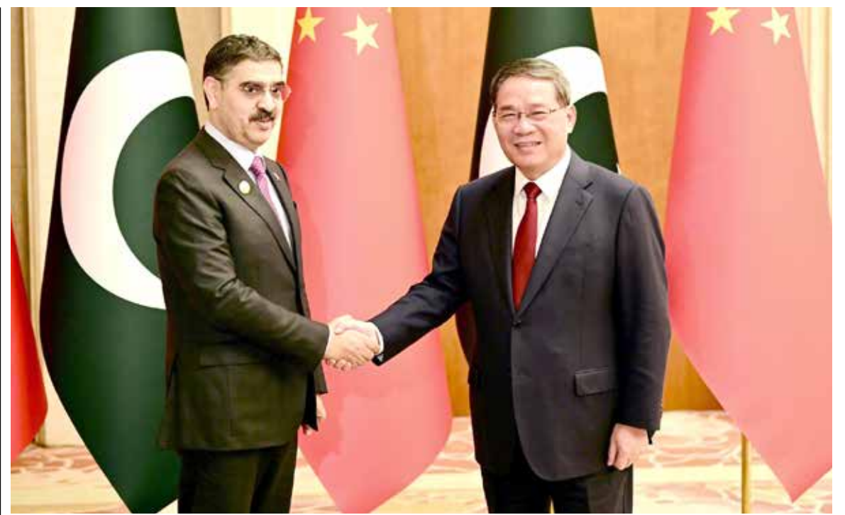
BEIJING: Caretaker Prime Minister, Anwaar-ul-Haq Kakar and Chinese Premier, Li Qiang met on the sidelines of 3rd belt and Road Forum.