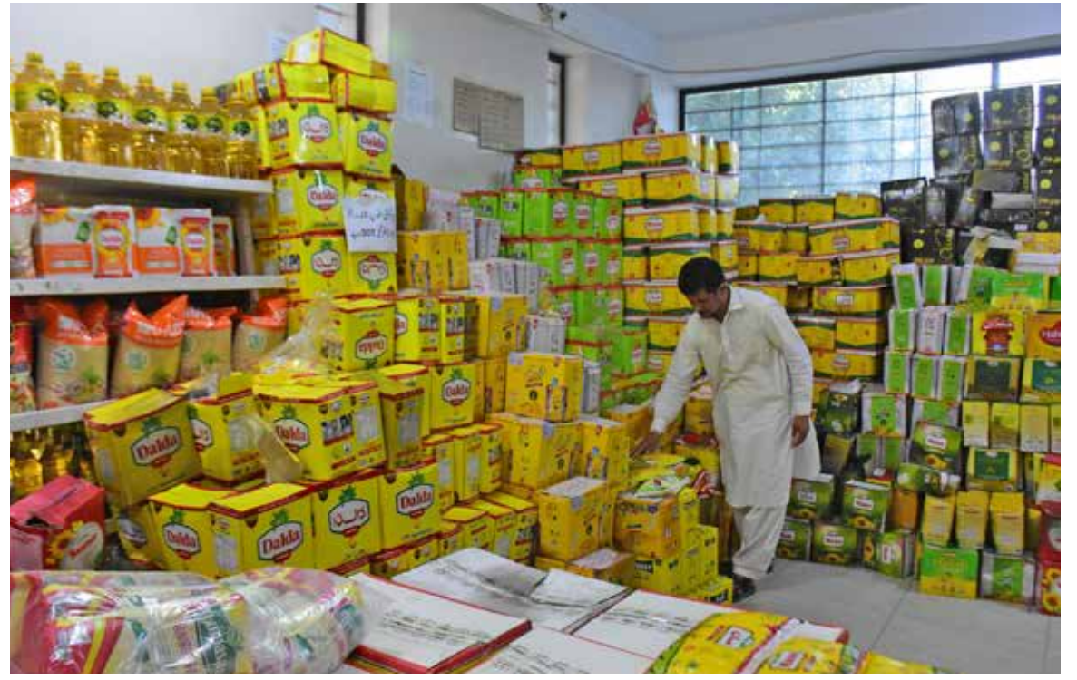
ISLAMABAD: A man is buying grocery from Utility store at Sitara Market as after the decline in dollar and fuel prices, such stuff also seems decline in prices, which a good gestures for the People in Federal Capital.

ronment for early childhood education and expand educational opportunities, especially in underserved communities, with a strong emphasis on advancing female education. Hashoo Foundation, with a rich history of promoting education, has reached 550,278 children since launching the Hashoo Schools initiative in 2002. Notably, the Child Education Support Program (CESP), benefitting 25,500 girls and 24,500 boys, and the 2022 Quality Education Program (Equip) exemplify the foundation's dedication to enhancing the educational landscape. The inauguration ceremony united key stakeholders, including representatives from UNICEF, the Elementary and Secondary Education Department (E&SED), Hashoo Foundation, the KP government, and the local community. Their significant support and contributions were greatly appreciated. Abdul Waheed, Acting Country Director of Hashoo Foundation, expressed his heartfelt satisfaction at witnessing the inception of the ECE project, a promise of a brighter future for Khyber Pakhtunkhwa's children.