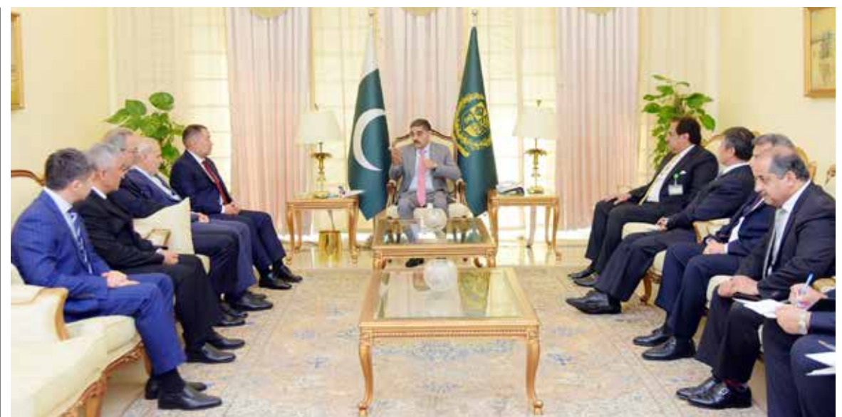
ISLAMABAD: Ambassadors of the ECO member states called on caretaker Prime Minister Anwaar-ul-Haq Kakar in Islamabad.