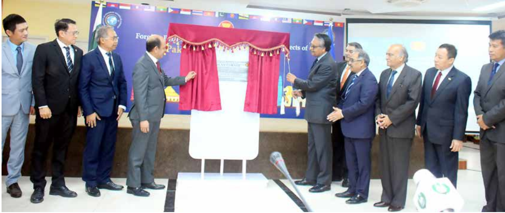
ISLAMABAD: Foreign Minister Jalil Abbas Jilani along with envoys of the ASEAN countries opening the ASEAN corner at the ISSI.