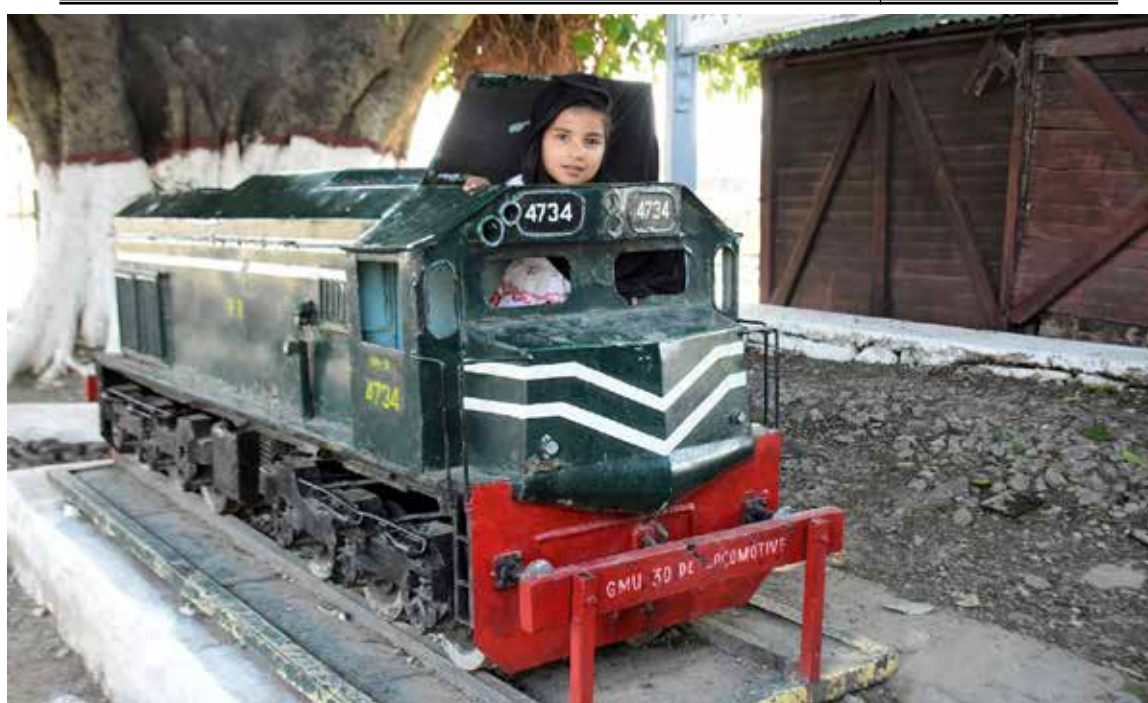
ISLAMABAD: Children are playing on the model of the train at Golra Railway Station in Federal Capital.