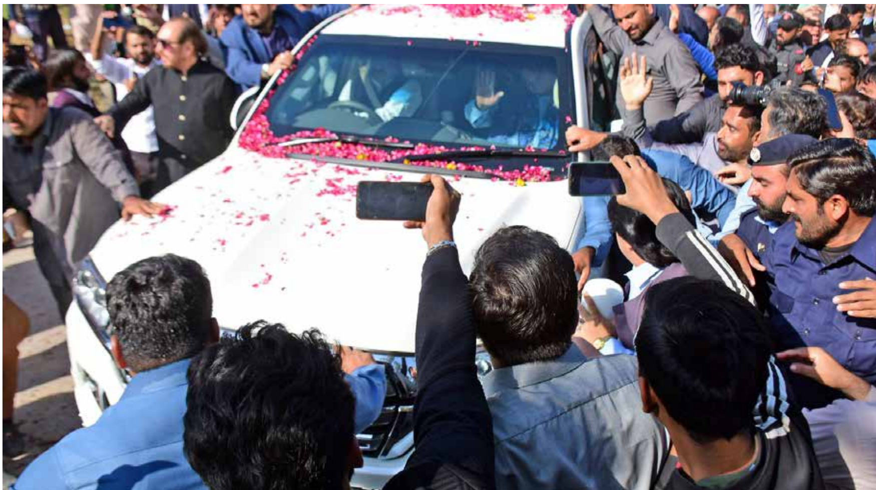
ISLAMABAD: Supporters of Pakistan Muslim League gathers around the Former Prime Minister Mian Muhammad Nawaz Sharif vehicles on his arrival at Accountably Court in Federal Capital.