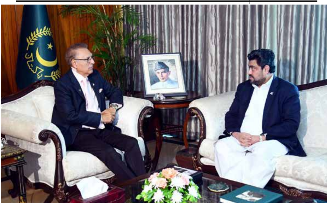
ISLAMABAD : Governor Sindh, Muhammad Kamran Khan Tessori, called on President Dr Arif Alvi, at Aiwan-e-Sadr.

Civil Aviation Authority (CAA) officials said that airports are very important for any city and it is the responsibility of the relevant organizations to ensure their security. These exercises build a close relationship and cooperation between institutions.