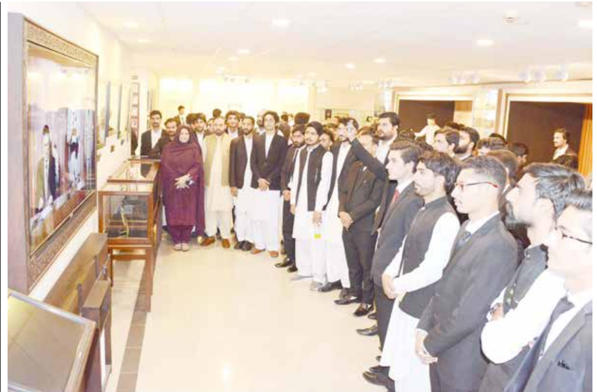
ISLAMABAD : Students and faculty members of the SHAHEED Benazir Bhutto University (Sbbu) Sheringal, Upper Dir Visiting Senate Museum At Parliament House.

A range of activities are being organized throughout the country to mark the 'Black Day', which include public rallies, seminars, webinars, panel discussions and photo exhibitions. With the active participation of Pakistani and Kashmiri Diaspora, Pakistan's diplomatic missions around the world are also arranging special events to raise global awareness about India's decades-long occupation of Jammu and Kashmir.