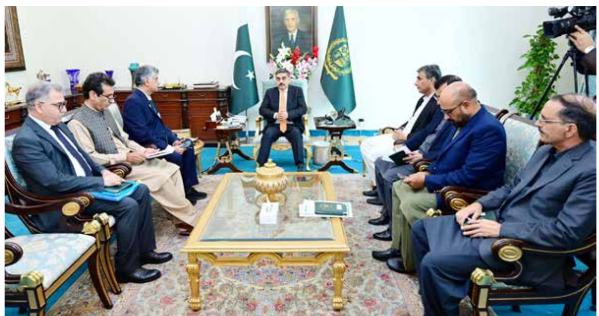
ISLAMABAD: The Caretaker Federal Minister for Information and Broadcasting Murtaza Solangi calls on the Caretaker Prime Minister Anwaar-ul-Haq Kakar.