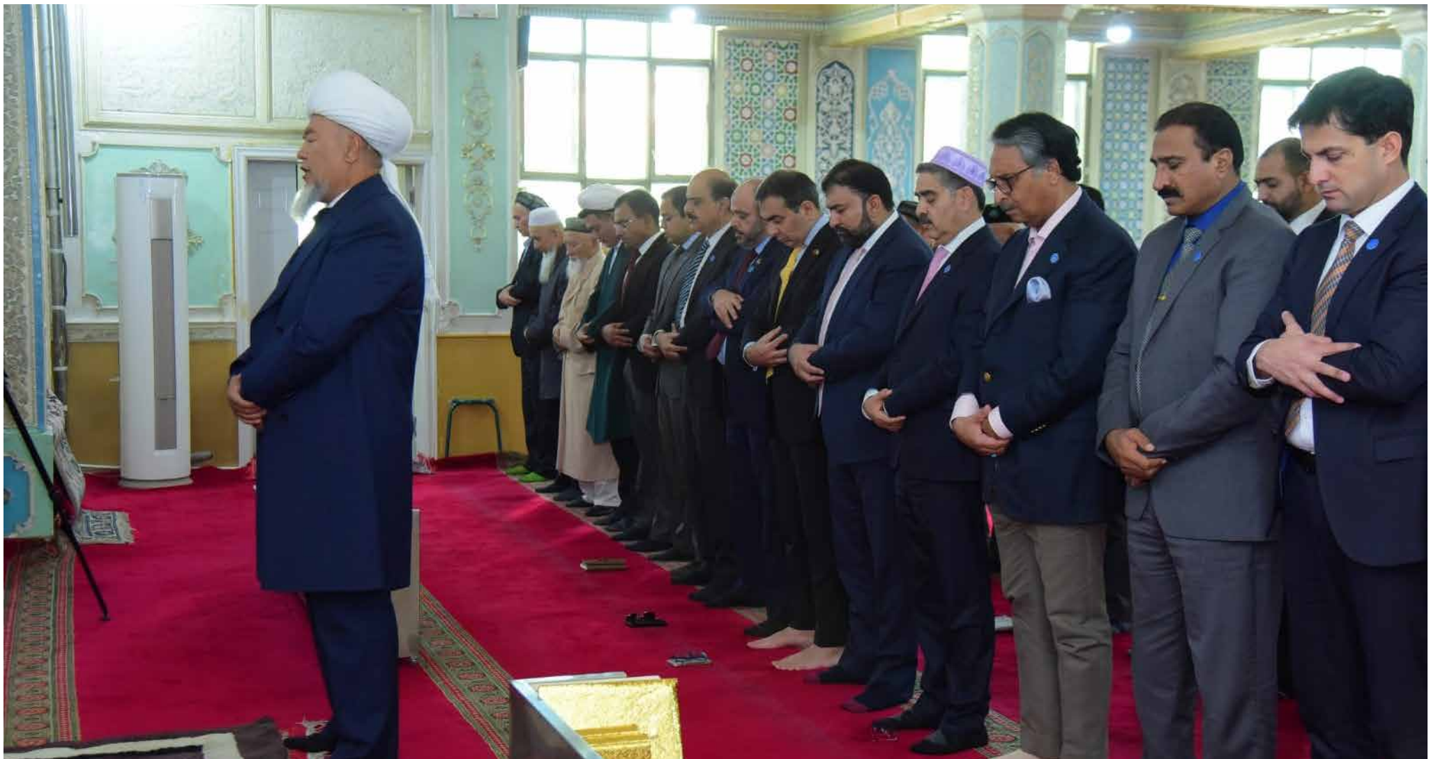
URUMQI: Caretaker Prime Minister Anwaar-ul-Haq Kakar offers prayers in a local mosque.

Norma was located about 265 miles (425 kilometers) west of Manzanillo in the western Mexican state of Colima, it said, with winds exceeding 125 miles (205 kilometers) per hour and stronger gusts. The storm was traveling northward towards the Baja California peninsula at a speed of about six miles per hour. "Some weakening is expected during the next few days, but Norma is forecast to be a hurricane when it moves near the southern portion of Baja California" by Friday night and Saturday, said the NHC. —Agencies