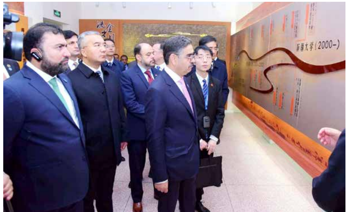
URUMQI: Caretaker Prime Minister, Anwaar-ul-haq Kakar is being briefed on the history of 99 year old Xinjiang University.

Australia beat Pakistan in crucial match Shaheen Afridi bagged his 2nd World Cup fifer