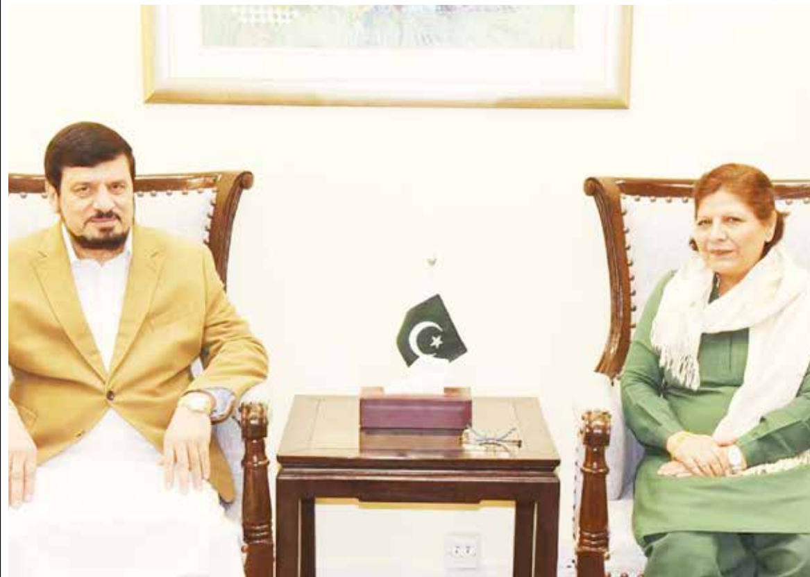
ISLAMABAD : Dr. Shamshad Akhtar, the Federal Minister for Finance, Revenue, & Economic Affairs, recently convened a productive meeting with the Governor of Khyber Pakhtunkhwa (KPK). The high-level discussion centered on key strategies and initiatives aimed at bolstering the economic development and revenue generation within the KPK region.