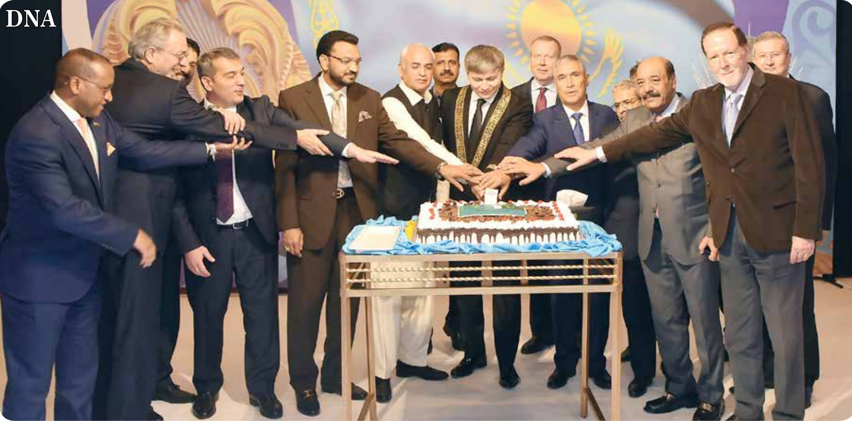
ISLAMABAD: Federal Minister for Communications Ashraf Tarar, Ambassador of Kazakhstan Erjan Kistafin and others cutting cake to celebrate the Republic Day of Kazakhstan. A fashion was also organized on the occasion, picture of which can be seen on Page 3. – DNA