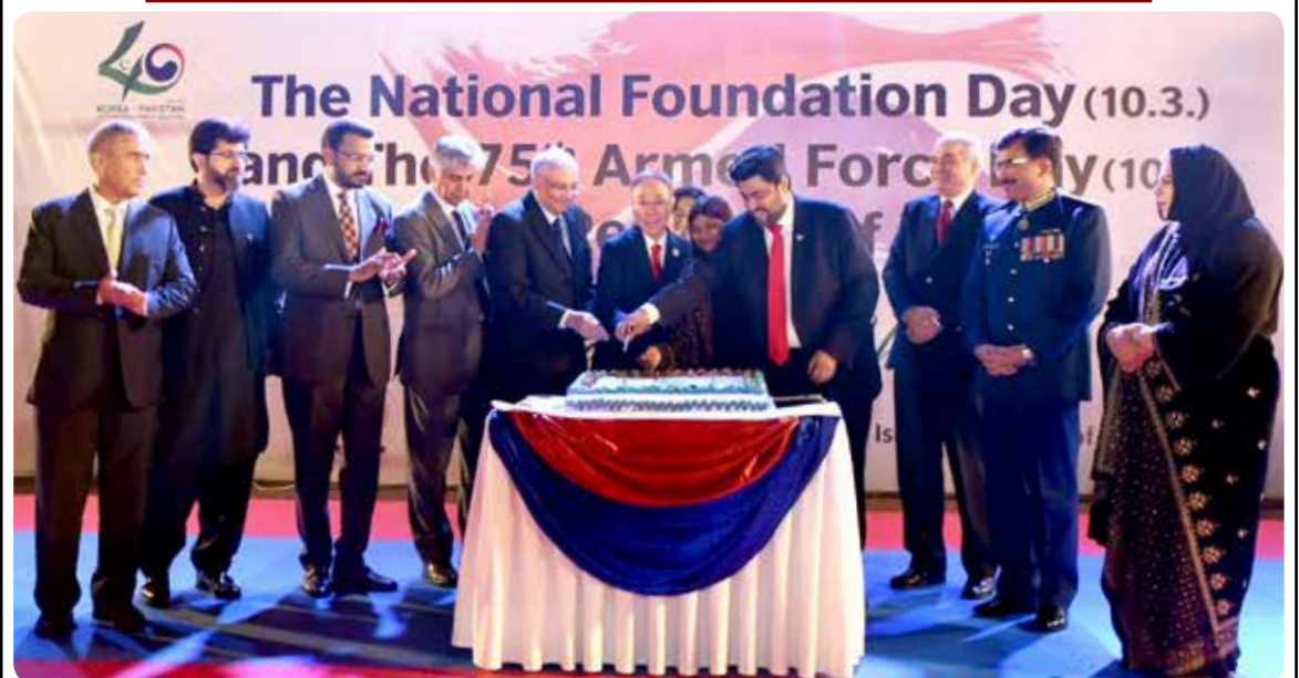
ISLAMABAD: Sami Saeed Caretaker Minister for Planning and Development along with Murtaza Solangi, Caretaker Information Minister, Governor Sindh, Kamran Tessori, Ambassador of Korea, Park Kijun and others cutting the cake on the occasion of the National Foundation Day and the Armed Forces Day of Republic of Korea. — DNA