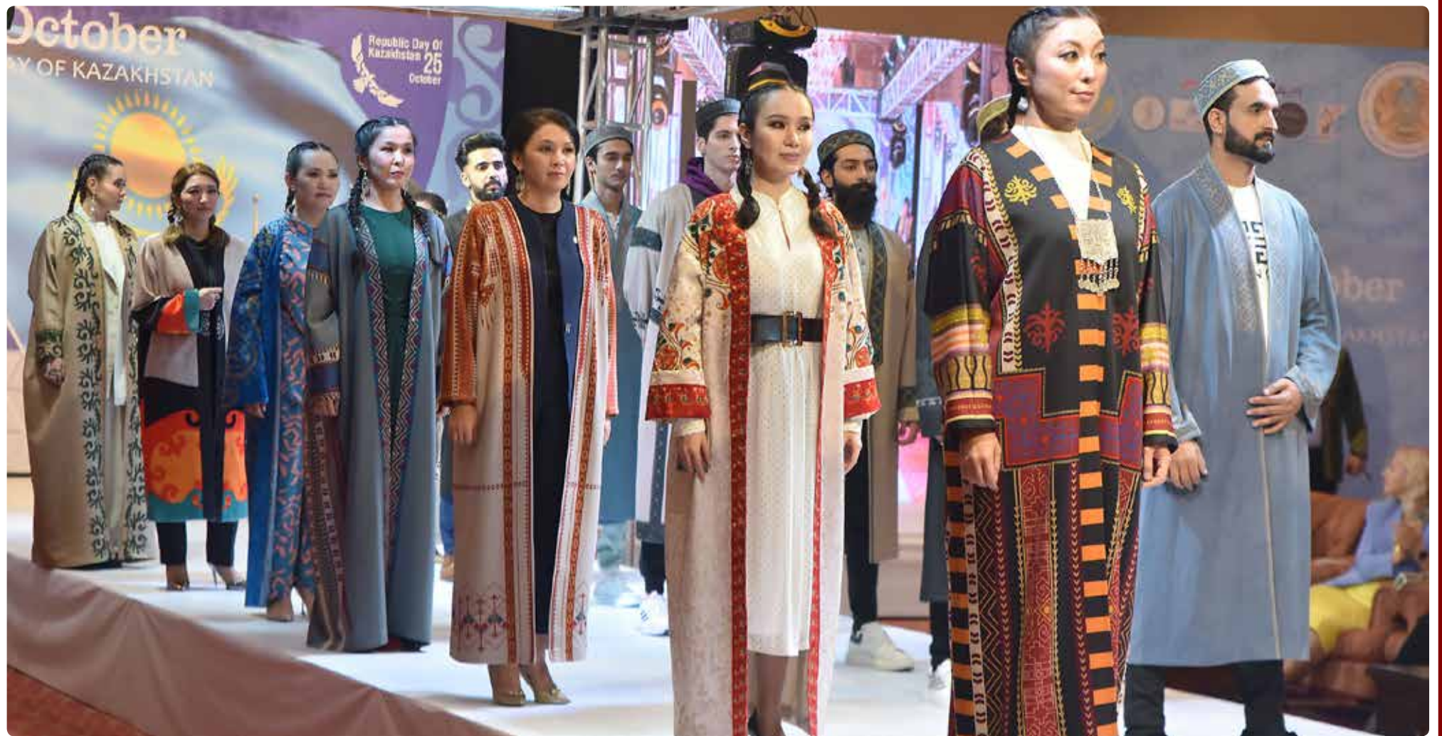
ISLAMABAD: Models taking part in a fashion show organized by the Embassy of Kazakhstan, at the Islamabad Serena Hotel, in connection with the Republic Day of Kazakhstan.