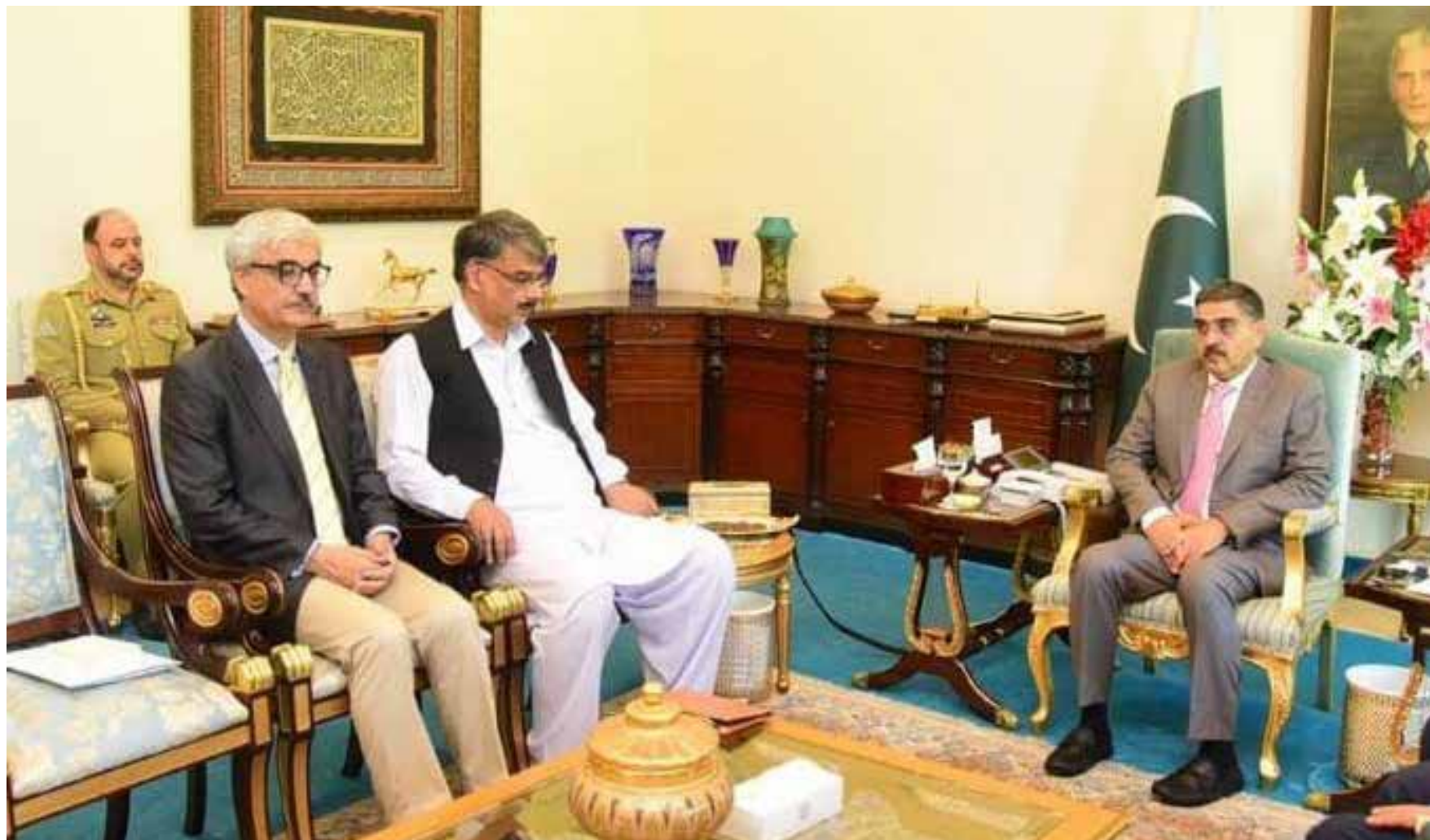
ISLAMABAD : Prime Minister AJK Chauhdary Anwar ul Haq calls on Caretaker Prime Minister Anwaar-ul-Haq Kakar.—DNA

JEDDAH: The national flag carrier of Saudi Arabia, revealed its new brand identity and livery during a milestone event in Jeddah, in the presence of Royal Highnesses, Excellencies and leaders from both the public and private sectors, as well as prominent media correspondents and aviation experts. This new identity is in line with a wider strategic digital transformation plan aimed at strengthening the airline's support for the Kingdom's Vision 2030 to bring the world to Saudi Arabia. The rebrand marks the beginning of a new era for Saudia, introducing innovative concepts in terms of customer services with a strong focus on digital aspects and enhancing the guest experience by celebrating Saudi culture.—APP