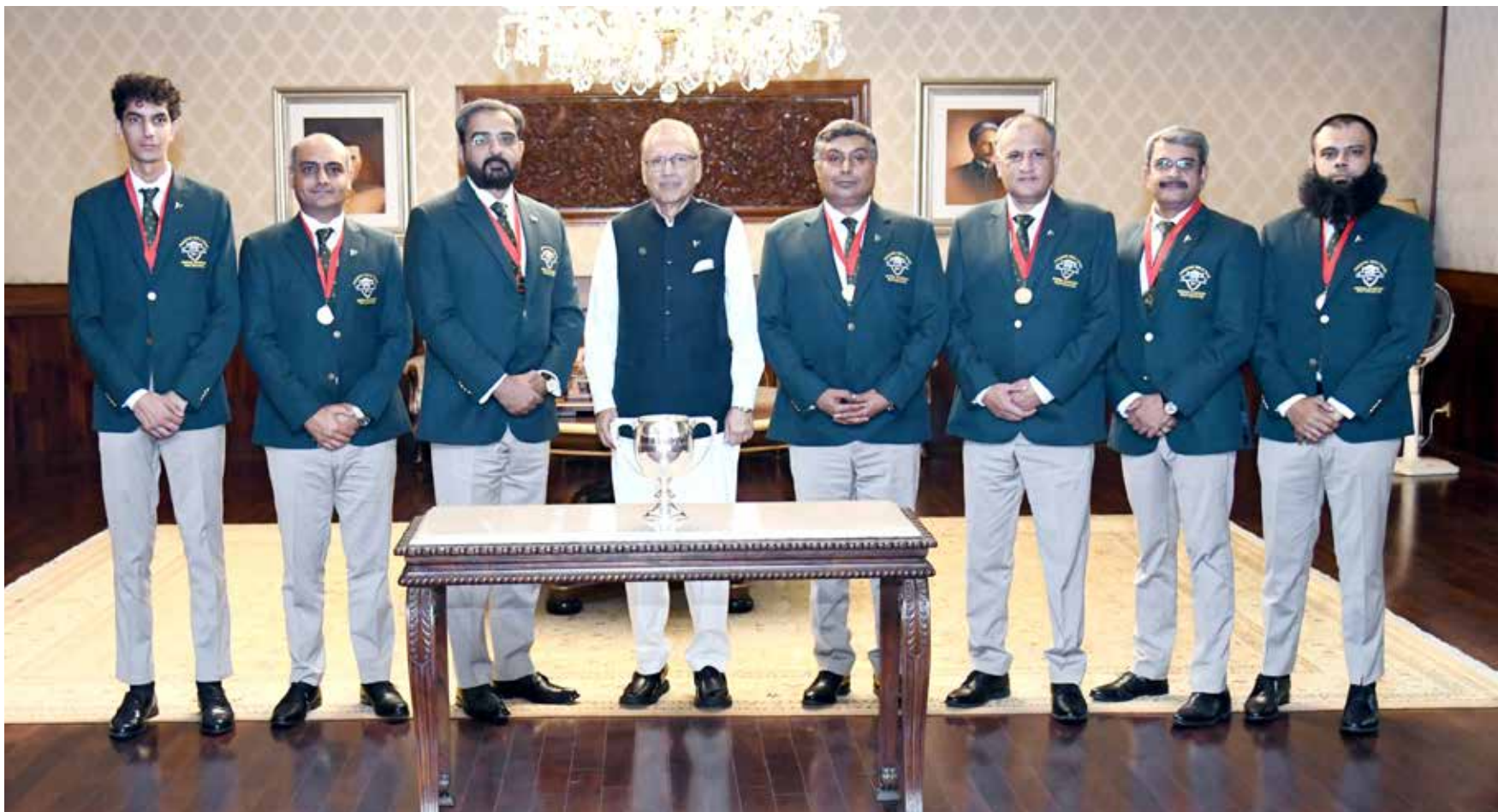
ISLAMABAD: President Dr Arif Alvi in a group photo with the Pakistan Long Range Field Target Rifle Team who won the European Long Range Rifle Championship 2023 held in Britain, at Aiwan-e-Sadr.