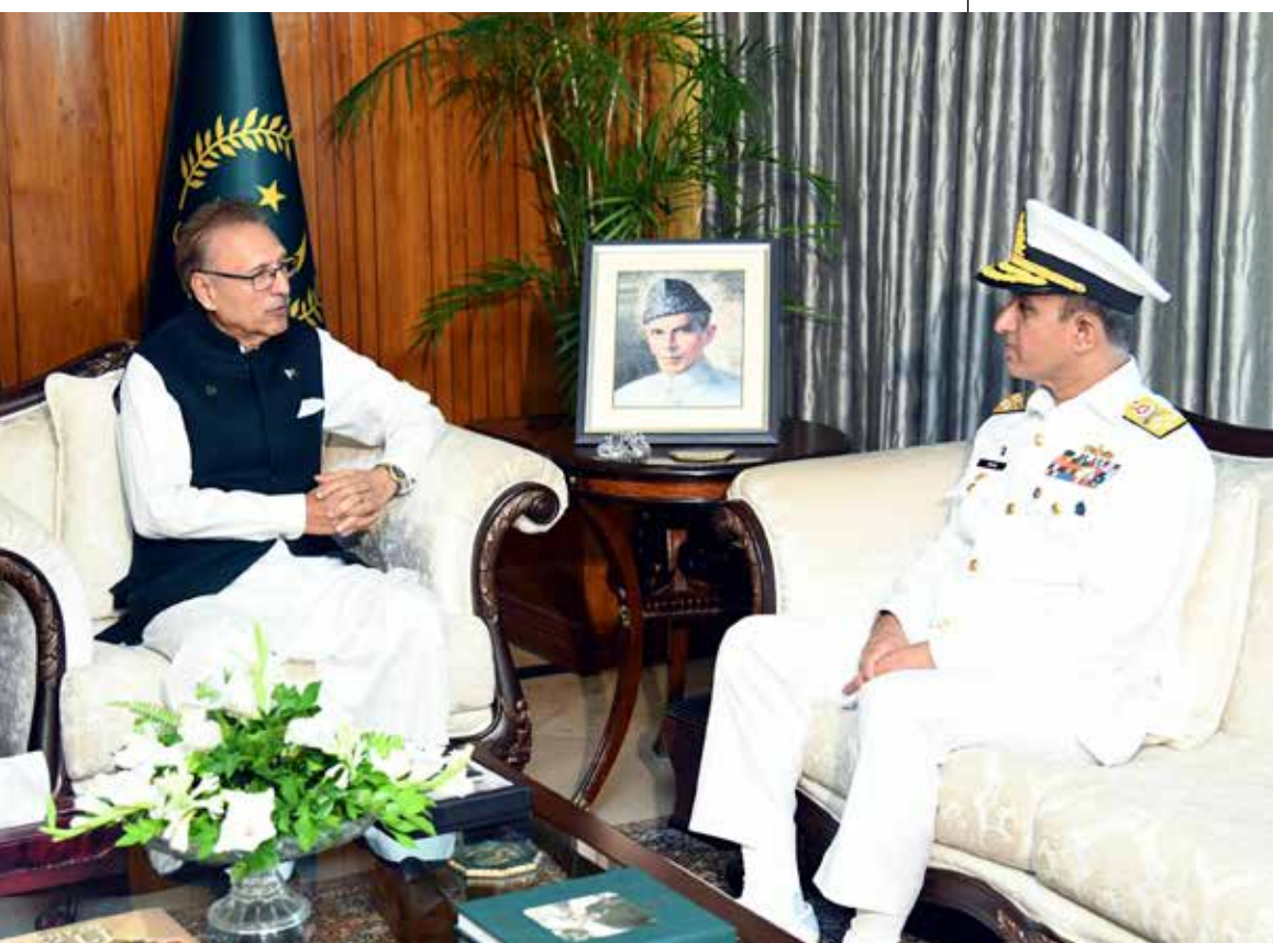
ISLAMABAD: Chief of Naval Staff, Admiral Muhammad Amjad Khan Niazi, paid a farewell call on President Dr Arif Alvi, at Aiwan-e-Sadr, Islamabad.

ISLAMABAD: Islamabad Capital Police organized specialized anti-riot training exercises to enhance their readiness for any peace and security-related situations. During these training sessions, police personnel showcased their proficiency in maintaining peace, protecting both public and private properties, confronting criminal elements, and conducting arrests. The exercises also featured demonstrations of advanced techniques, including the use of water cannons, A police spokesman said. The police officials effectively displayed their ability to disperse unlawful protests using six distinct formations, each encompassing various tactics and techniques for managing and controlling such situations. These formations were strategically designed to equip the police force with the capability to handle unlawful protests through a variety of tactics.—APP