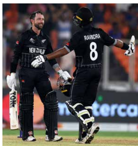
AHMEDABAD: New Zealand thrashed England by nine wickets in the opening match of ICC Men's ODI World Cup 2023 in Ahmedabad on Thursday. The centuries from

Devon Conway and Rachin Ravindra put the defending champions on the backfoot completely in chase of 283. Conway and Ravindra added 273 unbeaten runs in 211 balls for the second wicket partnership to power their side to a comprehensive victory. Conway smashed 152 runs in 121 balls, meanwhile Ravindra scored 123 in 96. Earlier, England's Joe Root made 77 in an otherwise inconsistent batting display by holders England, who posted 282-9 against New Zealand in the first match of the 50-over World Cup on Thursday. Put in to bat in a rematch of the 2019 final, England's otherwise formidable lineup did not really fire but Root, Jos Buttler (43) and Jonny Bairstow (33) ensured their side at least have a competitive total to defend. Root reverse-scooped Trent Boult for a six but eventually lost his stumps to Glenn Phillips attempting another reverse shot, which effectively snuffed out England's hopes of a 300-plus total. Matt Henry claimed 3-48 for New Zealand, while their three spinners shared five wickets on a hot afternoon at the Narendra Modi Stadium. New Zealand rested regular captain Kane Williamson (knee injury) and fast bowler Tim Southee (thumb injury) to give them more time to recover from surgery. Lockie Ferguson also missed out with a minor injury. England left out Ben Stokes, who is nursing a minor hip injury. His replacement Harry Brook (25) hit Rachin Ravindra for two fours and a six before throwing away his wicket in the spinner's eventful first over. - Agencies