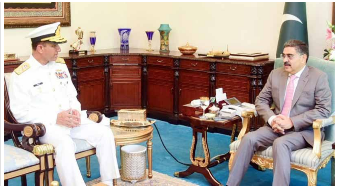
ISLAMABAD: Caretaker PM Anwaar-ul-Haq Kakar in a group photo with NDMA's team after the inauguration of National Emergencies Operation Center in Islamabad.