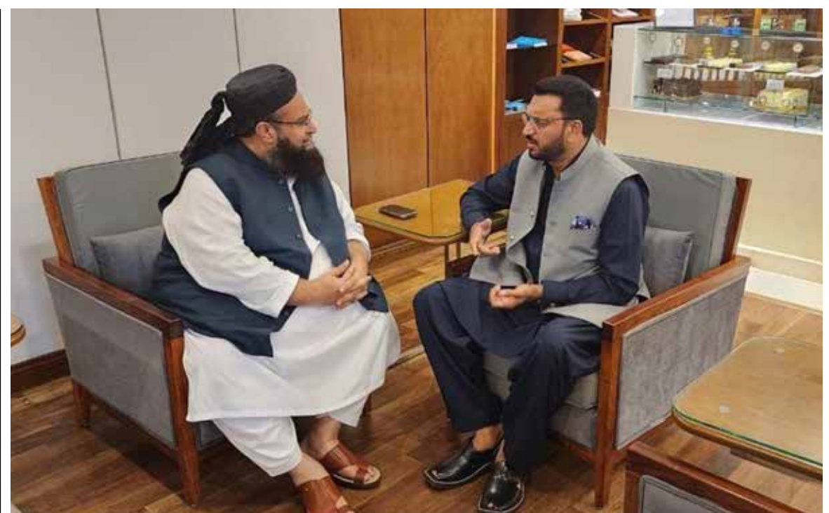
ISLAMABAD: Caretaker Federal Minister for Human Rights Khalil George held a meeting with Chairman Pakistan Ulema Council Maulana Tahir Ashrafi.

platform that connects gifters from all over the world with deserving people with disabilities in Pakistan. Gifters can choose to give a customised wheelchair to a particular person from the list of beneficiaries on their website, www.niazsupport.org. Niaz Support then