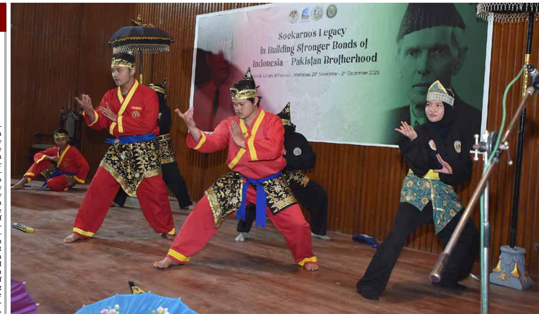
ISLAMABAD: Indonesian artists presenting a traditional Indonesia martial arts performance at the National Library of Pakistan.

ISLAMABAD: The Pakistan Tourism Development Corporation (PTDC) will organise Salam Pakistan photography and short tourism documentary film competitions on Decem-