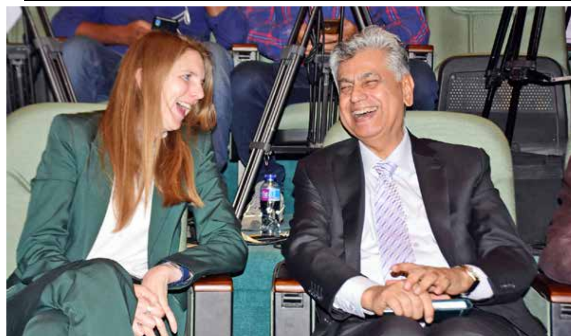
ISLAMABAD: British High Commissioner to Pakistan Jane Marriott gossips in happy mood with Caretaker Information Minister Murtaza Solangi during 9th Islamabad Literature Festival at Fatima Jinnah (F-9) Park in Federal Capital.

FROM PAGE 01 asking, "Why should we expect a level playing field? Name one election in which PPP got a level playing field." The former foreign minister emphasized that despite facing obstacles, the PPP had consistently formed the government without the benefit of a level playing field. Bilawal advocated for fairness, stating that all political parties should ideally have a level playing field. He underscored the principle of equal opportunity for all contenders in the electoral arena. To a question, Chairman PPP clarified that he had not yet decided regarding an electoral alliance with PTI. Bilawal Bhutto Zardari shared his concerns about the ongoing oppression in Palestine and expressed his sadness over the harrowing images of Palestinian children circulating on social media.