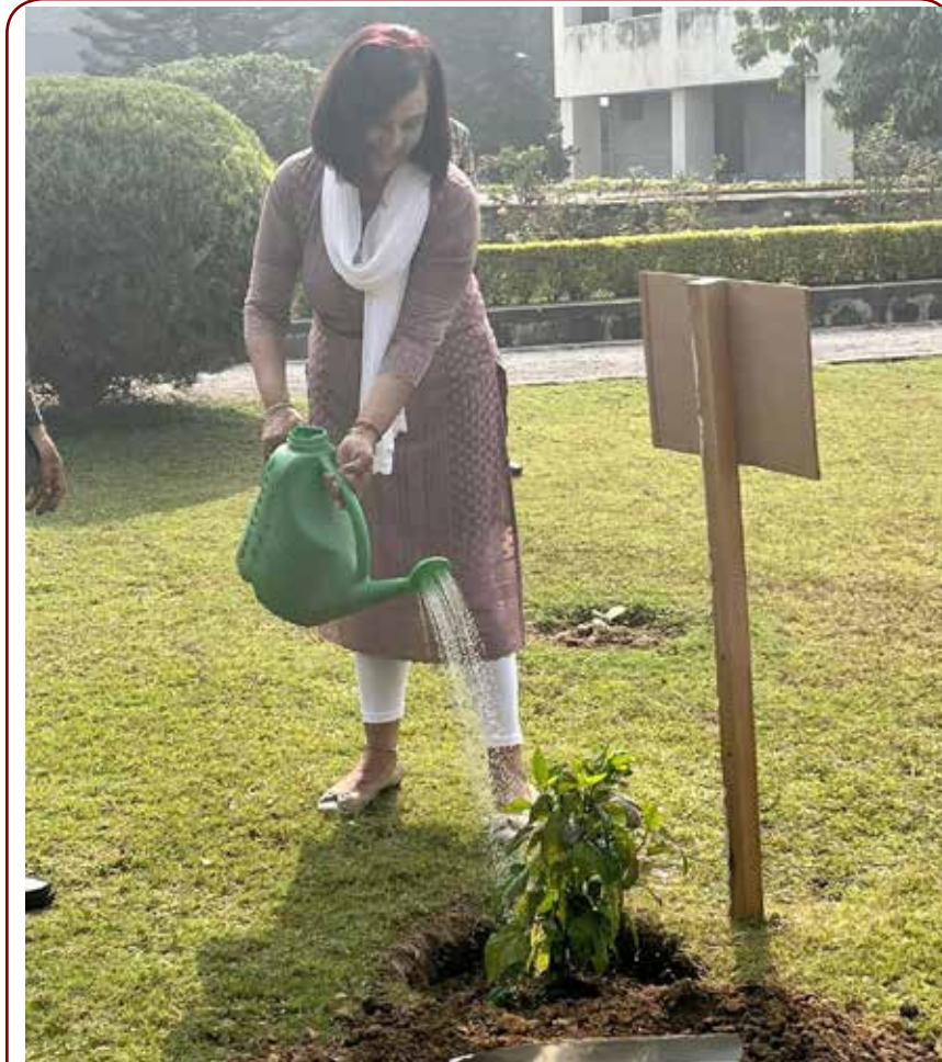
ISLAMABAD: To mark the conclusion of special campaign of Swachhata Abhiyan the Indian High Commission undertook tree plantation in the Embassy premises as part of its commitment to make work place cleaner.