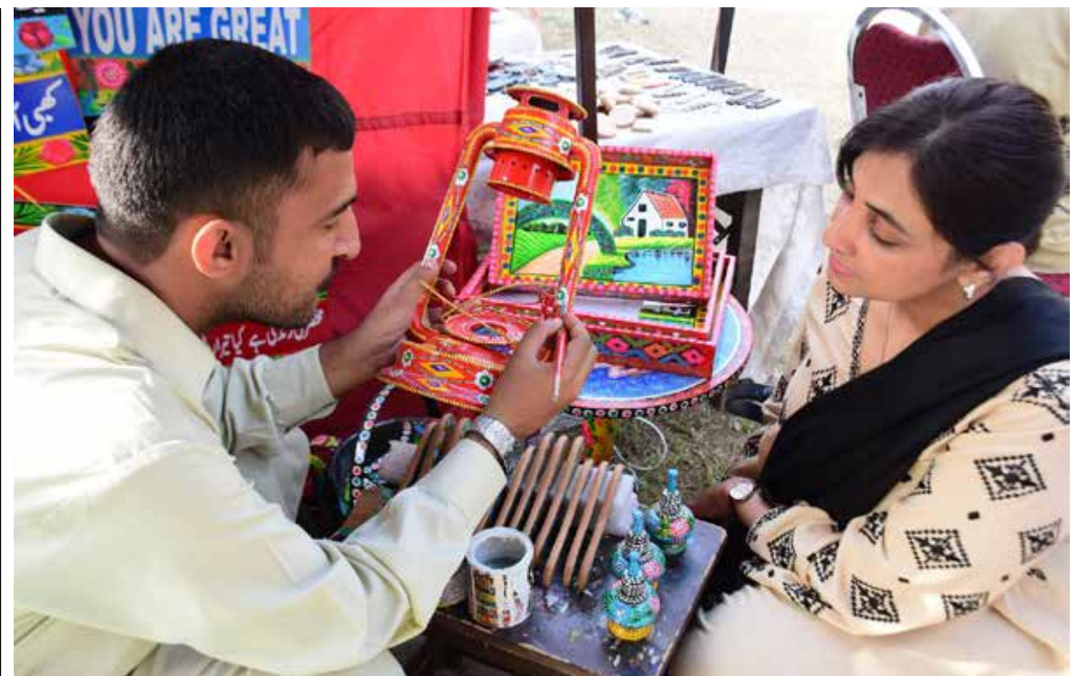
ISLAMABAD: A girl is taking interest in the making of the traditional Truck Art at different decoration pieces during Lok Mela at Lok Versa in Federal Capital.