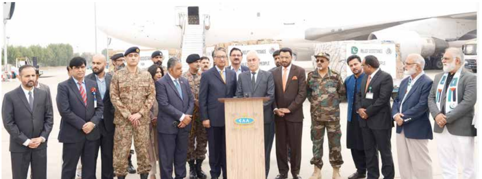
ISLAMABAD: NDMA dispatched humanitarian relief assistance to war ravaged Gaza, Palestine. Caretaker Federal Minister for Foreign Affairs Jilani Abbas Jilani and Caretaker Federal Minister for Human Rights Khalil George sent off second tranche to Gaza via Egypt from Islamabad International Airport. — DNA