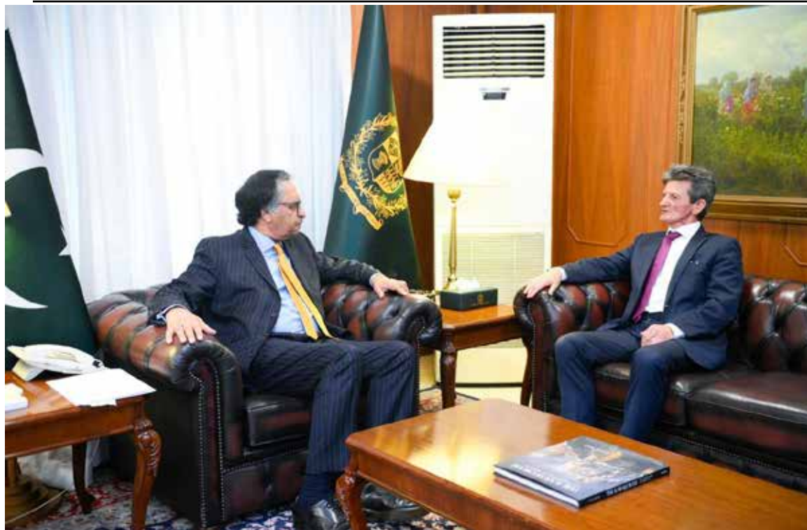
HUNGARY : Ambassador Bela Fazekas called on FM Jalil Abbas Jilani. They Expressed satisfaction at the positive trajectory in bilateral relations. FM also thanked Hungary for doubling the number of scholarships for Pakistani student. --DNA

LONDON - FTSE 100: UP 0.1 percent at 7,423.72 points Frankfurt - DAX: DOWN 0.2 percent at 15,103.59 Paris - CAC 40: DOWN 0.4 percent at 6,983.48 EURO STOXX 50: DOWN 0.3 percent at 4,146.76 Tokyo - Nikkei 225: DOWN 1.3 percent at 32,271.82 (close) Hong Kong - Hang Seng Index: DOWN 1.7 percent at 17,670.16 (close) Shanghai - Composite: FLAT at 3,057.27 (close) New York - Dow: UP 0.1 percent at 34,095.86 (close) Euro/dollar: DOWN at $1.0682 from $1.0723 on Monday Pound/dollar: DOWN at $1.2295 from $1.2342 Dollar/yen: UP at 150.31 yen from 150.00 yen Euro/pound: UP at 86.87 pence from 86.85 pence Brent North Sea crude: DOWN 1.9 percent at $83.58 per barrel West Texas Intermediate: DOWN 1.8 percent at $79.38 per barrel 201. -- APP