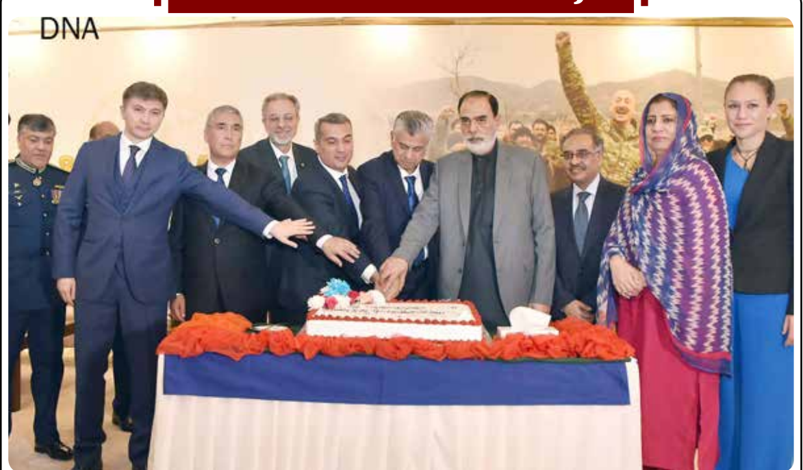
ISLAMABAD: Federal Minister for Information Broadcasting and Parliamentary Affairs Murtaza Solangi, Ambassador of Azerbaijan Khazar Farhadov and others cutting cake to celebrate the Victory Day of Republic of Azerbaijan.

ECO Summit PM to leave for Tashkent today