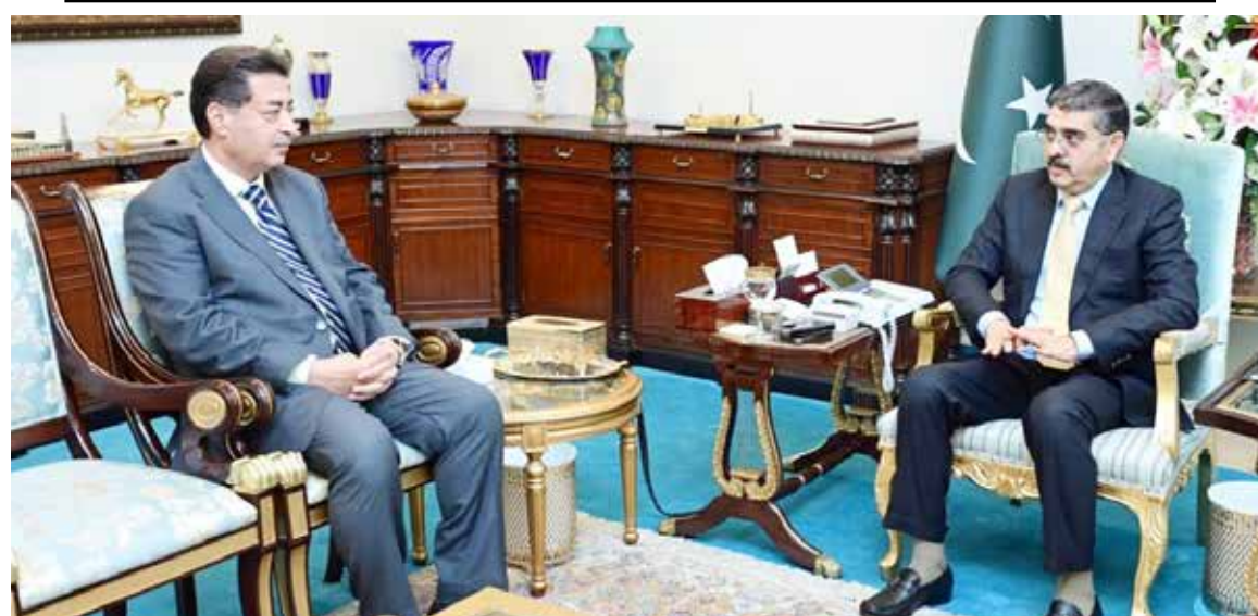
ISLAMABAD: Chief Election Commissioner Sikander Sultan Raja calls on Caretaker Prime Minister Anwaar-ul-Haq Kakar in Islamabad on 7th of November, 2023.

In February 2022, Moscow attacked Ukraine, sending hundreds of thousands of Russian troops into the neighbouring country, which also shares a border with NATO members Poland, Slovakia, Romania and Hungary. Russia's Foreign Ministry said the process of the formal withdrawal from the treaty has been completed, without elaborating what that entailed. It blamed the US and its allies for the withdrawal and the West's allegedly "destructive position" on the treaty. "We left the door open for a dialogue on ways to restore the viability of conventional arms control in Europe," it said. "However, our opponents did not take advantage of this opportunity." The statement further said that "even the formal preservation" of the treaty has become "unacceptable from the point of view of Russia's fundamental security interests," citing developments in Ukraine and NATO's recent expansion. In Brussels, NATO said that its allies who had signed on "intend to suspend the operation of the CFE Treaty for as long as necessary, in accordance with their rights under international law." The alliance underlined that its members remain committed "to reduce military risk, and prevent misperceptions and conflicts." NATO said that its members will continue to "consult on and assess the implications of the current security environment and its impact on the security" of the alliance.