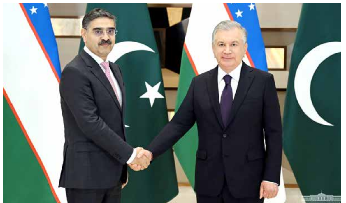
TASHKENT: Caretaker Prime Minister Anwaar-ul-Haq Kakar meets President of Uzbekistan Shavkat Mirziyoyev, on the sidelines of the 16th Summit of the Economic Cooperation Organization (ECO).