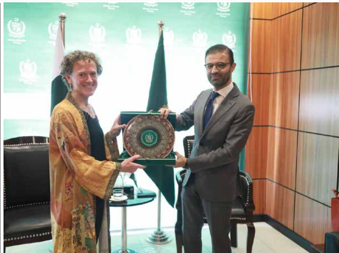
ISLAMABAD: H.E Leslie Scanlon met with Ahmad Irfan Aslam, Caretaker Minister of Climate Change and Water Resources to exchange views on critical minerals mining, legal protections for minorities and Afghan refugees, and how to advance addressing the climate crisis. —DNA