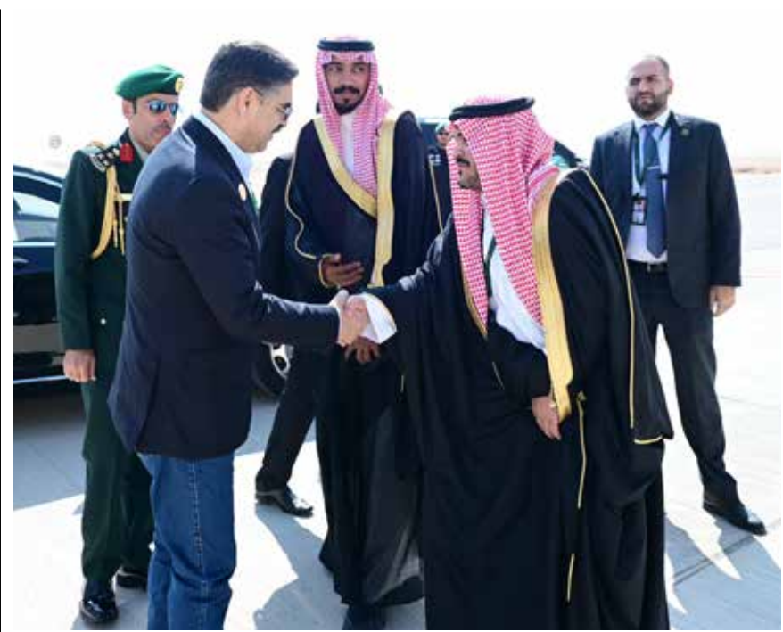
RIYADH: Caretaker Prime Minister, Anwar-ul-Haq departing for Pakistan after completing his three day official visit of Saudi Arabia.