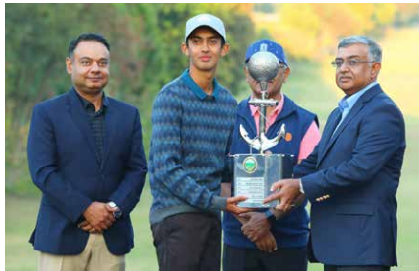
the untiring efforts of MGGC staff and organizers for seamless conduct of the championship. He also appreciated the consistent and generous support from sponsors, management of MGGC Islamabad and media fraternity, without which the event would not

While addressing the ceremony, Chief of the Naval Staff Admiral Naveed Ashraf congratulated the winners for their remarkable success and appreciated their skills. Naval Chief lauded the high standards of the game that provided exciting and quality entertainment to the participants. Naval Chief commended