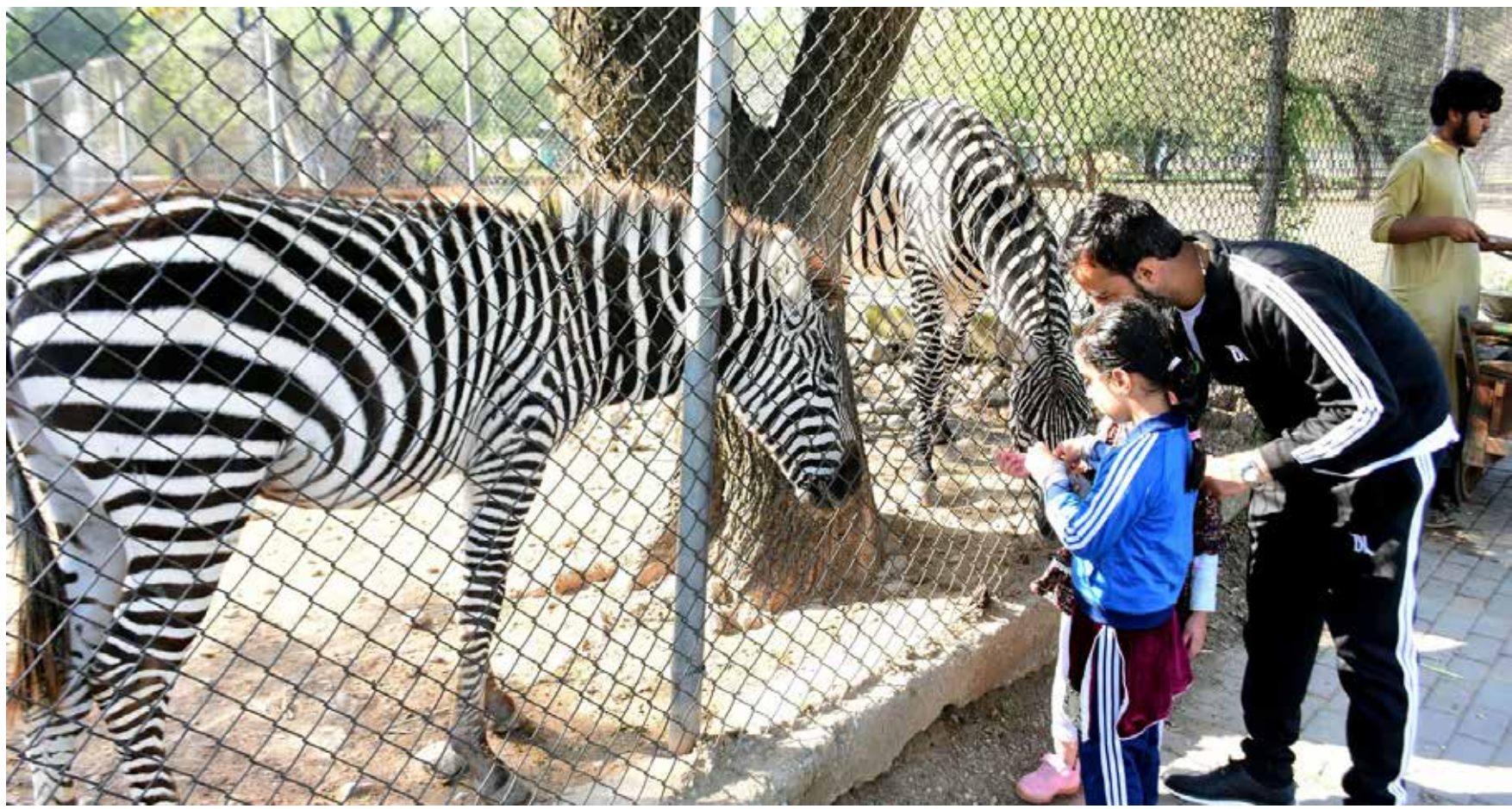
ISLAMABAD:—A family enjoy with Zebra during Sunday Holiday alongside Faisal Avenue in Federal Capital.