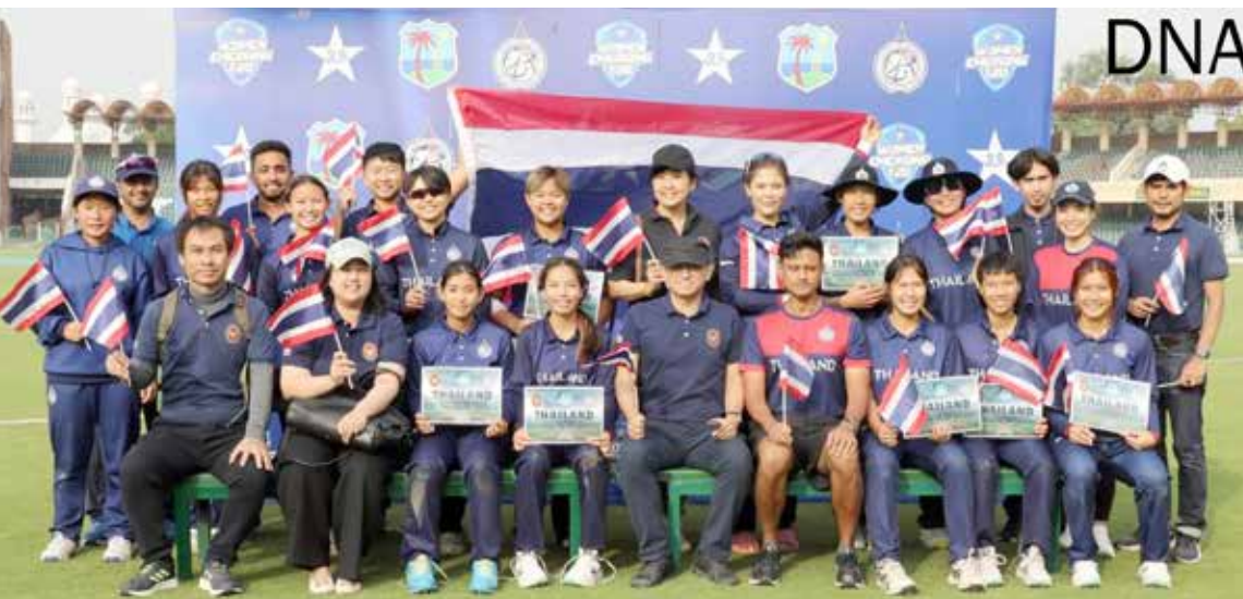
LAHORE: The women cricket team of Thailand posing for a picture with Ambassador of Thailand to Pakistan. This is for the first time that the Thai women cricket team visited Pakistan.