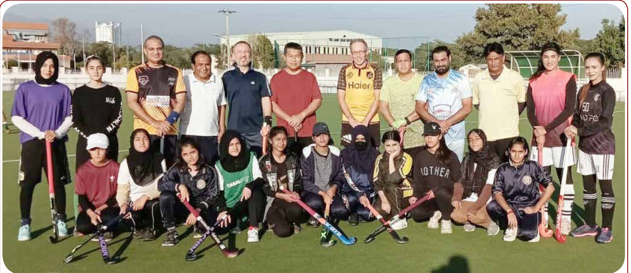
ISLAMABAD: Players of Rising Stars Girls Hockey Academy posing for a picture with the Ambassadors / High Commissioners of Australia, Brunei and Romania during the practice session. The diplomats encouraged the girls players and exhorted them to continue exhibiting their hockey skills to be able to represent their country at the higher level.