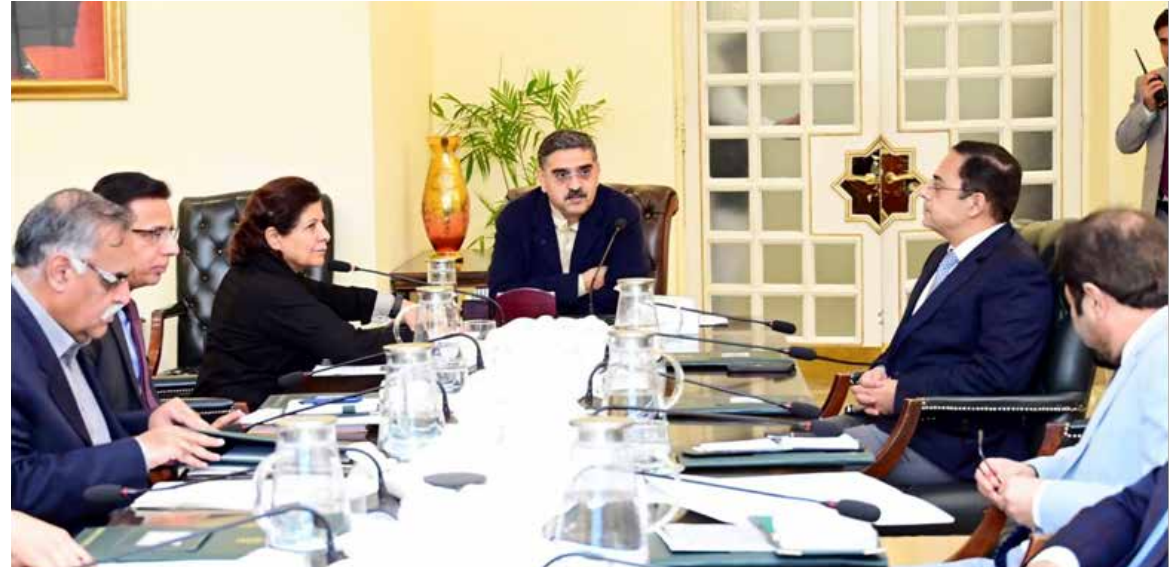
ISLAMABAD: The Caretaker Prime Minister Anwaar-ul-Haq Kakar chairs a meeting on the matters related to the Federal Board of Revenue.