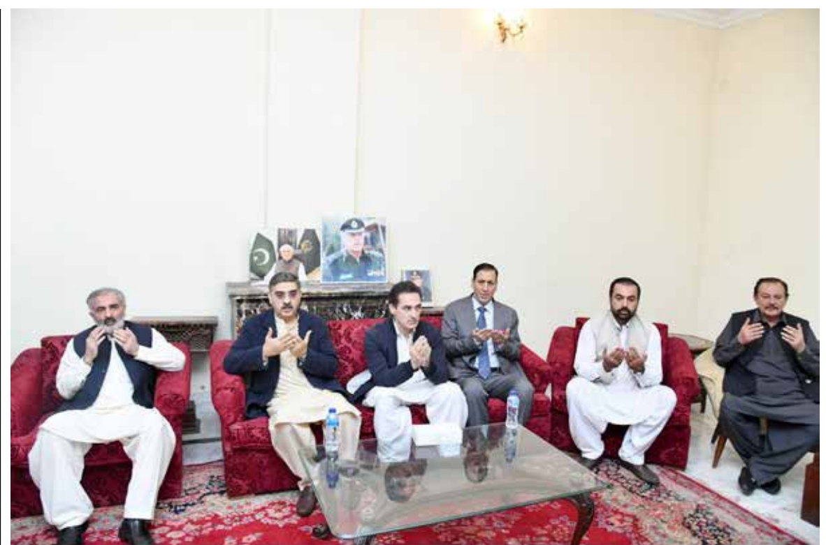
Islamabad : Caretaker Prime Minister Anwaar-ul-Haq Kakar offering Fatiha at the residence of late caretaker Chief Minister KP Azam Khan in Charsadda.