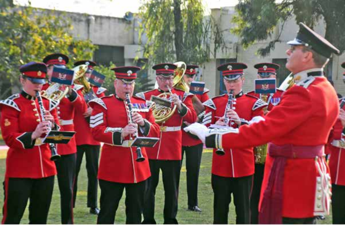
ISLAMABAD: A group of the British Band are performing in Islamabad college for girls (ICG) F-6/2 in connection with King Charles birthday.