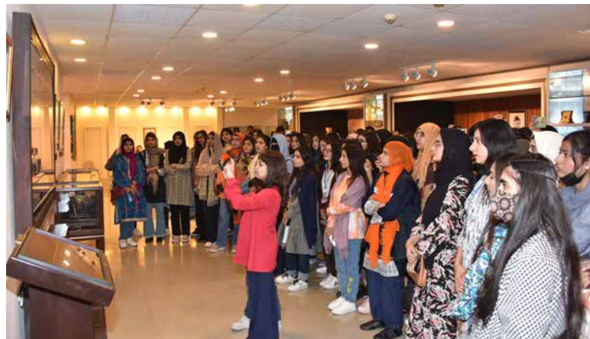
ISLAMABAD : A group of students from government college women university Faisalabad (GCWUF) visiting Senate Museum at Parliament house.