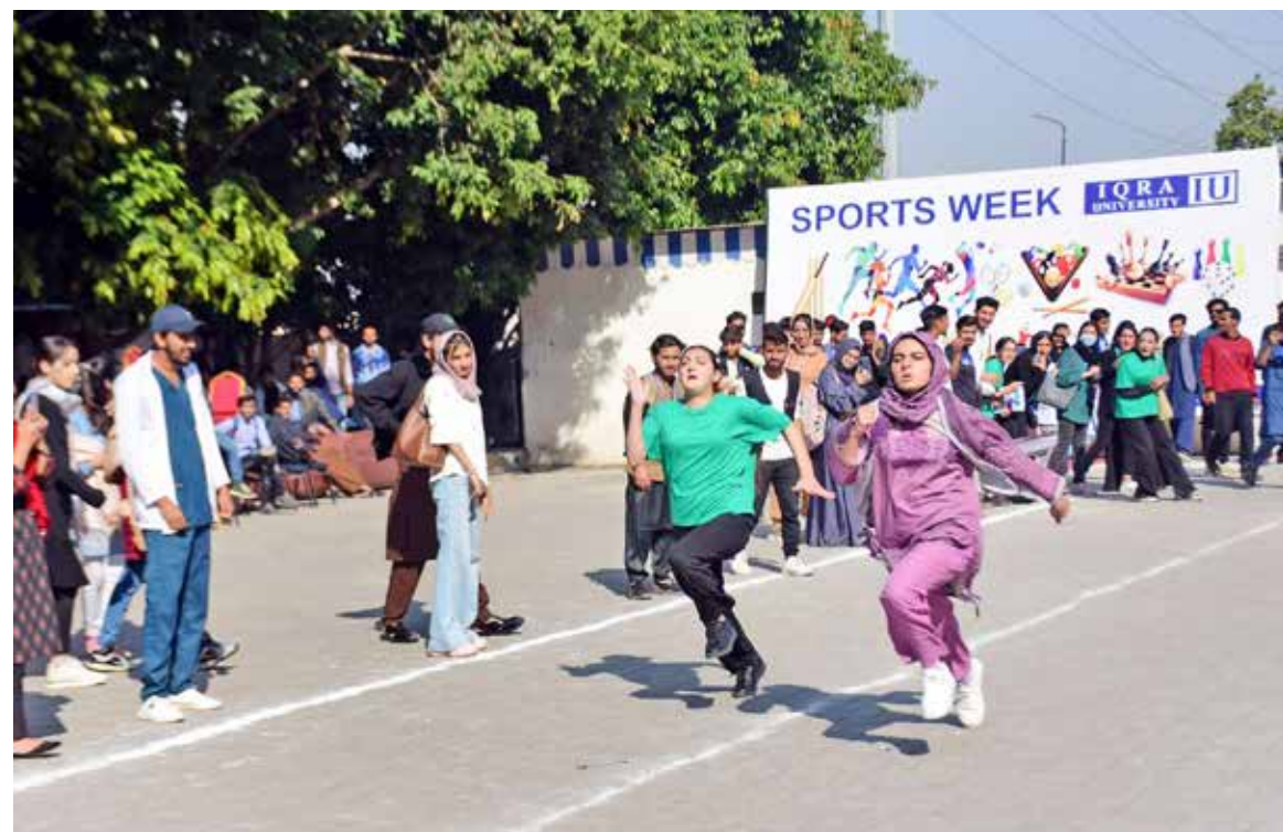
ISLAMABAD: Girls Students are participating in the "Running Competition" during the final day of the Mega Sports Event at Iqra University (Chak Shahzad) Campus in Federal Capital.

AL AHSA: Pakistan football team's head coach Stephen Constantine said that his team conceded goals at the wrong times, leading to them losing with a big margin of 4-0 against a dominant Saudi Arabia in the FIFA World Cup 2026 Qualifiers. Pakistan football team were thrashed by Saudi Arabia 4-0 during the first match of the FIFA World Cup 2026 Qualifiers, courtesy of Saleh Al-Shahri's two goals in the early minutes of both halves. "It was always going to be a difficult game for us. Considering where we were two months ago, we didn't deserve to lose 4-0. We conceded at the start of both halves, which is probably the worst time to concede goals," Constantine said during the post-match press conference. "If you face a team as good as the Saudi team, you must always be focused. We have players whose primary sport is not football. Some of them do not remember the last time they played this game. "Saudi Arabia is one of the best teams in Asia, so I asked the players to play without fear. Our chances are not easy, especially as we face strong teams, and we must prepare well for the Tajikistan match." This was the first time Pakistan played in the second round of FIFA World Cup qualifiers, after defeating Cambodia in the first round. Pakistan last played against Saudi Arabia in 1978 at the latter's home and suffered a 6-0 thrashing. - Agencies