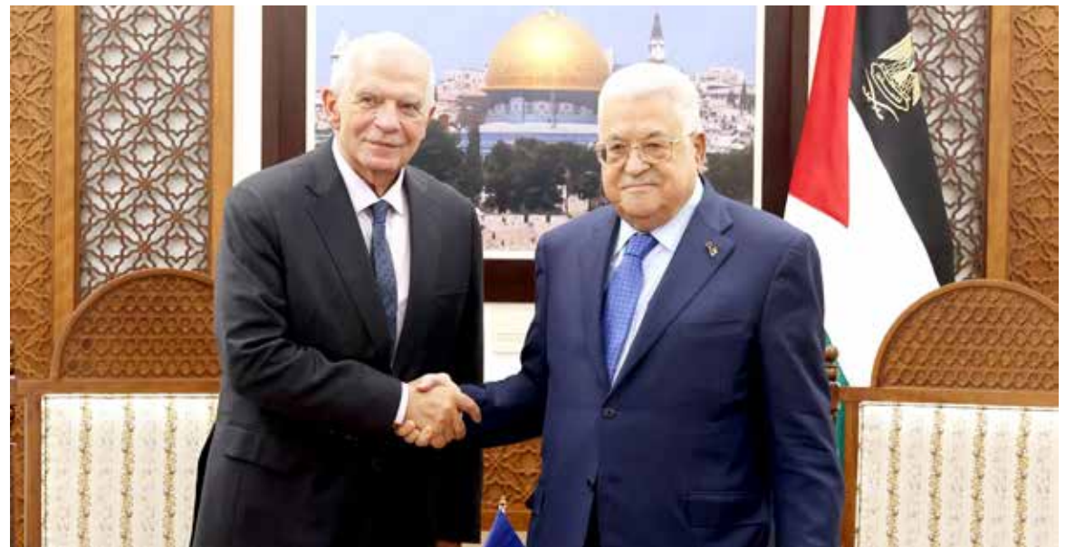
RAMALLAH: President Mahmoud Abbas welcomed meets High Representative of the European Union for Foreign Affairs and Security Policy.