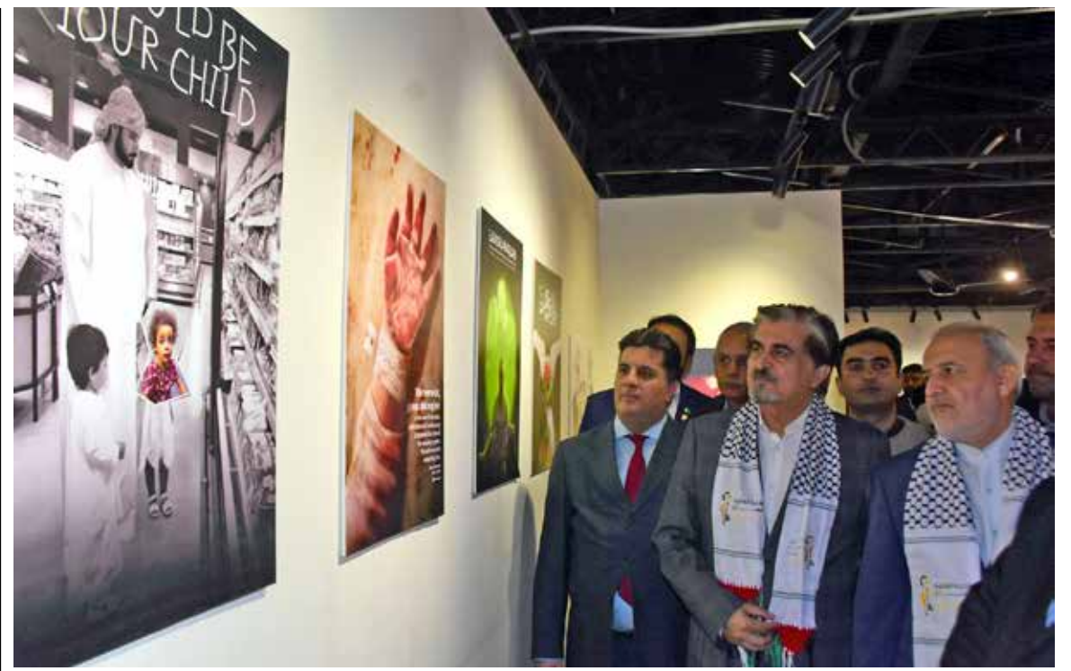
ISLAMABAD: care-taker Federal Minister of National Heritage and Culture Division Jamal Shah along with the Ambassador of Iran to Pakistan Dr Reza Amiri Moghadam taking interest in posters during "Poster Exhibition" to highlight the cruelty on the oppressed innocent Muslims of Palestine, As Organized by Cultural Consulate of the Islamic Republic of Iran at Lok Versa in Federal Capital.