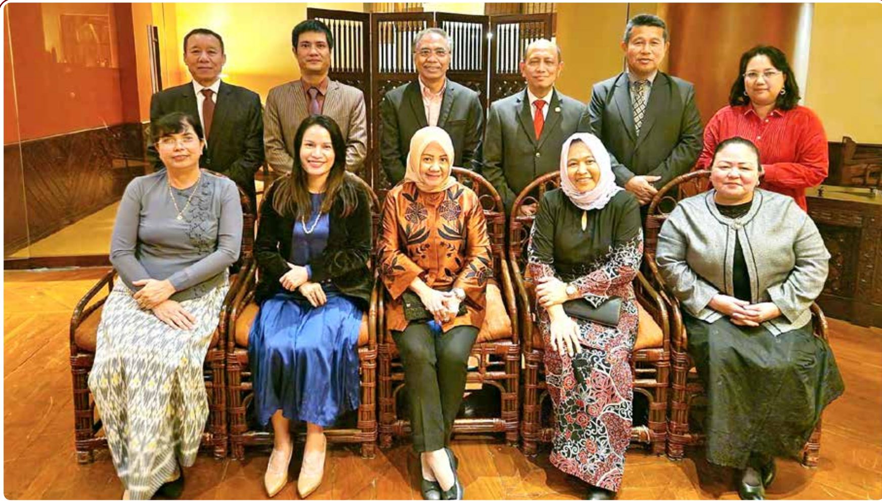
ISLAMABAD: Malaysian High Commissioner/Chair ASEAN Committee in Islamabad (ACI) hosted a farewell dinner for Indonesian Ambassador and welcome dinner for Bruneian High Commissioner on 15 November 2023 at Serena Hotel. Present were ASEAN Islamabad-based Heads of Mission together with their respective spouses.