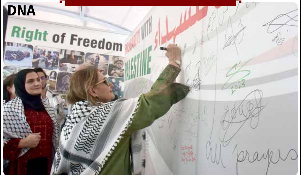
ISLAMABAD: First Lady Begum Samina Alvi signing the Palestine Solidarity Wall on the occasion of the annual Foreign Office Women Association Bazaar, on Sunday. More pictures on Page 03. - DNA