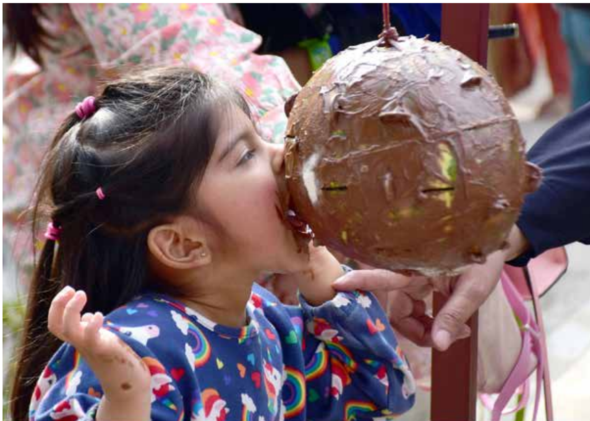
ISLAMABAD: Nov 18-Youngsters are participating in the different games during the "Family Gala" at Indonesian Embassy in Federal Capital.