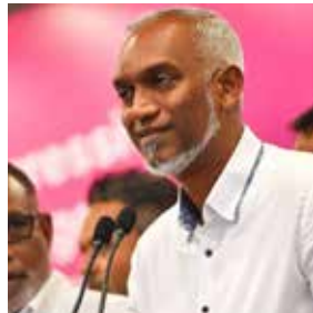
a runoff after promising to remove a small Indian

MALE : Maldives new President Mohamed Muizzu, who campaigned on altering the tiny Indian Ocean archipelago's "India first" policy, has requested India withdraw its military from the country. Muizzu won the presidential election in September, ousting Ibrahim Solih in