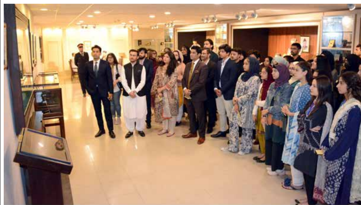
ISLAMABAD: A group of students and faculty members of Air University, Islamabad visiting Senate Museum at Parliament House.