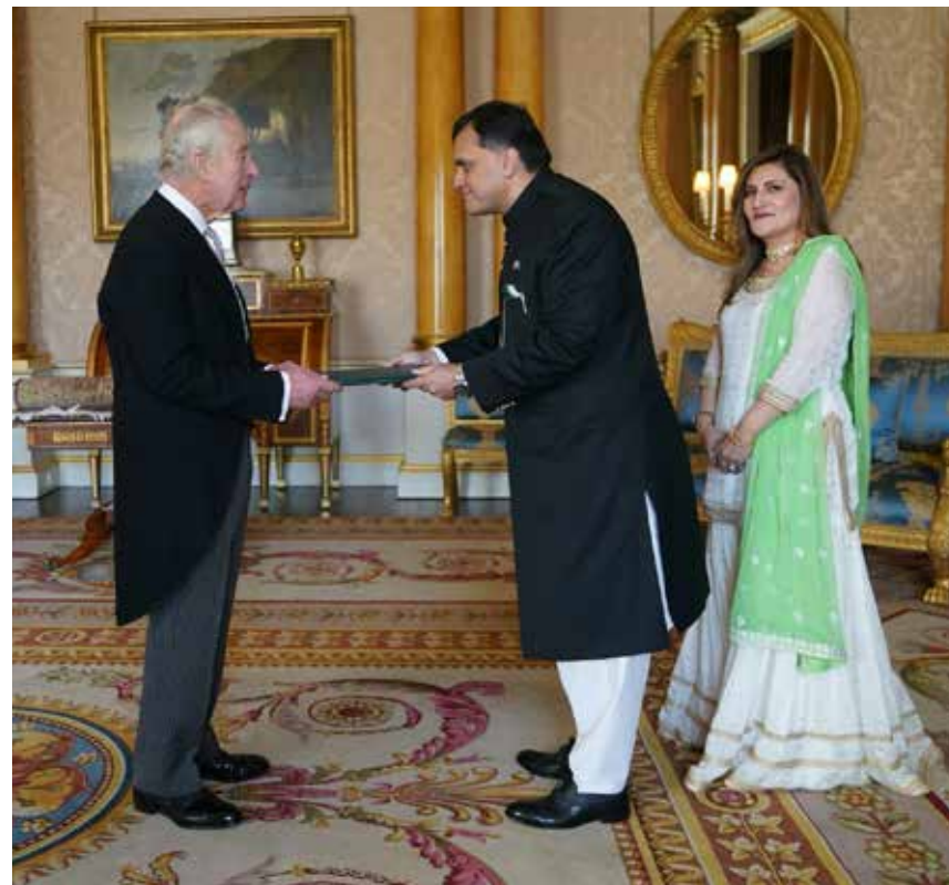
for further strengthening the relations between the two countries. His Majes-