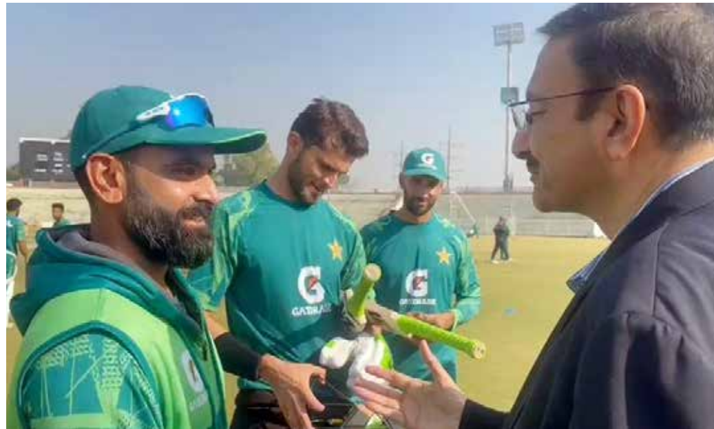
the contribution of players such as Babar Azam and Shaheen in bringing pride to the nation." Babar Azam is making the country proud as the number one player," said Zaka Ashraf. "What Shaheen has done for the country can never be forgotten," he added. "We are proud of

LAHORE: The Chairman of the Pakistan Cricket Board (PCB) Management Committee, Zaka Ashraf, has paid a visit to the training camp in Pindi where the national team is practicing for the upcoming three-match Test series against Australia. Upon his arrival, Ashraf wasted no time and engaged with the team players, holding crucial talks with prominent players and also including Test captain Shan Masood, T20I captain Shaheen Shah Afridi, Team director and head coach Mohammad Hafeez, and Chief Selector Wahab Riaz. Expressing his unwavering confidence in the team's new management, the PCB chief played a pivotal role in boosting the morale of the players, setting an optimistic tone for the challenges that lie ahead. He also underscored