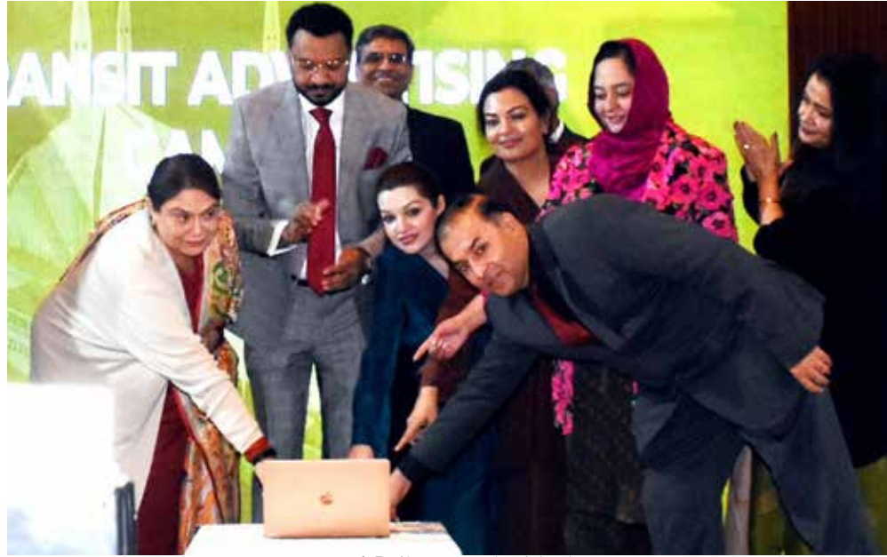
The advertising campaign will kick start by November 25 in collaboration with the Ministry of Human Rights.

She was addressing the launch of 16-day Awareness Campaign "Activism Against Gender-Based Violence" including a Transit Advertising Campaign, organized by the Ministry of Human Rights.