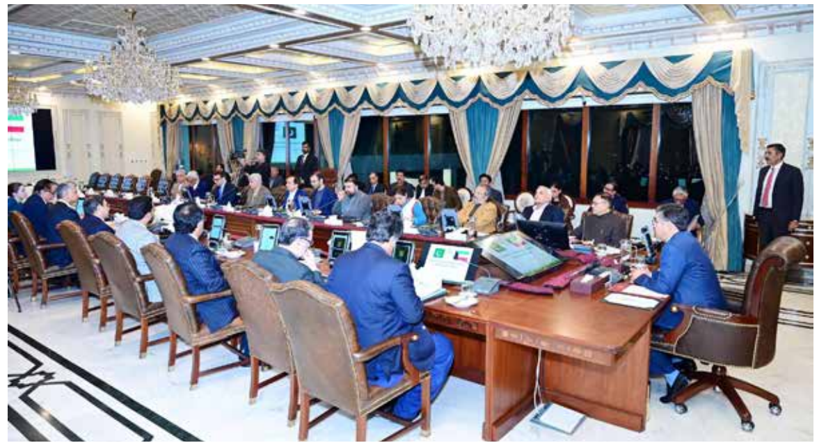
ISLAMABAD: Caretaker Prime Minister Anwaar-ul-Haq Kakar chairs meeting of the Cabinet.