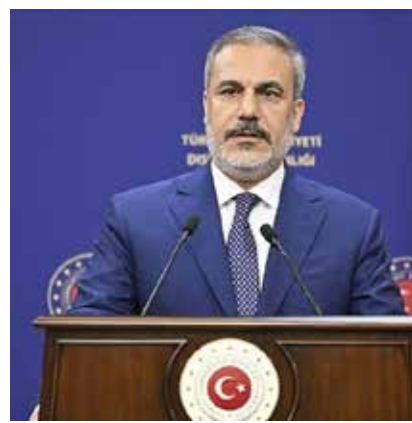
imize "Israel's merciless killing of people

tional cooperation, and truth, the Turkish foreign minister stressed. Disinformation about Gaza Fidan said disinformation that had paved the way for interventions in Afghanistan and Iraq, and plunged the region into chaos is now surfacing in Gaza. He said there are two types of disinformation regarding "war crimes committed by Israel in Gaza and the West Bank" after the Oct. 7 Hamas attack on Israel. "The first is the biased attitude of many Western media outlets that ignore the human tragedy suffered by the Palestinians. The other is the institutionalized disinformation, which is not limited to the Oct. 7 events, that Israel is trying to convince the whole world by hiding the facts." Fidan further said that no one should legit-