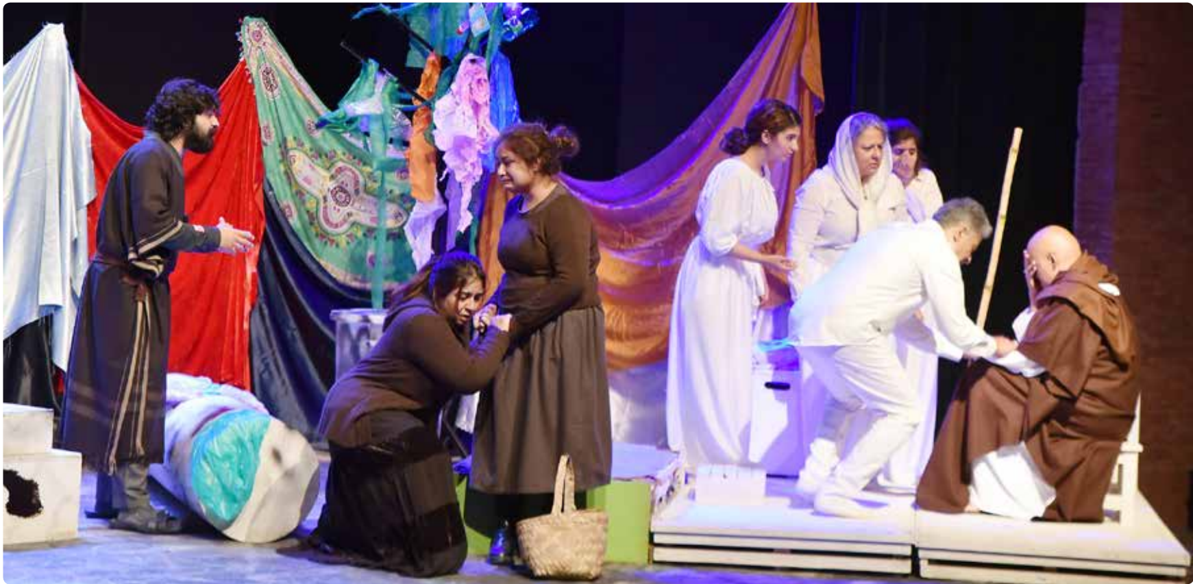
ISLAMABAD: Artists taking part in a drama written by famous Belgian playwright. The embassy of Belgium organized drama at the PNCA as part of the Belgian Cultural Week.