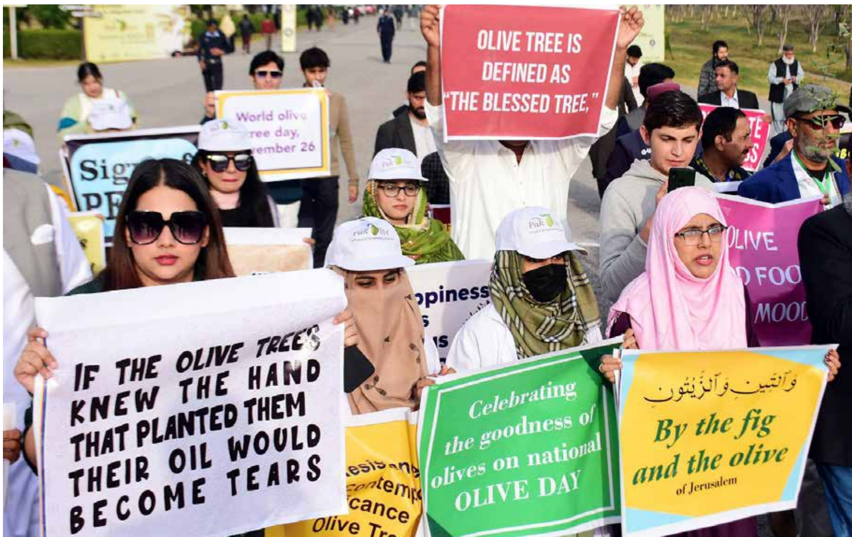
ISLAMABAD: Participants hold placards during a walk on the eve of World Olive Tree Day at F-9 park in Federal Capital.