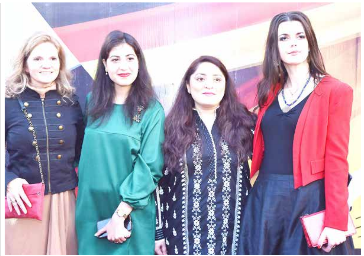
ISLAMABAD: Ladies posing for a picture on the occasion of the Germany Unity Day.

for ceasefire in Gaza to start rescue operations. United Nations have also stated that more than 300,000 people in Gaza have no access to food, water and medicines and in this entire scenario, the world leadership have to build pressure at Israel for ceasefire in Gaza, said Hafiz Muhammad Tahir Mahmood Ashrafi. He said that until and unless, Israel does not adopt peace process, we will keep raising voice. He said that innocent children, women, mosques and Hospitals are being targeted in Gaza. The religious leaders also appealed to Muslim countries to play their fully role to build pressure on Israel to make ceasefire. The religious leadership also stated that interfaith dialogue endeavours in Pakistan have intensified and also lauded the role of Chief of the Army Staff General Hafiz Asim Munir and Prime Minister Anwarul Haq Kakar for respective instructions on Jaranwala incident as following the visits of Chief Justice of Pakistan and Prime Minister to Jaranwala, people got the hope of justice.