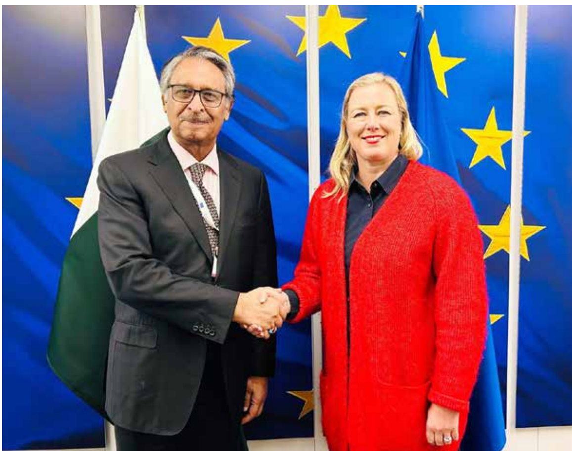
BRUSSELS: Caretaker Foreign Minister, Jalil Abbas Jilani meets with EU Commissioner for international partnership, Jutta Urpilainen. They discussed ongoing development cooperation engagement between Pakistan-EU. - DNA

"We also aimed to be innovative, with some of the project's components featuring renewable technologies, cost-recovery interventions, and behavioral change and communication elements." ADB will also administer a $1 million technical assistance provided by the Republic of Korea e-Asia and Knowledge Partnership Fund, to strengthen the capacity of the Rawalpindi Water and Sanitation Agency to address leakages in the city's water supply network.