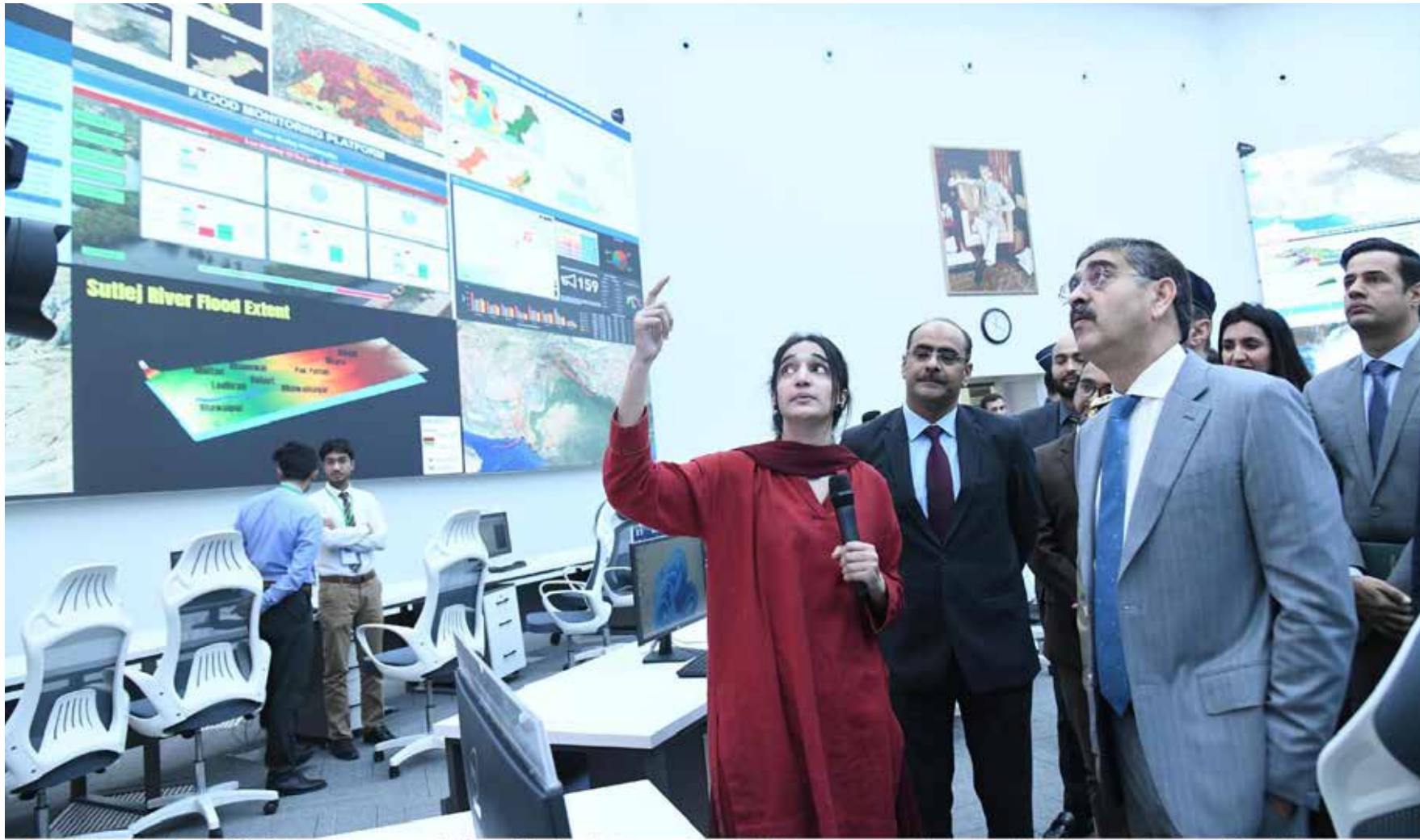
ISLAMABAD : Caretaker Prime Minister Anwaar-ul-Haq Kakar interacting with team members and officers during his visit to National Emergency Operation Centre.

In his first face-to-face meeting with Netanyahu in Tel Aviv since the Israeli-Palestinian conflict escalated, Sanchez urged Israel to distinguish between civilian and military targets. While acknowledging Israel's "frustration and pain" for the "terrible terrorist acts of Hamas," the Spanish premier told Netanyahu that Israel must respect international law and end the "humanitarian catastrophe" in the Gaza Strip. Traveling alongside his Belgian counterpart Alexander De Croo, Sanchez is trying to build momentum for peace talks and an eventual two-state solution. "Today, more than ever, we need to bring back a serious and credible prospect for peace. We are bound to keep running into a never-ending cycle of violence," Sanchez told Netanyahu, according to a video released by the Spanish government.