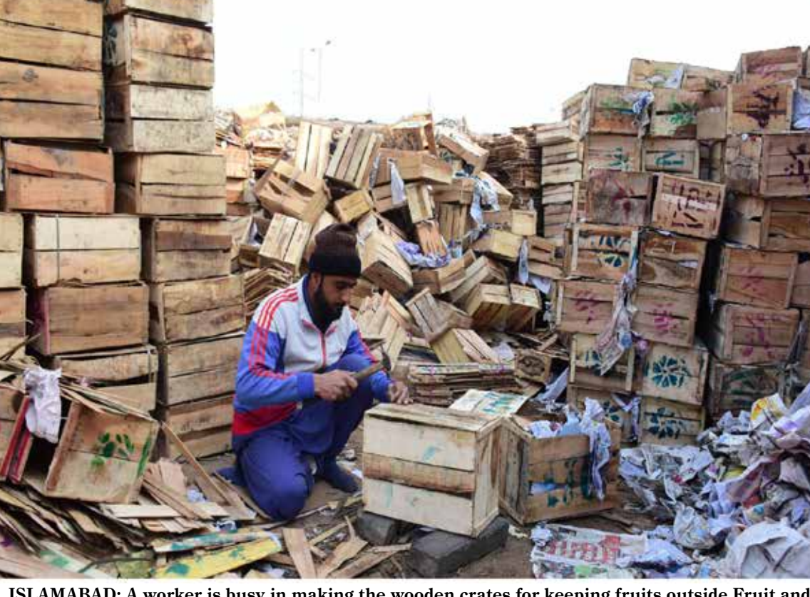
ISLAMABAD: A worker is busy in making the wooden crates for keeping fruits outside Fruit and Vegetables Market in Federal Capital.