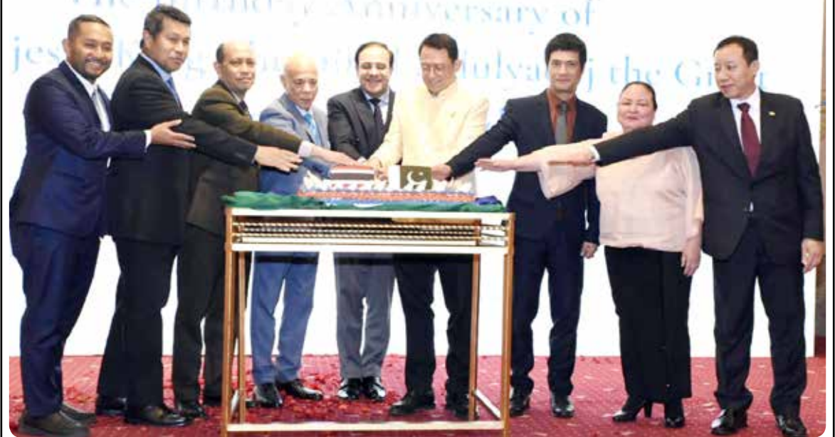
ISLAMABAD: Umar Saif, Federal Minister for Information Technology and Telecommunication, Ambassador of Thailand Chakkrid Krachaiwong, Dean of Diplomatic Corps Mohammad Karmoune, Ambassador of Morocco and others cutting cake to celebrate the National Day of Thailand.