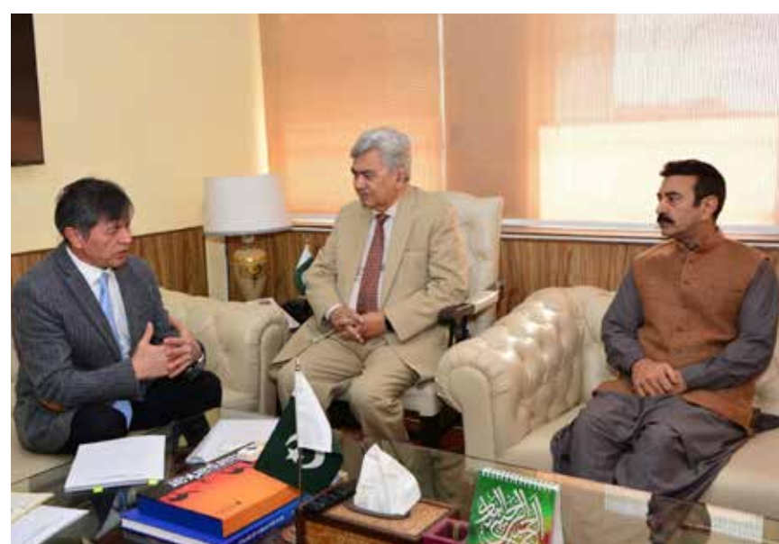
ISLAMABAD : Ambassador of Uzbekistan H.E. Obayek Arif Osmanoov called on the Caretaker Federal Minister for National Food Security and Research Dr. Kausar Abdullah Malik here at Minister office.—DNA

impressive distance of 700 meters. "The technology aims to enhance the safety and efficiency of train operations during adverse weather conditions, particularly in the presence of dense smog and fog." The system, he said the TDAS is set to revolutionize the way trains navigate through foggy landscapes. It promised not only to avert potential accidents but also to facilitate smooth rail travel when visibility is severely compromised. He said the capabilities of this digital system extended beyond improved visibility; it can also identify and monitor vital elements such as signals, level crossings, gates, track obstructions, and other potential hazards within the same 700-meter radius. The official said the system is not only expected to facilitate timely train movements on foggy days but will also be instrumental in averting accidents during severe foggy weather, enhancing the overall safety and efficiency of Pakistan's railway network.