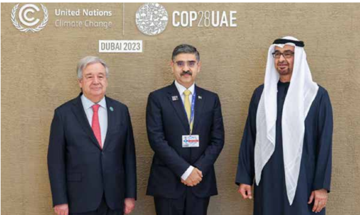
DUBAI: Caretaker PM Anwaar-ul-Haq Kakar is being received by the President of UAE, Sheikh Mohamed bin Zayed Al Nahyan and the Secretary General of UN, Antonio Guterres on his arrival at Dubai Expo City to attend the High Level Segment of United Nations' COP28.

ISLAMABAD: Chief Justice of Pakistan QaziFaez Isa on Friday ordered the auction of two luxury vehicles allocated for his use by the federal and Punjab governments, saying this is an "inappropriate splurge of scarce public resources". In a letter sent by the SC registrar to the federal government cabinet secretary and Punjab chief secretary, the bureaucrats were told that the apex court purchased a new Mercedes Benz, 2996 CC sedan for Rs61 million for the CJP in September 2020. "A brand new bullet-proof Toyota Land Cruiser, Registration No LEG-S00, was also provided by the Government of Punjab for the use of the chief justice of Pakistan, which is parked in the Supreme Court Rest House in GOR, Lahore," said the letter. The letter stated that every judge of the apex court has been provided two vehicles as per rules. "Justice Isa has not used the said Mercedes sedan nor the Toyota Land Cruiser," said the letter. It further stated that it is an "inappropriate splurge of scarce public resources to buy imported luxury vehicles for the use of constitutional and public office holders." "Therefore, these vehicles may be collected and auctioned and the money realised from the sale be spent on much needed public transport," said the letter.