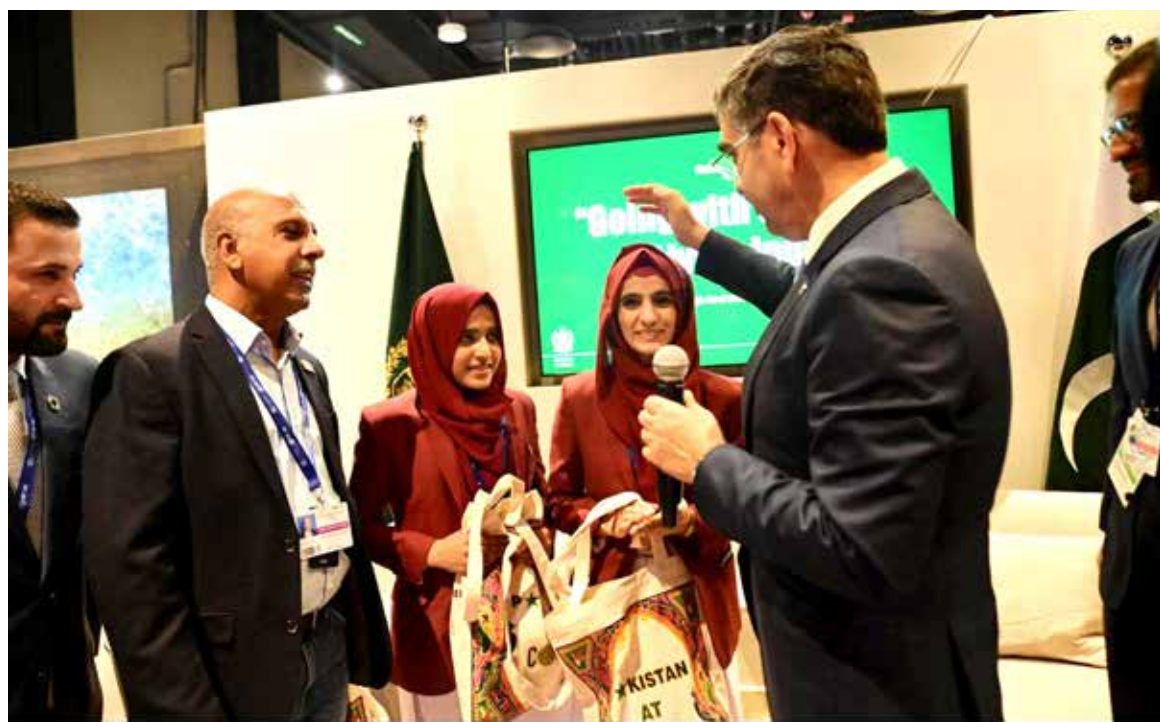
DUBAI: Caretaker Prime Minister Anwaar-ul-Haq Kakar meets the Pakistani students who won the award in one of the categories of Zayed Sustainability Awards 2023.