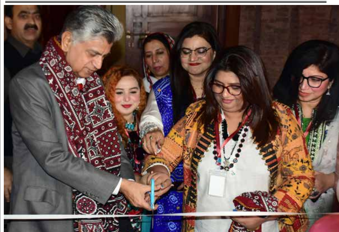
ISLAMABAD: Caretaker Federal Minister for Information and Broadcasting Murtaza Solangi cutting the ribbon to inaugurate Women celebrating Sindhi Culture Day 2023, at Pakistan National Council of the Arts in the Federal Capital.

industries and exports to bridge the current account and trade deficits. Cleaner energy would also be supportive of mitigating the effects of climate change if we addressed these issues as a priority and decarbonized our country by overcoming our dependency on fossil fuels.