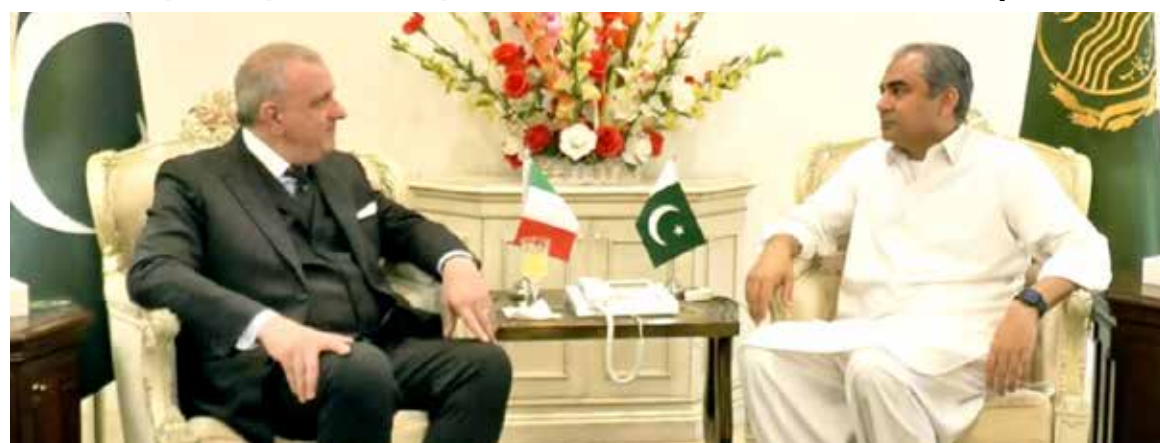
LAHORE: Ambassador of Italy Andreas Ferrarese in a meeting with Punjab Chief Minister Mohsin Naqvi, in Lahore on Sunday.

a new dimension with the exchange of mutual trade and cultural delegations. We are commencing One Window Operation for the investors in Punjab. All NOCs will be available under a single roof through the One Window Operation. There are ample investment opportunities available in Punjab for the Italian investors. CM Mohsin Naqvi thanked the Italian Ambassador for the support extended by Italy for GSP Plus Status. The Italian Ambassador underlined the ongoing cooperation with the Punjab government in various sectors will further be promoted.