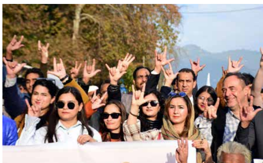
ISLAMABAD: Participants flash victory sign during a walk titled "International Day of Persons with Disabilities in front of Ministry of Foreign Affairs in Federal Capital.

allowing them to be truly independent". She also highlighted that Islamabad Serena Hotel has become the pioneer in the industry by implementing a sign language interpretation service to make their hotel accessible. She expressed gratitude towards Serena Hotels for both organizing the accessibility walk in Islamabad and for demonstrating a sincere commitment to this initiative. Serena Hotels has consistently endeavoured to play its role in raising awareness through various initiatives under the umbrella of Public Diplomacy and take pride in providing platform and in collaborating with organizations such as ConnectHear, who are dedicated to tirelessly ensuring people's right to access essential services. Together, we strive to make a meaningful impact and contribute to positive change.