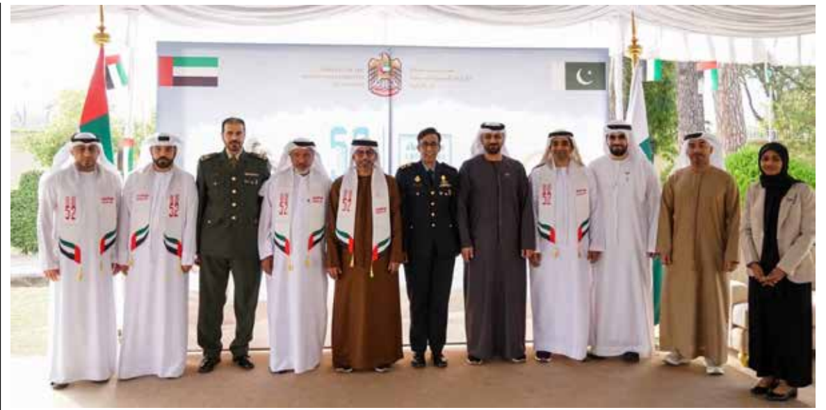
ISLAMABAD: Ambassador of UAE Hamad Alzaabi posing for a picture with the embassy staff on the occasion of the National Day of UAE.