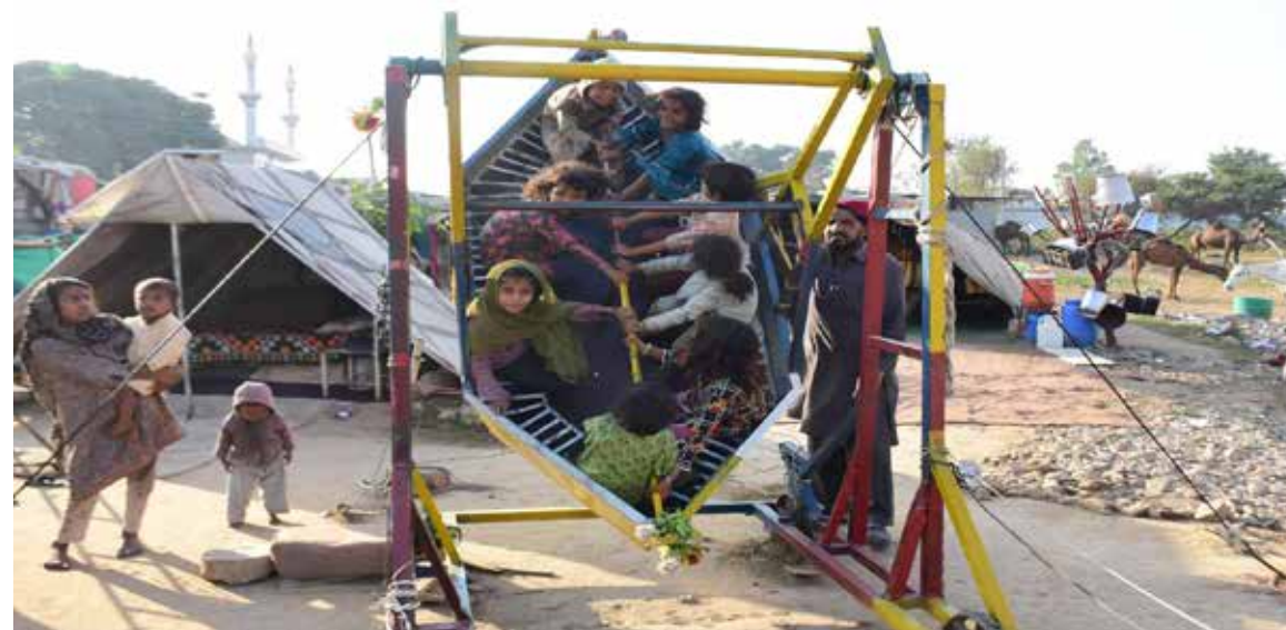
ISLAMABAD: Children are enjoying swing at their tent houses colony in the slum area of the Federal Capital.