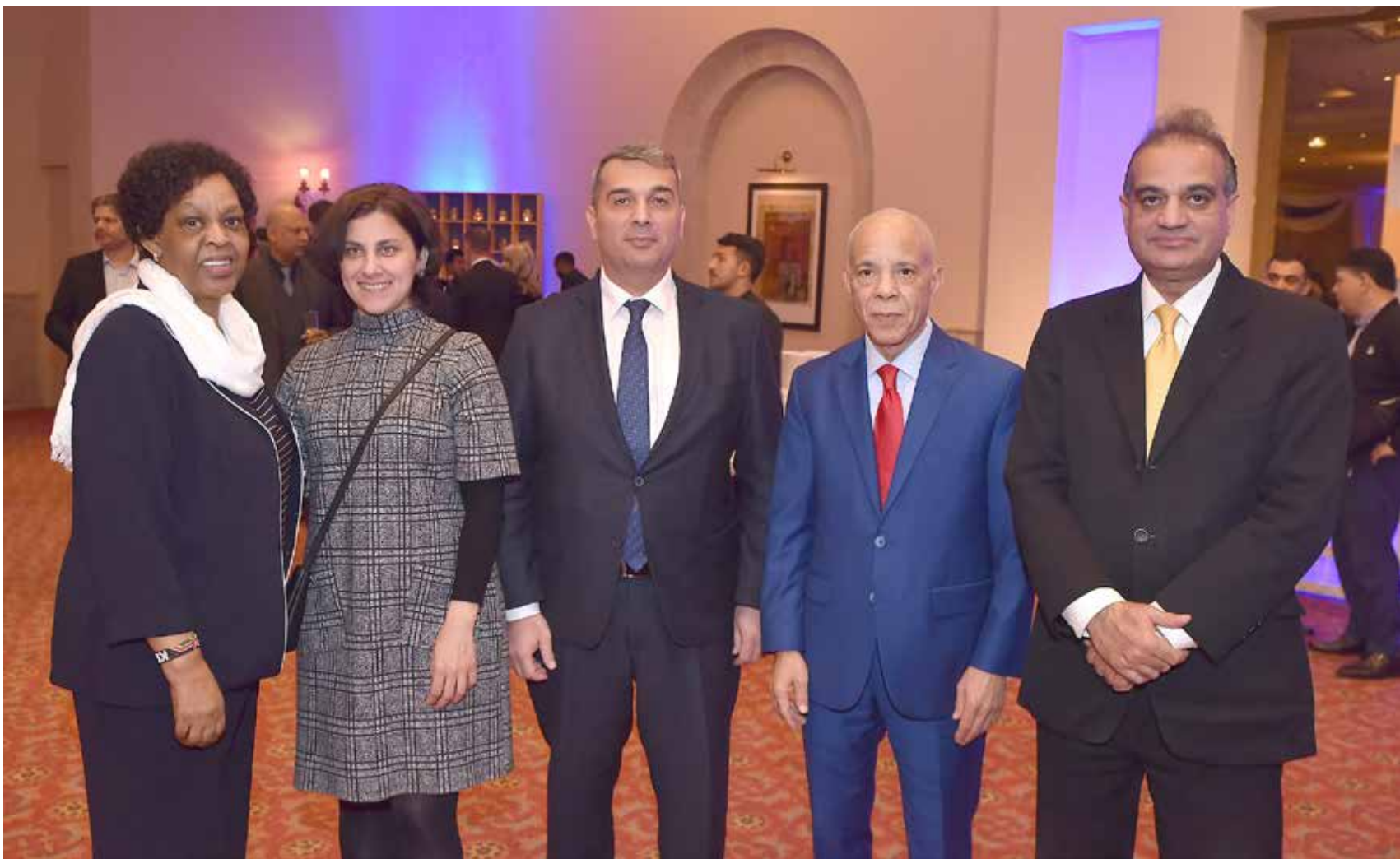
ISLAMABAD: Ambassadors of Kenya, Azerbaijan, Morocco and Editor Daily Islamabad POST posing for a picture on the occasion of the Independence Day of Finland.—DNA

ISLAMABAD: The Security and Exchange Commission of Pakistan (SECP) has successfully registered 27,746 new companies, reflecting a remarkable 4.7 per cent growth as compared to 3.8 per cent in the previous year. This brings the total number of registered companies to an impressive 196,805, according to an annual report issued here by SECP. The annual report said that the current financial year 2022-23, has witnessed significant progress in Pakistan's corporate sector landscape. The strategic use of automation and process optimisation has materialised, with over 99.8 per cent of enterprises registering online and 24 per cent completing registration on the same day, benefiting entrepreneurs, shortening business launch procedures, and demonstrating commitment to efficiency, the report added. The report said that among the companies registered during the financial year 2022-23, approximately 58 per cent were registered as private limited companies, 39 per cent as single-member companies, and the remaining three per cent were registered either as public unlisted, not-for-profit associations, trade organisations, foreign companies, or limited liability partnerships. Breaking down the figures further, out of the 27,746 companies registered in this period, 9,264 were registered in Islamabad, 10,904 in Punjab, 4,251 in Sindh, 2,136 in KPK, 538 in Baluchistan, and 653 in Gilgit Baltistan.—DNA