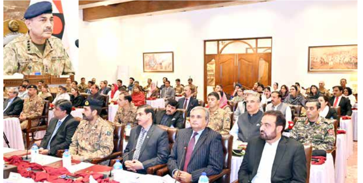
PESHAWAR: Chief of Army Staff (COAS) General Syed Asim Munir during his visit to Peshawar talking to civil and military leadership.