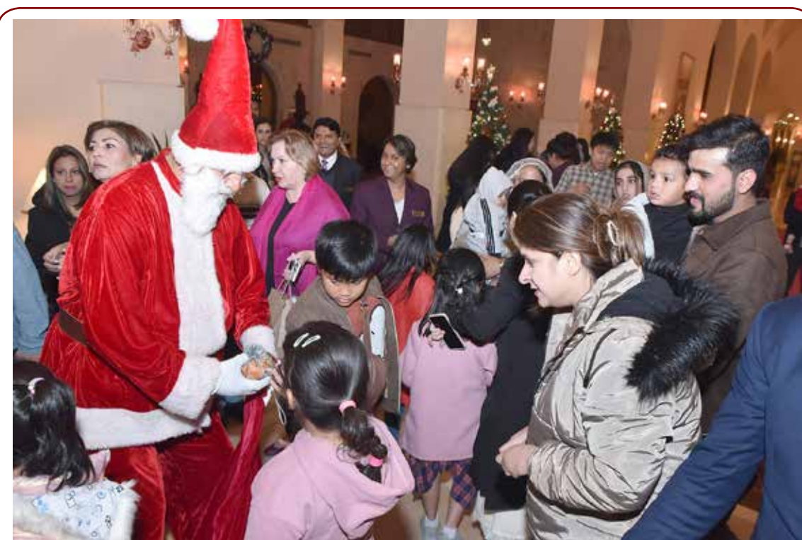
ISLAMABAD: Santa Claus interacts with guests during the Christmas tree lighting ceremony at Islamabad Serena Hotel.

vation season begins, urea fertilizer disappears from the market, and the farmers have to buy it from the black market at high prices. He said that due to the high cost of urea, its use is reduced, which affects production, and the government has to spend a lot of foreign exchange to import wheat. Now, he warned that farmers are protesting all over the country, and the food security situation is feared to be affected.