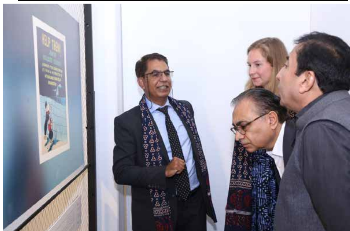
ISLAMABAD: Visitors taking interest in paintings on the occasion of 75 years of Netherlands - Pakistan relations.

were removed from footpath areas and they were warned to follow rules otherwise strict action would be initiated against them. During the ongoing Year, the Islamabad Capital Police also issued 12,819 fine tickets to those involved in wrong parking while several vehicles were impounded at police stations for not vacating footpath areas. The CTO Islamabad said that it is our top priority to ensure convenience for road users by maintaining traffic discipline and every possible effort would be made for the purpose. He said that squads have been constituted for the purpose of removing illegal parking and vacating footpaths while indiscriminate action would be taken against violators. He said that this operation would be extended to the other areas of Islamabad and smooth traffic flow to be ensured.