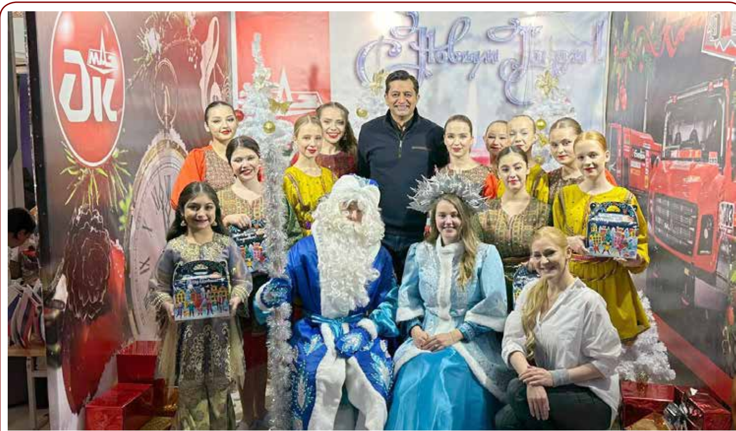
MINSK: The Embassy of Pakistan Minsk participated in the Annual Charity Bazaar of the Minsk International Women's Club held on 9 December 2023 in Minsk. Several other embassies and private sector organisations also took part in the event.

BANDA ACEH : More than 300 Rohingya refugees, mostly women and children, were stranded on the coast of western Indonesia Sunday after being adrift at sea for weeks, the latest in the biggest wave of arrivals since 2015. A group of 180 refugees from the persecuted Myanmar minority arrived by boat at 3:00 am local time (2000 GMT Saturday) on a beach in the Pidie regency of Aceh province. Another boat carrying 135 refugees landed in neighbouring Aceh Besar regency hours later after being adrift at sea for more than a month. The mostly Muslim Rohingya were the target of a 2017 crackdown by Myanmar's military that is the subject of a UN genocide probe. Around a million have fled to Bangladesh, and from there thousands risk their lives each year on long and expensive sea journeys to reach Malaysia or Indonesia. —APP