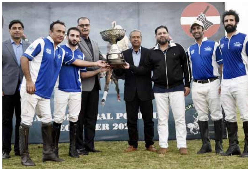
After an exciting contest in the final, FG/Din Polo lost by half a goal handicap. A large number of spectators were present at the Jinnah Polo Fields to watch the final match