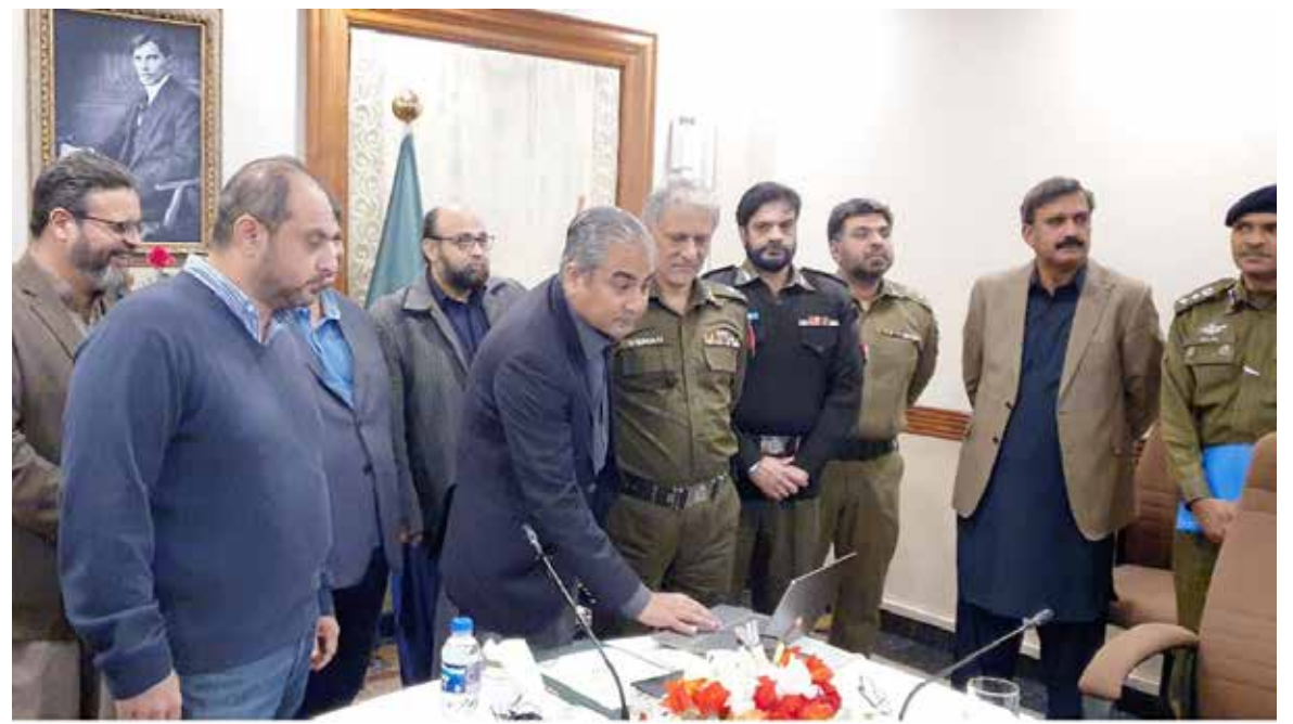
LAHORE : Punjab Chief Minister Mohsin Naqvi is formally launching the online learning driving license app for the convenience of citizens.—DNA