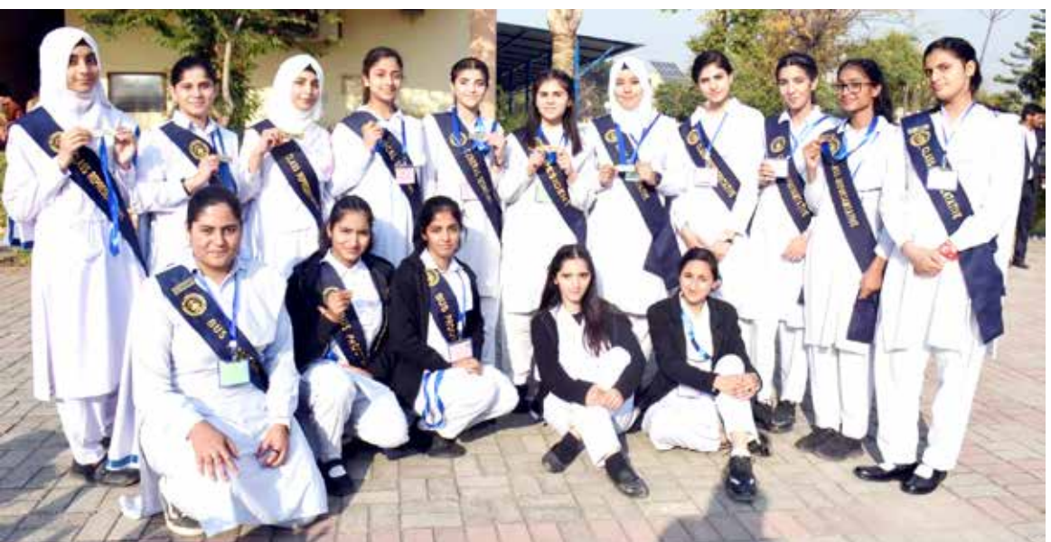
ISLAMABAD: Newly elected office bearers of students council of IMCG i8/3 pose for group photo in Oath taking ceremony held on Monday. – DNA

into four groups. Group A features defending champions India alongside Bangladesh, Ireland and the United States of America (USA), while Group B consists of England, South Africa, West Indies, and Scotland. Two-time champions Pakistan are placed in Group D alongside Afghanistan, New Zealand and Nepal while Australia, Sri Lanka, Namibia and Zimbabwe were placed in Group C. The top three sides from each group progress to the Super Six phase of the event. The top four teams at the conclusion of the Super Six stage will then advance to the semi-finals, scheduled on February 6 and 8. Meanwhile, the final of the ICC U19 Men's Cricket World Cup will take place on February 11 in Benoni. South Africa will host the U19 World Cup for the third time, having previously hosted the 1998 and 2020 editions. Notably, the International Cricket Council (ICC) awarded the hosting rights of the mega event to South Africa as a consequence of the apex cricket body's provisional ban on Sri Lanka Cricket (SLC). For the unversed, the ICC suspended SLC's membership after the latter had failed to ensure there was no government interference in its affairs. – DNA