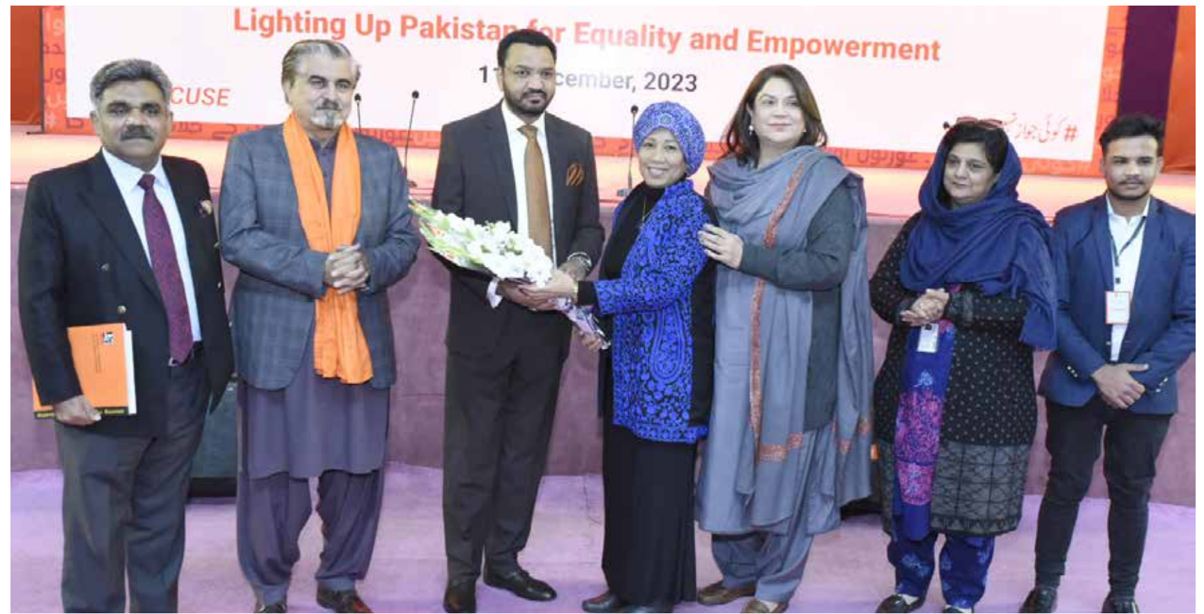
ISLAMABAD: Sharmeela Rassool the Country Representative of UN Women Pakistan giving bouquet to Minorities Minister Khalil George. Culture Minister Jamal Shah and Secretary NCSW Khwaja Imran Raza also present on the occasion.

ISLAMABAD: The capital city of Islamabad has successfully concluded the #KoiJawazNahi 16 Days Campaign, a collaborative initiative by UN Women, generously funded by the Government of Japan. This landmark campaign not only addressed the critical issue of violence against women and children but also marked the celebration of the 50th Anniversary of the Constitution of Pakistan, reinforcing the commitment to fundamental rights and equality. Nilofar Bakhtiar, Chairperson of National Commission on the Status of Women in her welcome speech said, "As we conclude these 16 Days of activism, let's intertwine the principles of our Constitution with the dynamic spirit of the Trade Fair. Through collective effort and economic exchange, let's pave the way for a Pakistan where equality flourishes, violence dissipates, and prosperity blossoms for every citizen of Pakistan". The 16 Days of Activism against Gender-Based Violence is an international civil society-led annual campaign. It commences from 25 November, the International Day for the Elimination of Violence against Women, and ends on 10 December, Human Rights Day, indicating that violence against women is the most pervasive breach of human rights worldwide. While addressing the audiences, Sharmeela Rassool the Country Representative of UN Women Pakistan, stated "Our #KoiJawazNahi campaign stands shoulder to shoulder with Pakistan's Constitution, commemorating 50 years of justice and equality.