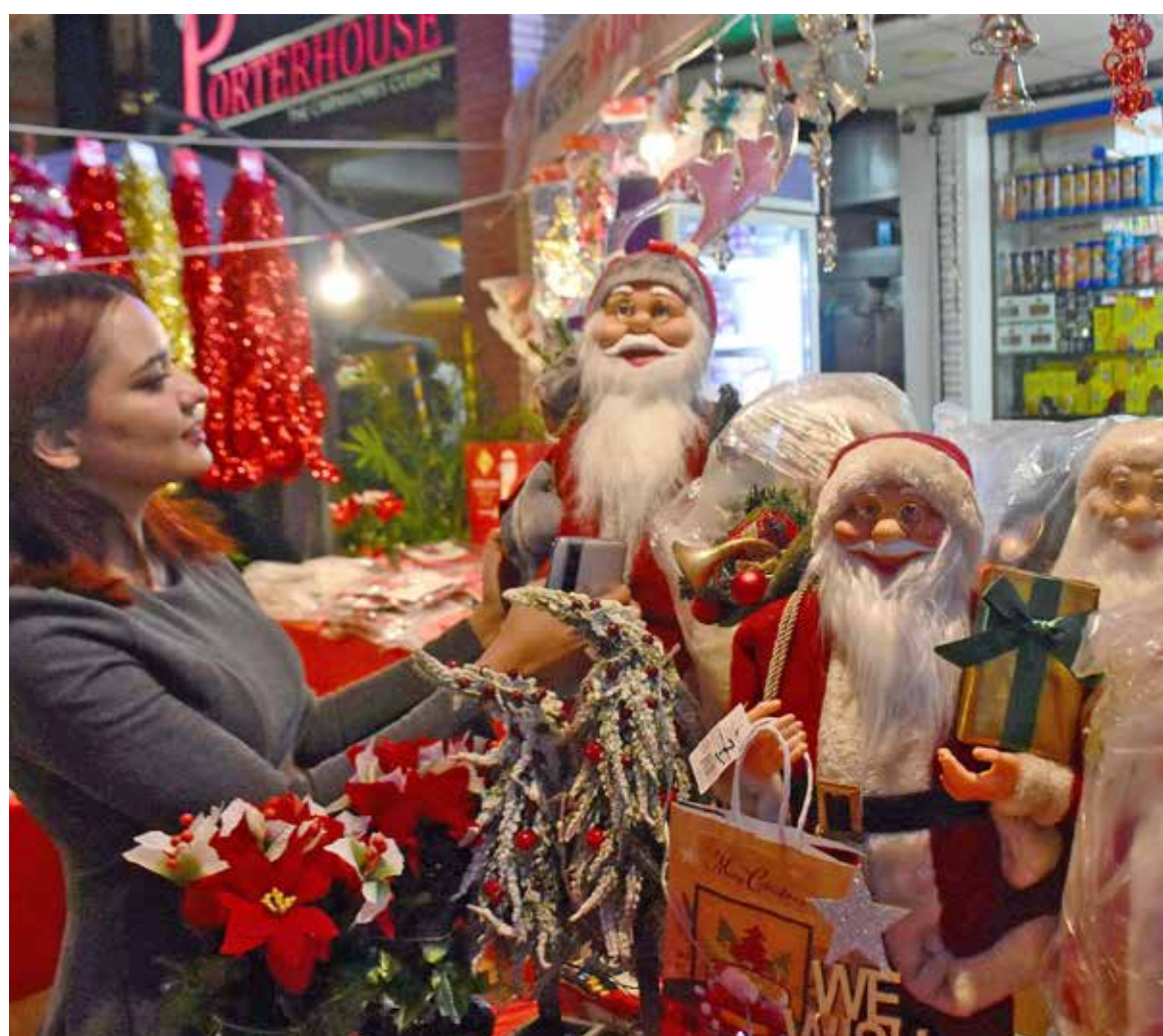
ISLAMABAD: A girl is taking keen interest in different kinds of stuff on Christmas stall at Koshar Market in Federal Capital.