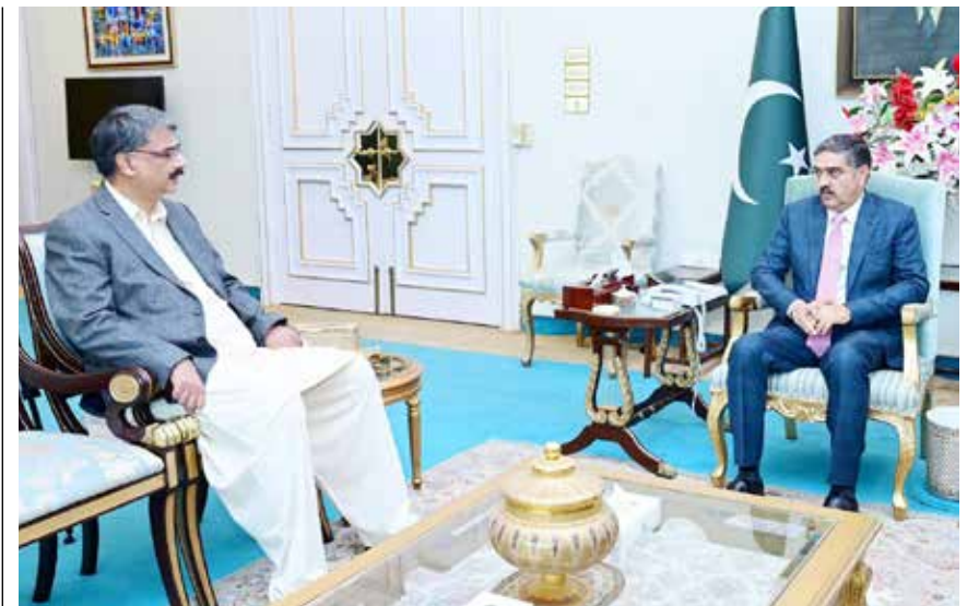
ISLAMABAD: Prime Minister of Azad Jammu and Kashmir Ch. Anwaar-ul-Haq calls on the Caretaker Prime Minister Anwaar-ul-Haq Kakar.