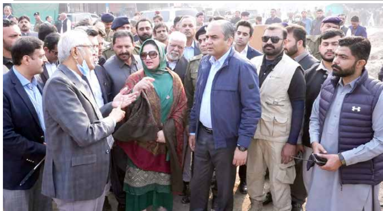
LAHORE: Caretaker Punjab Chief Minister Mohsin Naqvi is reviewing the construction works of Abdullahpur Jhamra Road Flyover Project.

KARACHI: In line with market expectations, the State Bank of Pakistan (SBP) maintained the key interest rate at 22% for the fourth straight Monetary Policy Committee (MPC) meeting as it awaits for the impact of previous hikes to filter through the economy and further tame high retail inflation. The bank's monetary policy committee said that an increase in gas prices last month could affect the inflation outlook. "The decision does take into account the impact of the recent hike in gas prices... the Committee viewed that this may have implications for the inflation outlook, albeit in the presence of some offsetting developments," the State Bank of Pakistan (SBP) said in the statement. The rate was raised to 22% in an off-cycle meeting in June as a last-gasp attempt to secure a $3 billion bailout from the International Monetary Fund (IMF) as part of a reforms programme aimed at bringing stability to the troubled $350 billion economy. Pakistan's economy has been beset by high price pressures, with monthly consumer price index-based inflation remaining above 20% since June 2022, and hitting a record high of 38% in May 2023.