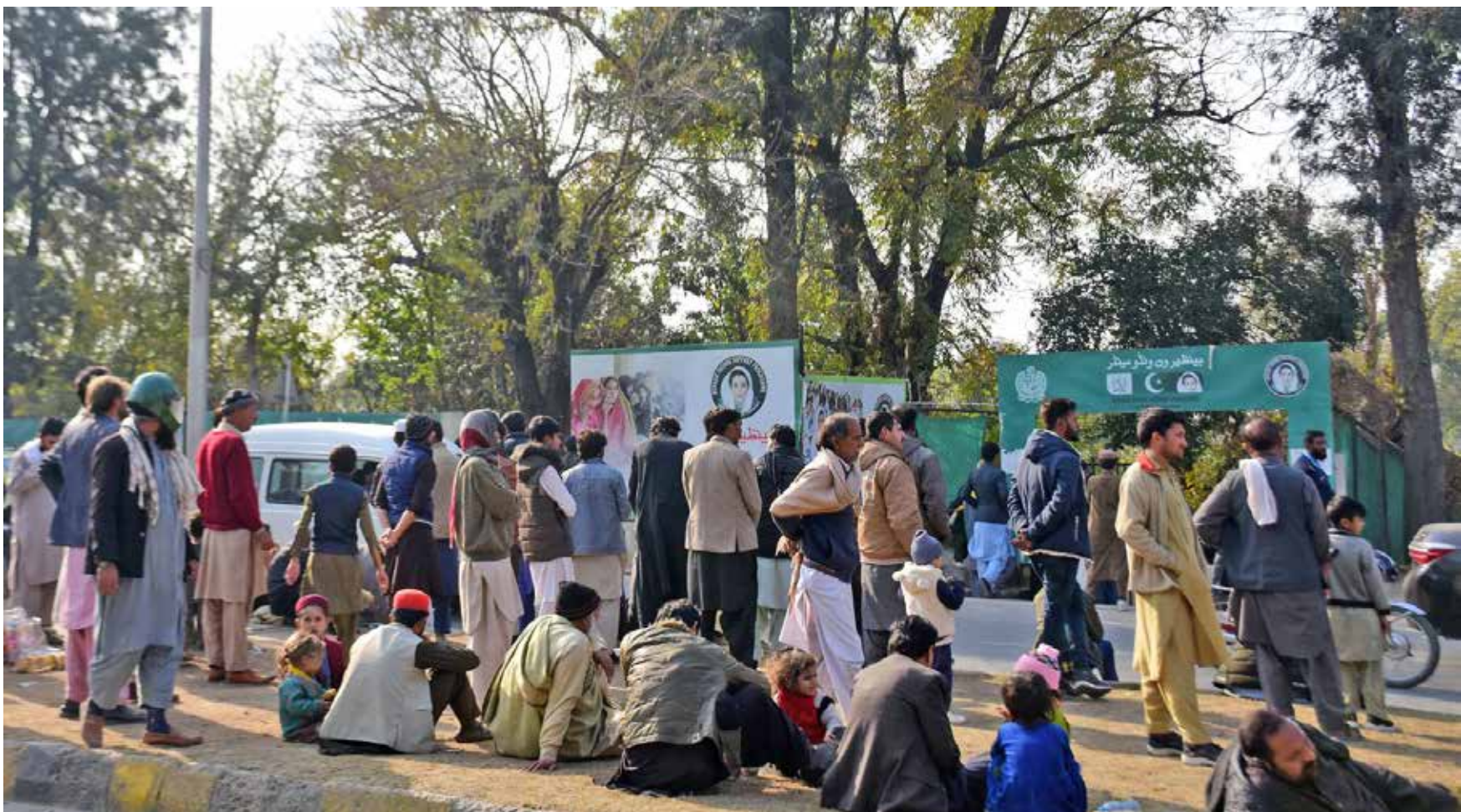
ISLAMABAD: Deserving people gathers outside Benazir Income Support Programme at Sector G-7 as such people are suffering due to lack of any kind of shelter or sitting facility, which is the insult of humanity, needs the attention of concern authority.