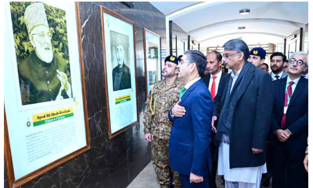
MUZAFFARABAD: Caretaker Prime Minister, Anwar-ul-Haq Kakar visits Yaadgar-e-Shuhda to pay tribute to the martyrs.