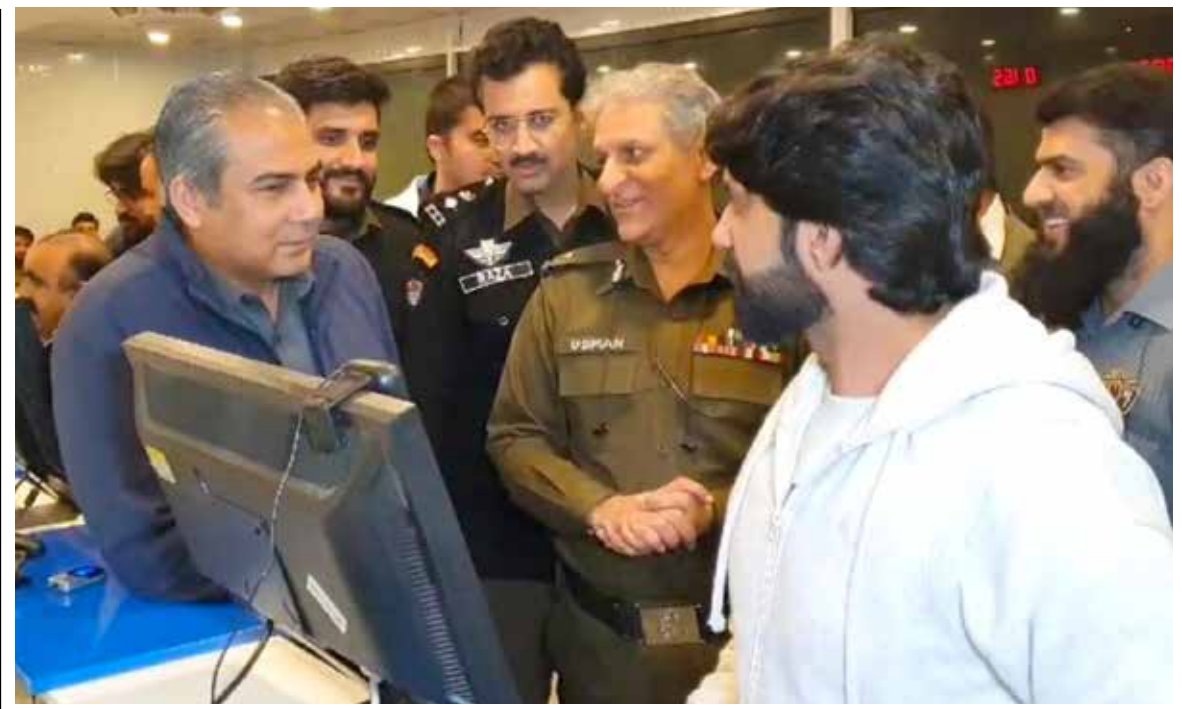
ISLAMABAD: Punjab Chief Minister Mohsin Naqvi is talking to citizens at the Liberty Police Service Center.

of scholars, new angles of thoughts will be opened, Iqbal's thoughts will be promoted and new ways will be found for solving political, social and national problems", he added. Jamal Shah further said that it was the efforts of our scholars that the tradition of understanding of Iqbal was progressing in a good way, adding that "we want to see Iqbal Academy, a national institution.—APP