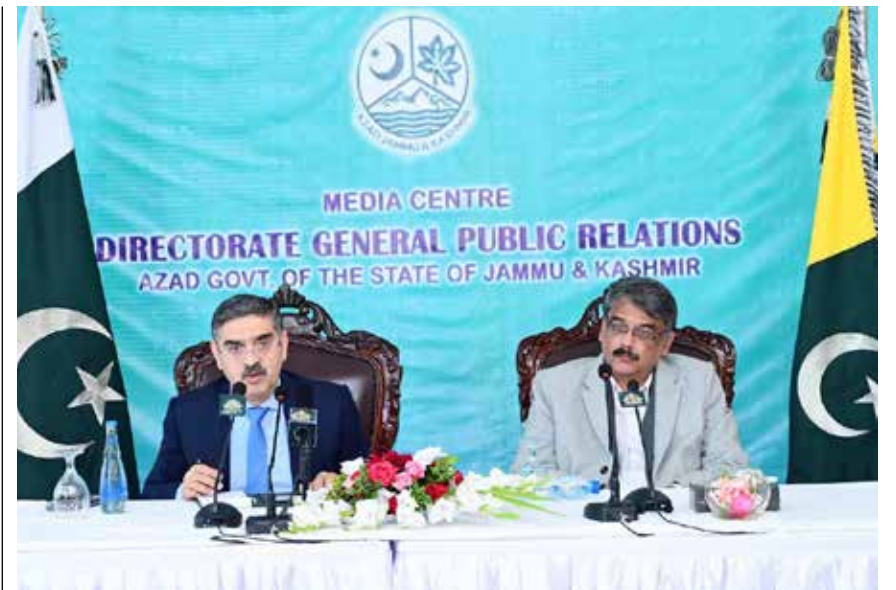
MUZAFFARABAD: Caretaker Prime Minister Anwaar-ul-Haq Kakar addresses a Press Conference along with the Prime Minister of Azad Jammu and Kashmir Ch. Anwaar-ul-Haq.