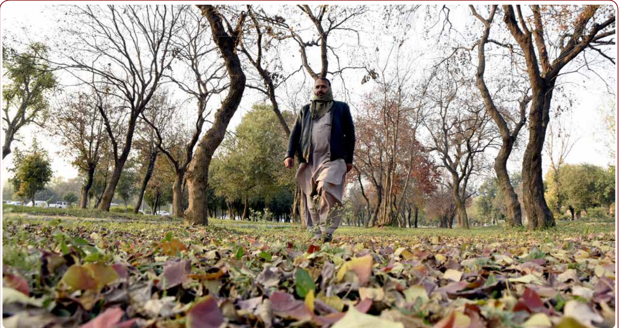
ISLAMABAD: A picturesque scene unfolds as fallen leaves pave the way for the arrival of a new season. Captured through the lens of Mudassar Raja, this photo encapsulates the subtle beauty of nature's transition. The earthy hues of the fallen foliage signal the changing landscape, marking the beginning of a season filled with transformation and renewal. — DNA

FROM PAGE 01 enforcement agencies to ensure peace and stability in the country. Meanwhile, at least two FC officials martyred and seven officials of FC and police sustained injuries in a militant attack on a joint check post of FC and police in Malik Deen Khel, in Teshil Bara, district Khyber.