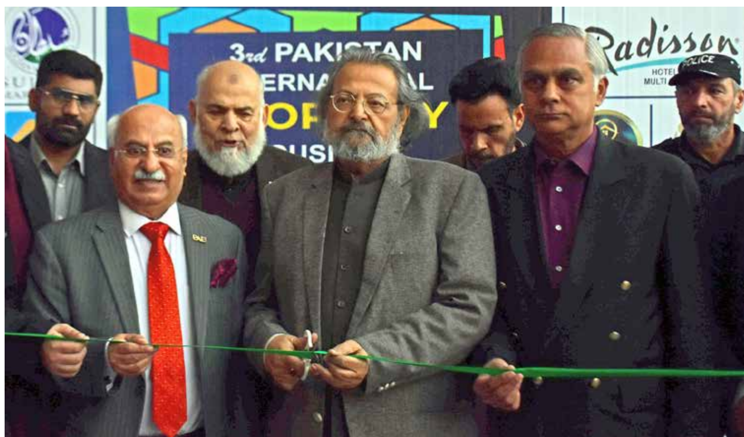
ISLAMABAD: Federal Minister Of Ministry Of Federal Education And Professional Training Madad Ali Sindhi cut the ribbon to inaugurate 3rd Pakistan International Property Expo at Pak China Friendship Center in Federal Capital.