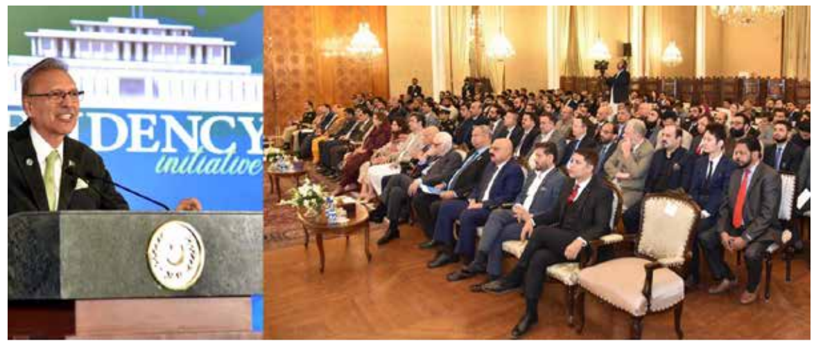
ISLAMABAD : President Dr Arif Alvi addressing the event to celebrate Award Winning Project Green Presidency, at Aiwan-e-Sadr.