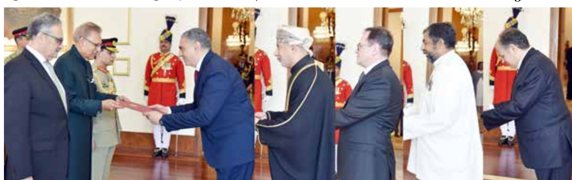
ISLAMABAD: Envoys of Egypt, Oman, Bosnia, Sri Lanka and Cyprus presenting their credentials to the President of Pakistan Dr. Arif Alvi.