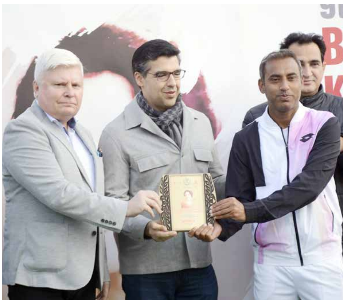
PESHAWAR: Ambassador of Czech Republic attended a Tennis match in Peshawar. He thanked the Peshawar Tennis Federation for inviting him to the final game.