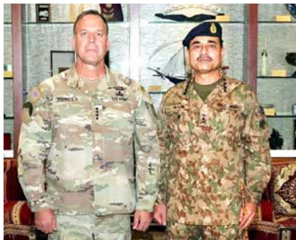
WASHINGTON: Chief of the Army Staff, General Asim Munir photographed with CENTCOM Chief during his ongoing US visit.

Bilateral interests, global and regional security issues, and ongoing conflicts were discussed during meetings