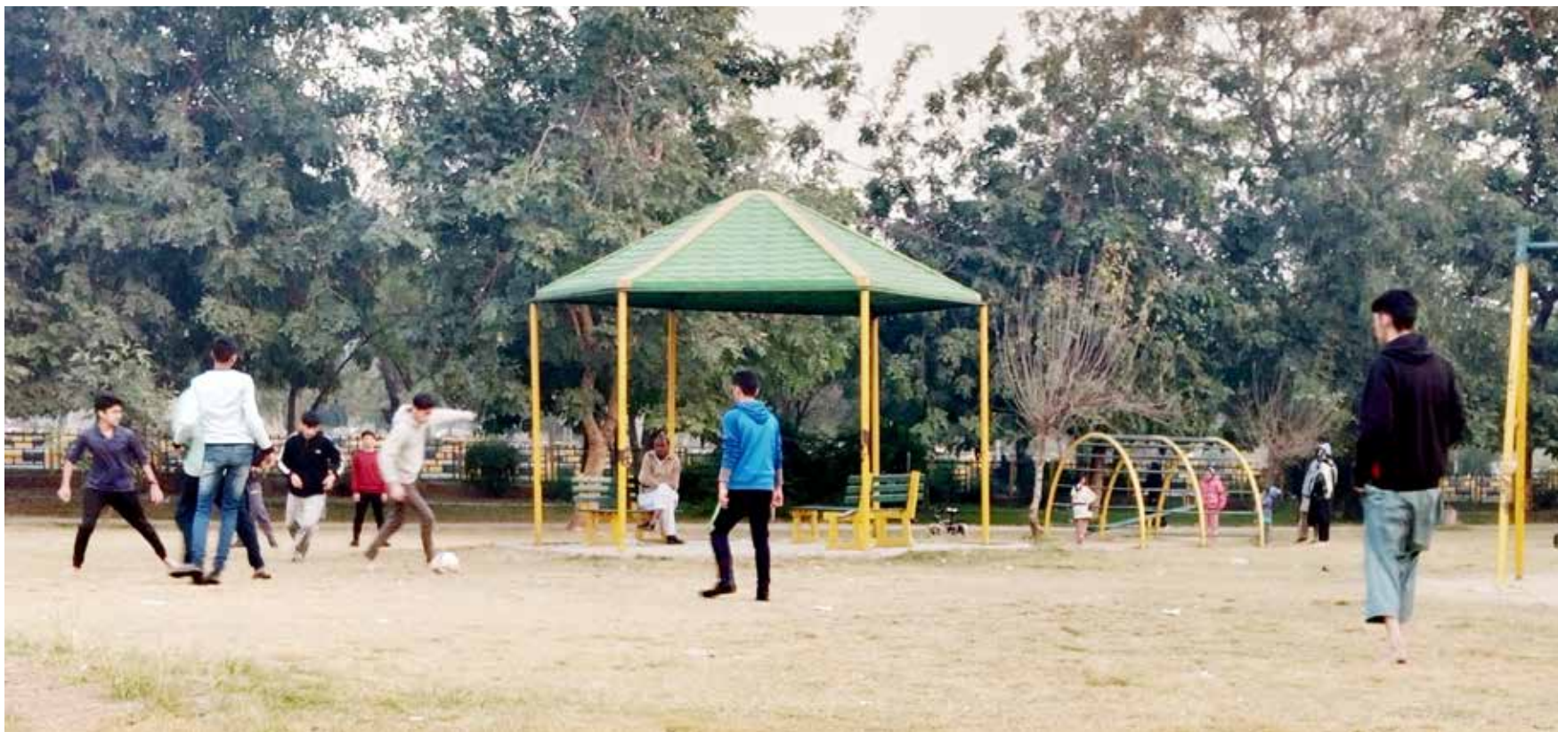
ISLAMABAD: Resident playing football in the G 8 Park, which is designated as the Ladies Park. Due to male presence ladies of the area find it difficult to take their children to the Park.

FROM PAGE 01 the promises and the actions of the PTI chief during his stint in power were as different as day and night. Talking about this previous run in government, he said the country was running well in 2017 as development projects were pursued. Talking about the projects, he said the foundation of the first motorway was laid in the same period while highlighting that the development projects were being executed at a rapid pace to provide relief to the masses. The PML-N leader claimed that had the same era continued, the country would have reached its destination today. As he said this, he lamented that those countries which were far behind Pakistan had gone ahead today.