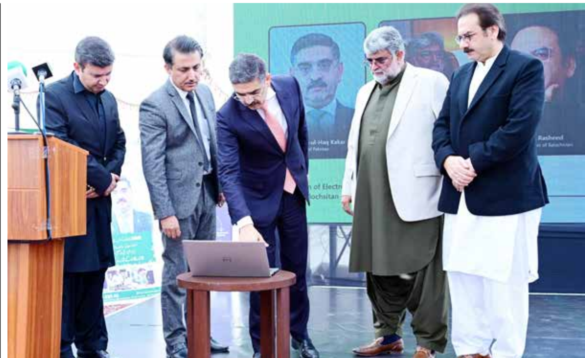
QUETTA: Caretaker Prime Minister Anwaar-ul-Haq Kakar launches the Electronic Public Procurement System of Balochistan.