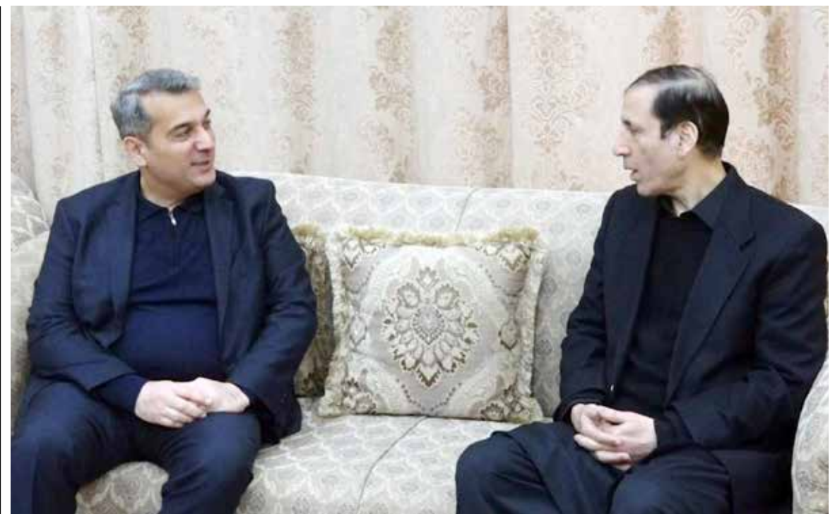
PESHAWAR: Ambassador of Azerbaijan Khazar Farhadov met with Syed Arshad Hussain Shah, Chief Minister of Khyber Pakhtunkhwa Province of Pakistan. Further deepening of the fraternal relations, especially the establishment of the sister city relations was the topic of discussion.