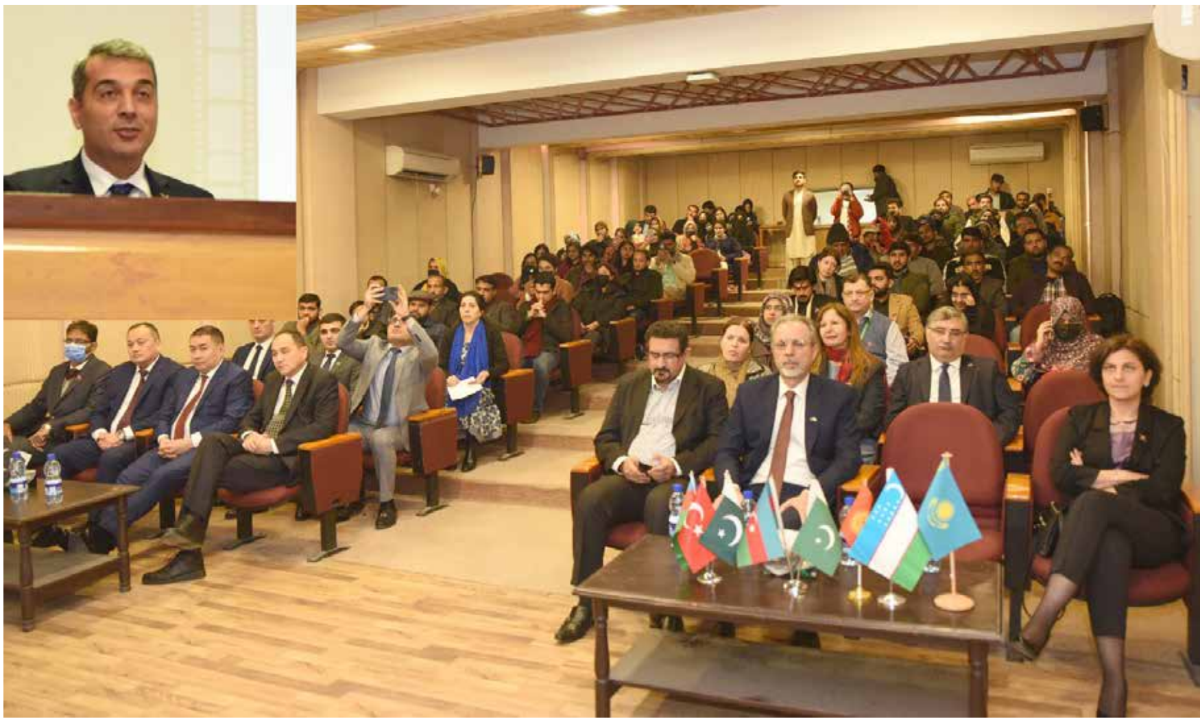
ISLAMABAD: Ambassador of Azerbaijan Khazar Farhadov briefs the audience about the latest situation in Shusha and other liberated areas.

Following the merger of FATA with the Khyber Pakhtunkhwa province, 12 National Assembly seats in FATA were eliminated, and six seats were added to the National Assembly seats of Khyber Pakhtunkhwa province, stated the spokesman. The spokesman mentioned that the National Assembly seats in Khyber Pakhtunkhwa have risen from 39 to 45, and the Provincial Assembly seats have increased from 99 to 115, with an additional 16 general seats. He emphasized that determining the seats of the National and Provincial Assemblies is the prerogative of the Parliament. The Election Commission is performing its duties according to the constitution and law without any pressure.—APP