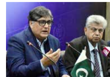
the Baloch protesters. "From the government side, Fawad Hasan Fawad spoke with the protesters," he added. The negotiation committee—headed

ISLAMABAD: Following widespread condemnations over the police crackdown against Baloch protesters in Islamabad, the caretaker federal government on Thursday clarified that the force was used to avoid a "catastrophe". Addressing a joint press conference flanked by caretaker ministers Fawad Hasan Fawad and Jamal Shah, Information Minister Murtaza Solangi said that in line with the directions of caretaker Prime Minister Anwaar-ul-Haq Kakar, a committee has been formed to hold talks with