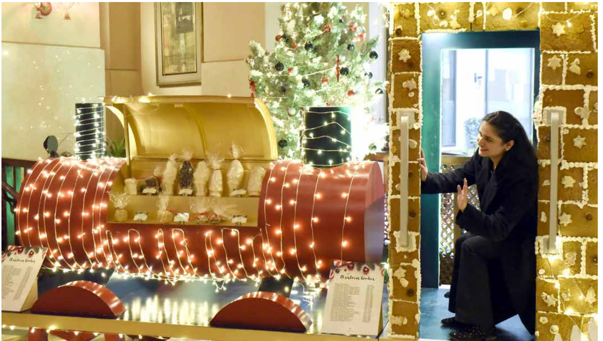
ISLAMABAD: "In the spirit of Christmas celebrations, a visitor admires the festive Christmas train exhibit at Islamabad Serena Hotel

FROM PAGE 01 In the meeting, both the minister and Ambassador expressed concern over the tense situation in Palestine. Expressing complete solidarity with the Palestinian people, Murtaza Solangi said that Jordan's role in aid activities in Palestine was commendable.