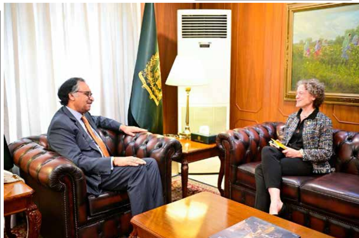
ISLAMABAD : High Commissioner of Canada in Islamabad, Leslie Scanlon, called on Foreign Minister Jalil Abbas Jilani. They discussed various aspects of Pakistan-Canada bilateral relations and facilitation by the Pakistani government for the resettlement process of Afghan nationals to Canada. The Canadian High Commissioner thanked the Foreign Minister for Pakistan's assistance in the resettlement process.—DNA