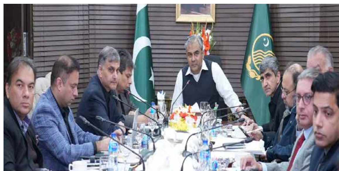
LAHORE : Chief Punjab Mohsin Naqvi is holding a special meeting of the Prime Minister to review the progress on the road project.