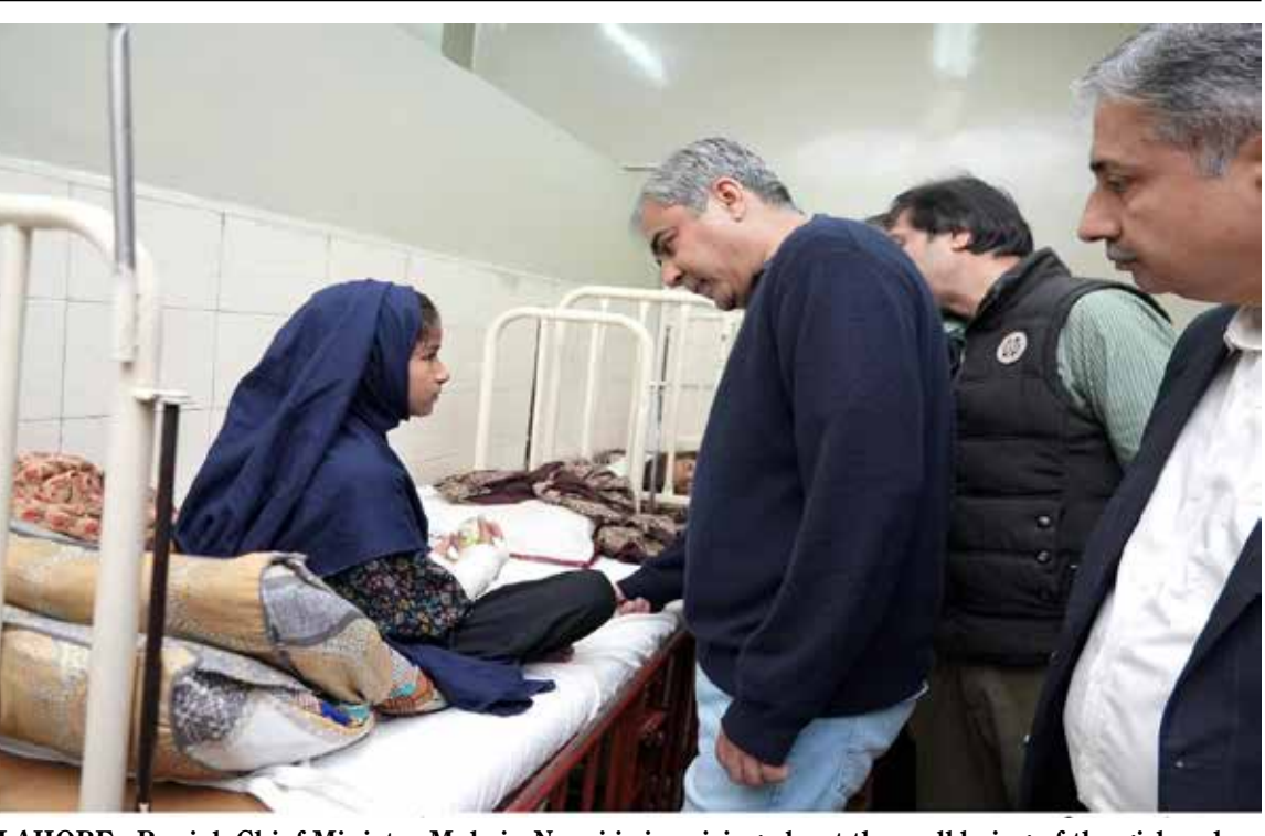
LAHORE: Punjab Chief Minister Mohsin Naqvi is inquiring about the well-being of the girl under treatment during his visit to the Children's Hospital.

essential training and awareness provided in 25 schools and activities in collaboration with the traffic police department in Islamabad. He expressed concern over the alarming rise in road accidents in the country and stressed the importance of adopting road safety rules. During the event, a documentary showcased the achievements of the PRCS Road Safety Project, sensitizing the public to road safety measures. Students from the Educator School Islamabad performed a tableau, emphasizing the need to follow road safety laws. In conclusion, Chairman Sardar Shahid Ahmed Laghari, along with the members of PRCS Managing Body and Heads of National Societies, distributed shields among the officers of ITP and NHMP who collaborated with PRCS under the Road Safety Project. Shields were also distributed among the representatives of private and government schools.