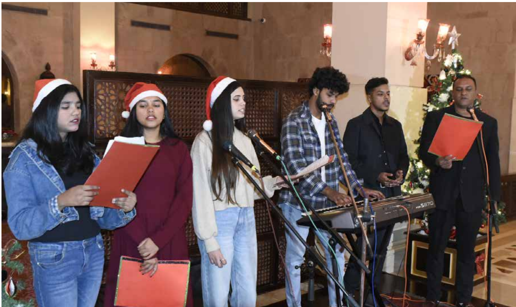
ISLAMABAD: Members of the Christian community taking part in Christmas celebrations at Islamabad Serena Hotel.

ISLAMABAD: National Conference President Farooq Abdullah has denounced the normalcy propaganda being paddled by the Modi-led Indian regime in Indian Illegally Occupied Jammu and Kashmir and asked for addressing the core issue of Kashmir through talks with Pakistan. According to Kashmir Media Service, talking in Srinagar, Farooq Abdullah said, militancy is alive in Jammu and Kashmir and it cannot be finished by the use of military or police, urging New Delhi to find ways to address its root cause. "Shouting normalcy or propagating tourist arrivals," he said adding that peace will not finish militancy which is still alive. Modi government, he said, is claiming that militancy has finished with the abrogation of Article 370 in 2019, but four years down the line, it is still there and will not finish till we try to understand its root, a reference to the lingering Kashmir dispute. He was reacting to the killing of retired police officer who was shot dead at his Gantmulla village in Baramulla district. "Those who are claiming normalcy are silent... they tried to heal the wounds in a superficial manner rather than addressing the root cause," Abdullah said. He said the Modi government has to find ways in the right perspective to end bloodshed in Jammu and Kashmir, and advised New Delhi that if it really wants to end militancy, it will have to "look for ways rather than claiming normalcy or talking about tourism.—APP