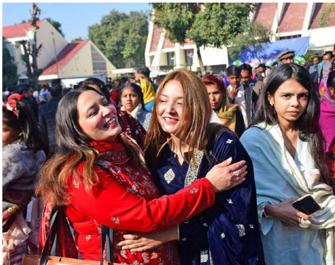
ISLAMABAD : Girls from Christen Community are greeting after Christmas mass at Fatima church at Sector F-8 during the Federal Capital.