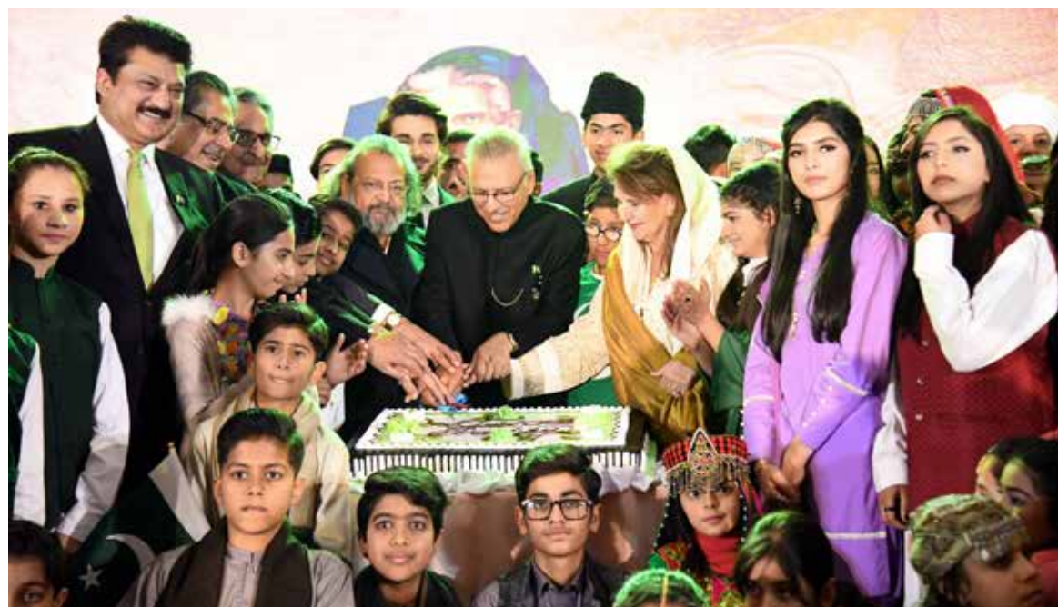
ISLAMABAD: President Dr Arif Alvi, First Lady Begum Samina Arif Alvi and federal ministers cutting cake to celebrate the 147th birth anniversary of Quaid-e-Azam Muhammad Ali Jinnah, at Aiwan-e-Sadr.