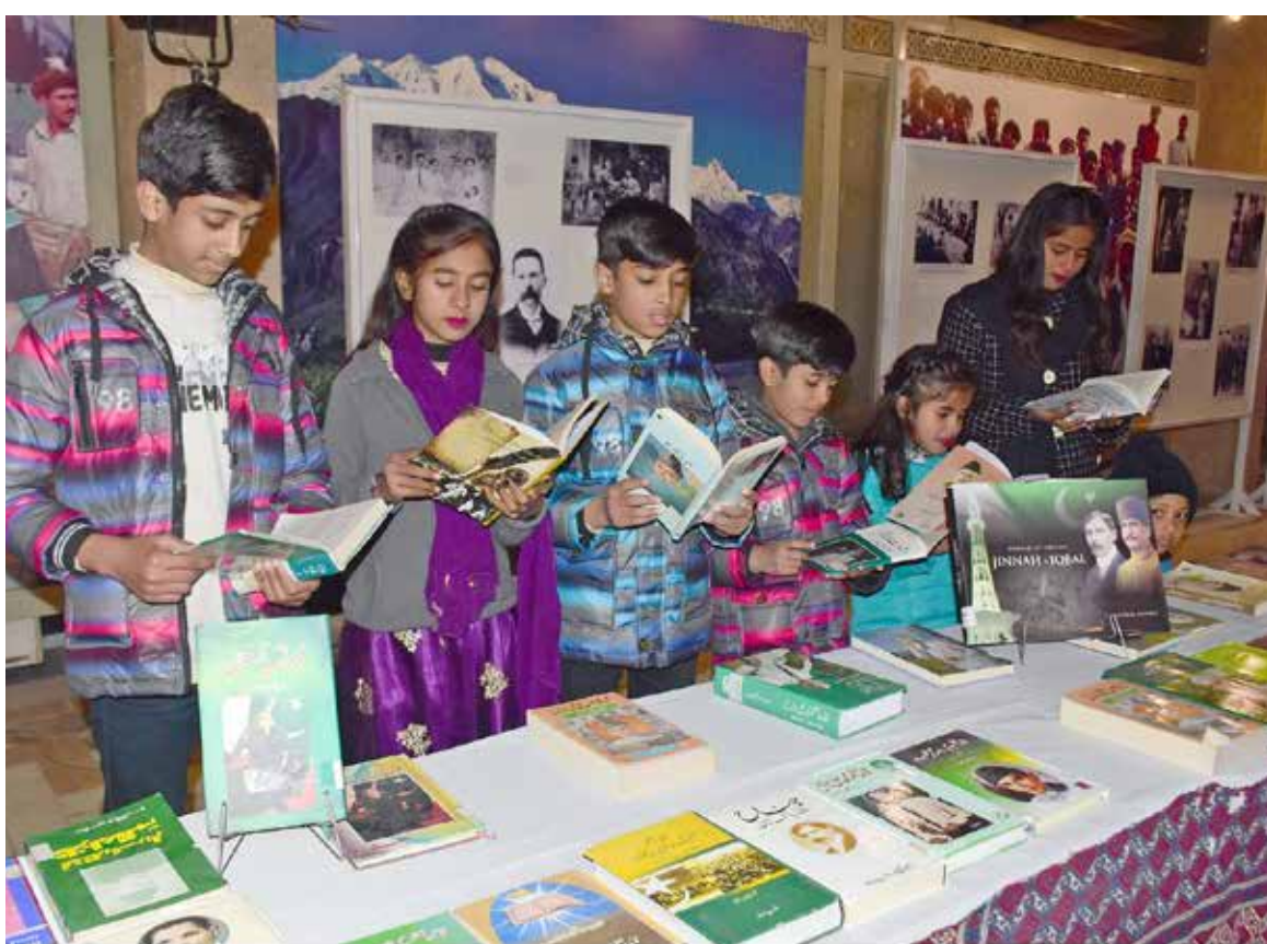
ISLAMABAD: Visitors reading books during Exhibition of Books and Photographs in connection with Quaid-i-Azam Day at Heritage Museum, Lok Virsa, in the Federal Capital.