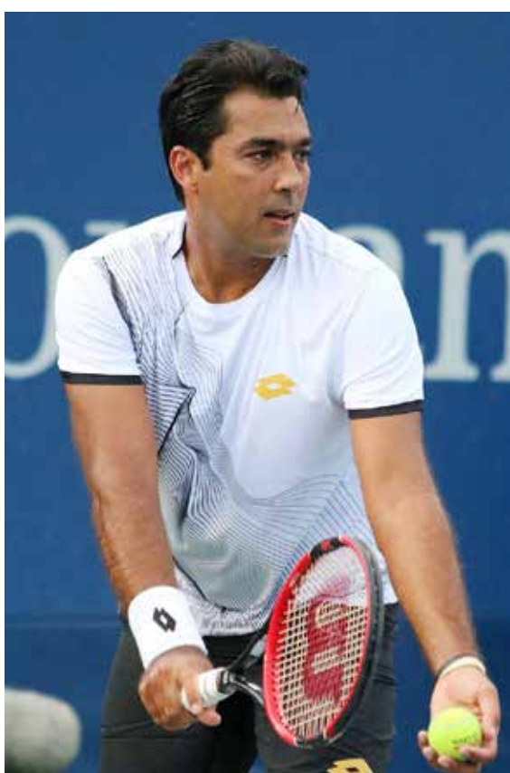
ISLAMABAD: Pakistan's tennis sensation, Aisam ul-Haq, recently engaged in an exclusive interview with media reporters, shedding light on the upcoming match against