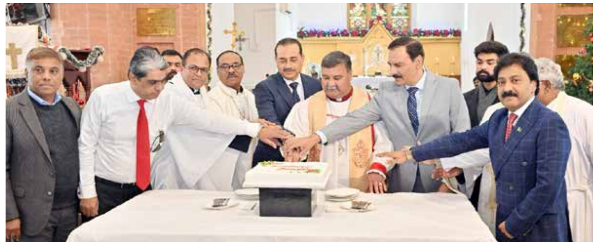
RAWALPINDI: General Syed Asim Munir, Chief of Army Staff (COAS) along with others cutting Christmas cake at Christ Church, Rawalpindi in Christmas celebrations.