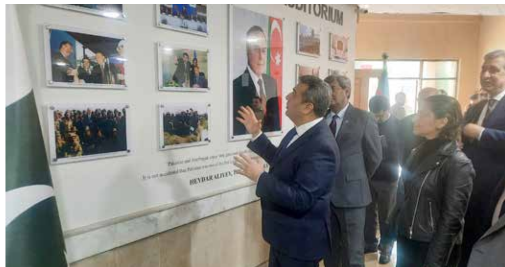
ISLAMABAD: Ambassador of Azerbaijan Khazar Farhadov briefing the audience about the inauguration of Heydar Aliyev Auditorium at NUST. The ambassador also briefed the audience about various pictures displayed in the Auditorium.