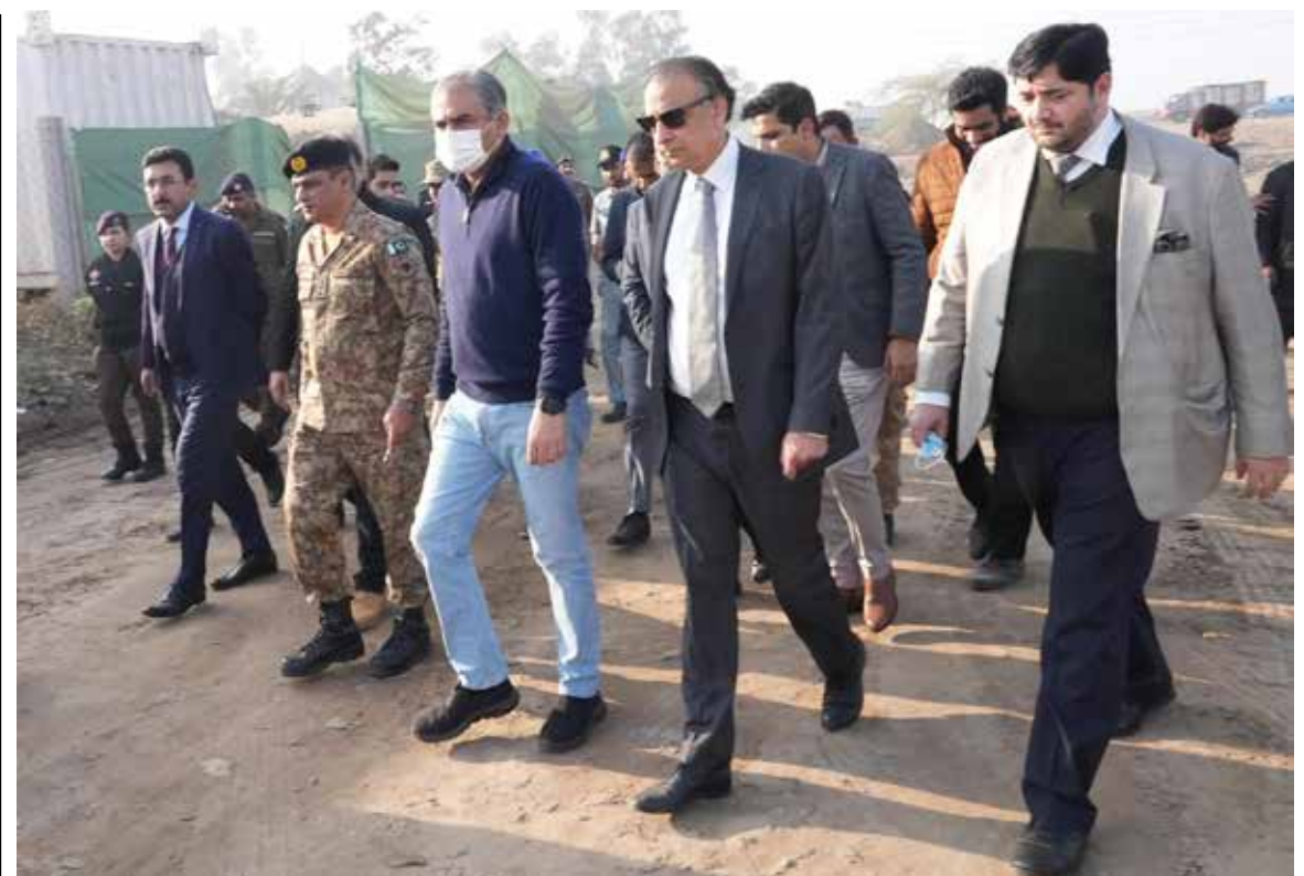
LAHORE :Punjab Chief Minister Mohsin Naqvi inspecting the ongoing construction works during a detailed visit to the Southern Loop 3 project of Lahore Ring Road.